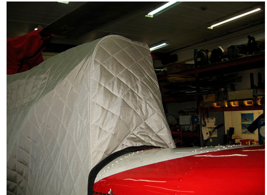
Alouette III Insulated Engine/Transmission Cover