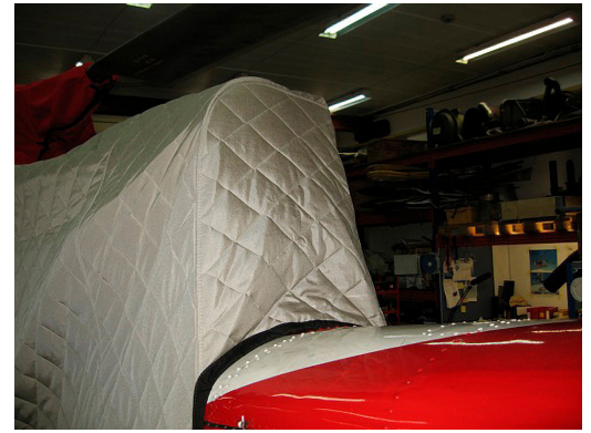
Alouette III Insulated Engine/Transmission Cover