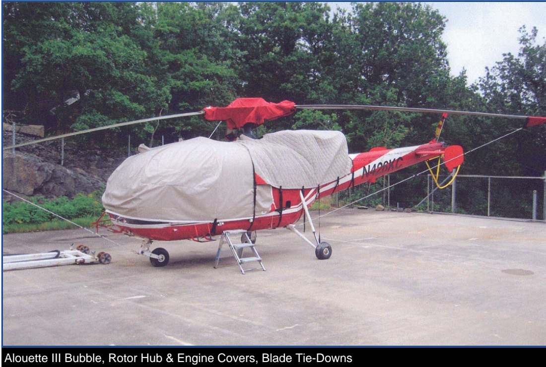
Alouette III Bubble, Rotor Hub & Engine Covers, Blade Tie-Downs