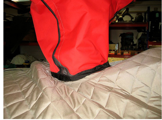
Alouette III Bubble, Rotor Hub & Engine Covers, Blade Tie-Downs