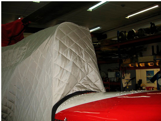
Alouette III Insulated Engine/Transmission Cover

WINTER USE MATERIAL - Made with Solution-Dyed Polyester fabric, this option is intended for seasonal use to aid in deicing, rain mitigation, or for occasional travel. The material is lighter and more compact, but more susceptible to UV damage and may have a shorter useful life if used continuously outside than the all-year use material.