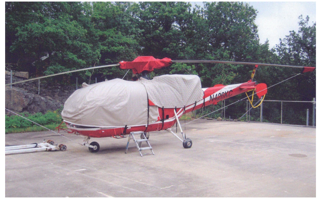
Alouette III Bubble, Rotor Hub & Engine Covers, Blade Tie-Downs