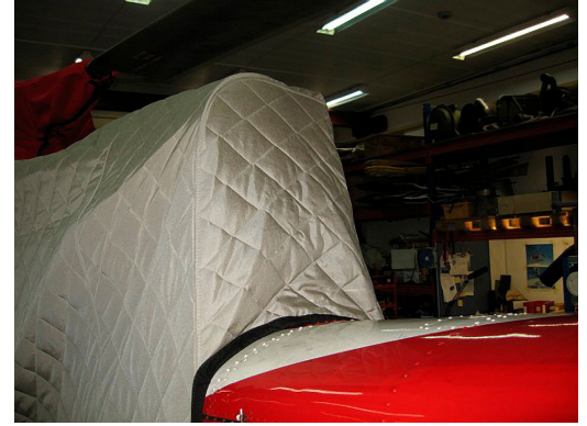
Alouette III Insulated Engine/Transmission Cover