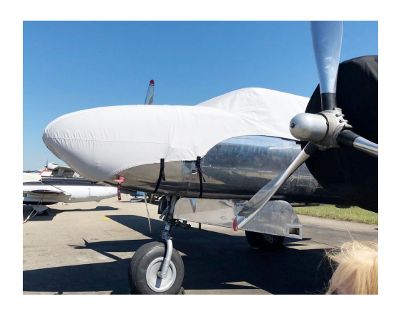
Douglas A26 Invader Cockpit/Nose Cover

the hottest of days. It is water, ice and snow repellent, yet breathable to allow moisture to escape from between the cover and the aircraft surface.