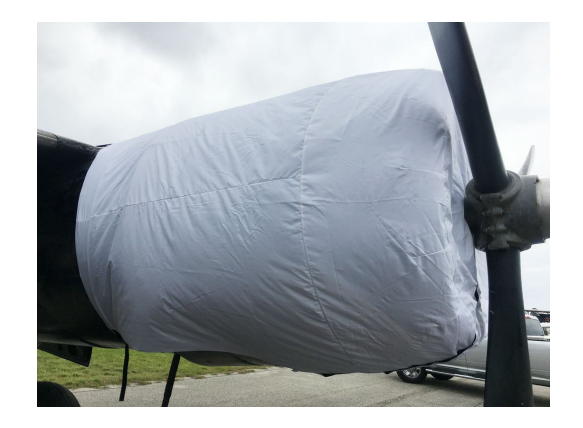
Douglas A-26 Engine Cover, test fit cover