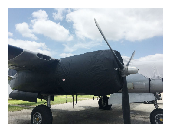
Douglas A-26 Engine Cover