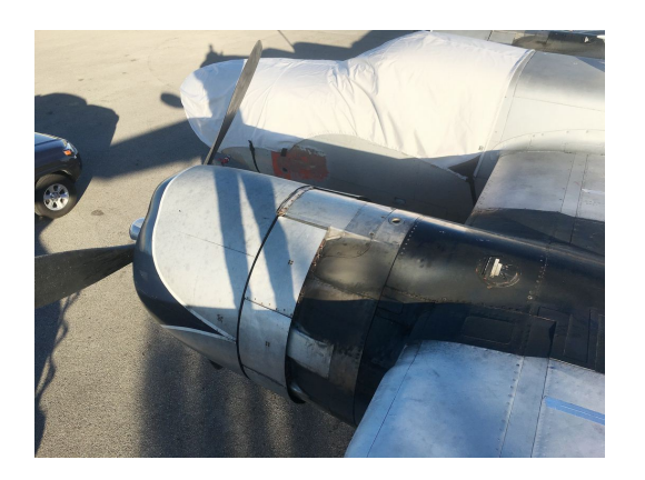
Douglas A-26 Cockpit/Nose Cover