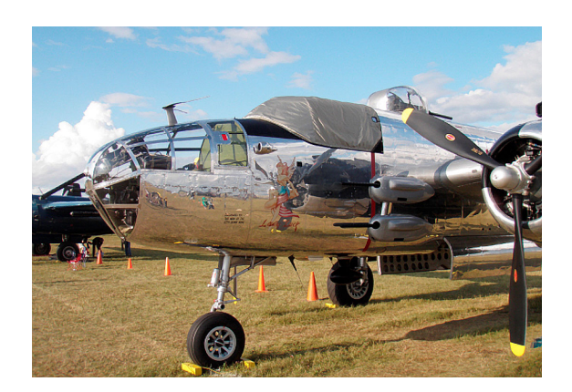
Mitchell B25 Cockpit Cover (Snap-On Type)

Engine Inlet Plugs are custom fit for your Douglas A26 Invader intakes, made with heavy-duty vinyl material, and stuffed with a single block of sculpted urethane foam. Each plug has a zipper that allows the foam to be removed and dried if necessary. Engine plugs have warning flags that are visible from the cockpit or 'remove before flight' streamers sewn onto the face of the plugs. Most plugs are imprinted with the aircraft registration number in black for an extra charge. Storage bag NOT included. Engine plugs may be inserted after flight when the engine is still warm. Engine Inlet Plugs are commonly referred to as Cowl Plugs, Intake Plugs, Cowl Blocks, Engine Blocks, and Engine Bungs.