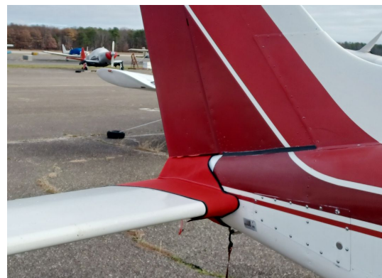
Beech C23 Sundowner Tailcone Cover, fully enclosed