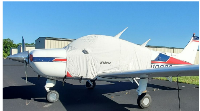
Beech C23 Sundowner Extended Canopy Cover