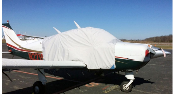
Beech Sundowner Extended Canopy Cover, Belly Strap Type