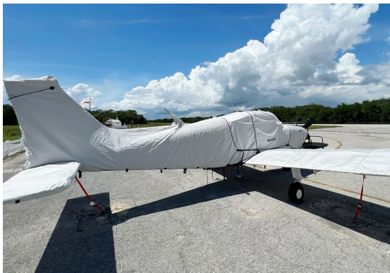
Beech Musketeer A23 Cover Set

This cover type is made from Silver Acrylic Sunbrella canvas and is 100% lined with a soft and smooth microfiber. Bruce's Custom Covers developed this material combination especially for aircraft protection. The outer material is medium weight and treated for water resistance, UV resistance and anti-static buildup. The inner lining is a very soft and smooth microfiber to prevent scratching. The material is very reflective, and tests show that the cabin interior temperature can be reduced to near-ambient temperature on the hottest of days. It is water, ice and snow repellent, yet breathable to allow moisture to escape from between the cover and the aircraft surface.