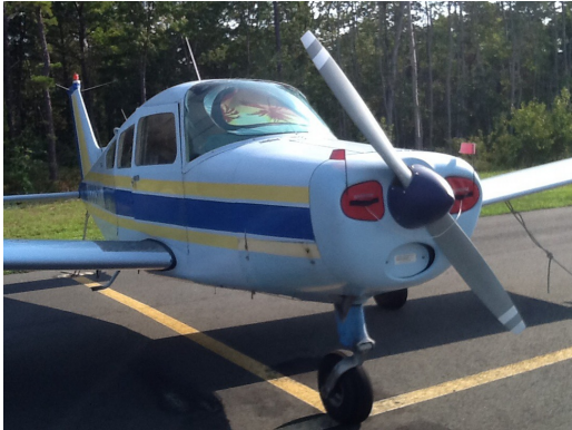
Beech Musketeer Engine Inlet Plugs

Engine Inlet Plugs are custom fit for your Beech Musketeer A23 intakes, made with heavy-duty vinyl material, and stuffed with a single block of sculpted urethane foam. Each plug has a zipper that allows the foam to be removed and dried if necessary. Engine plugs have warning flags that are visible from the cockpit or 'remove before flight' streamers sewn onto the face of the plugs. Most plugs are imprinted with the aircraft registration number in black for an extra charge. Storage bag NOT included. Engine plugs may be inserted after flight when the engine is still warm. Engine Inlet Plugs are commonly referred to as Cowl Plugs, Intake Plugs, Cowl Blocks, Engine Blocks, and Engine Bungs.