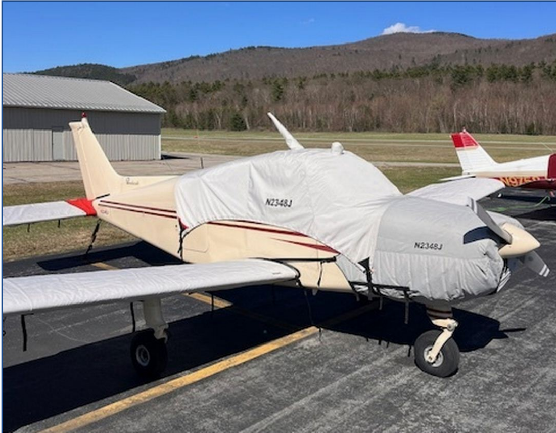
Beech A23 Musketeer Canopy, Insulated Engine, Wing Covers