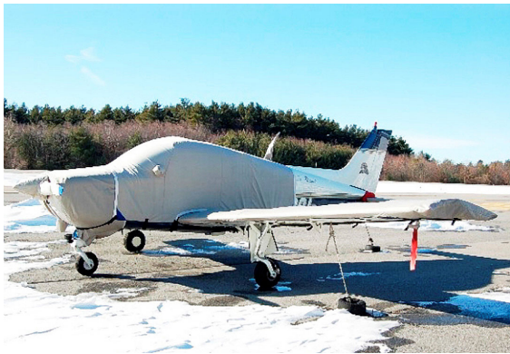
Prop, Engine, Extended Canopy, Wing, Tailcone, and Horizontal Stab Covers

This cover type is made from Silver Acrylic Sunbrella canvas and is 100% lined with a soft and smooth microfiber. Bruce's Custom Covers developed this material combination especially for aircraft protection. The outer material is medium weight and treated for water resistance, UV resistance and anti-static buildup. The inner lining is a very soft and smooth microfiber to prevent scratching. The material is very reflective, and tests show that the cabin interior temperature can be reduced to near-ambient temperature on the hottest of days. It is water, ice and snow repellent, yet breathable to allow moisture to escape from between the cover and the aircraft surface.