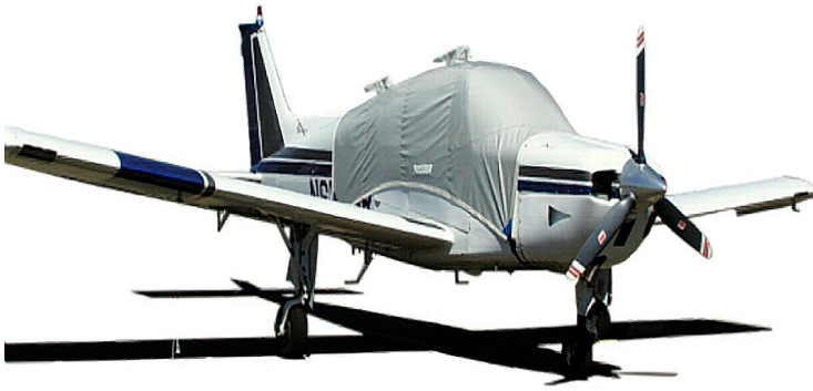
Beech Sport Canopy Cover