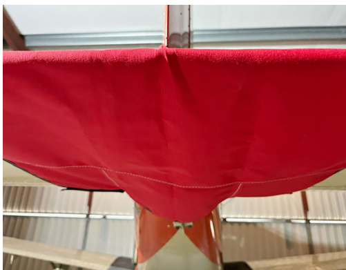
Beech C24R Tailcone Cover, fully enclosed

WINTER USE MATERIAL - Made with Solution-Dyed Polyester fabric, this option is intended for seasonal use to aid in deicing, rain mitigation, or for occasional travel. The material is lighter and more compact, but more susceptible to UV damage and may have a shorter useful life if used continuously outside than the all-year use material.