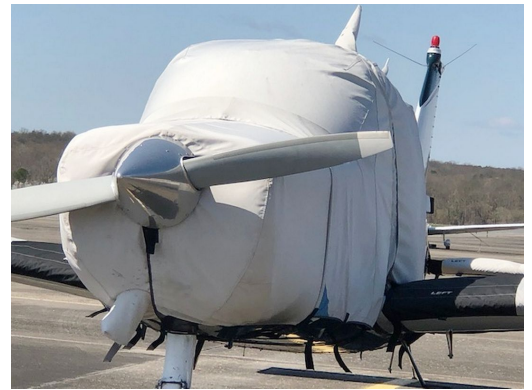
Beech Sundowner Engine Cover