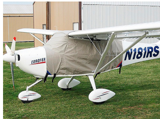
Eurofox LSA Extended Canopy Cover (same as an Aerotrek)