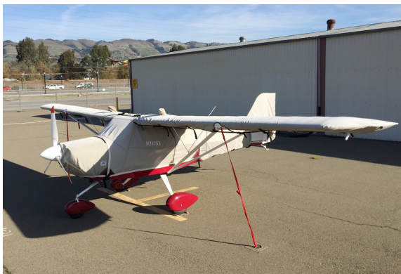
Eurofox Canopy, Engine, Wings and Empennage Covers

WINTER USE MATERIAL - Made with Solution-Dyed Polyester fabric, this option is intended for seasonal use to aid in deicing, rain mitigation, or for occasional travel. The material is lighter and more compact, but more susceptible to UV damage and may have a shorter useful life if used continuously outside than the all-year use material.