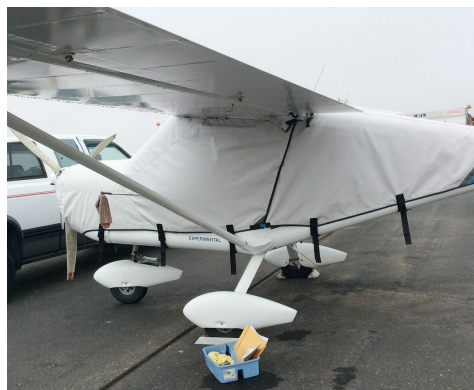
Aeroprakt A-22 Valor Capetown, Foxbat Canopy/Engine Cover