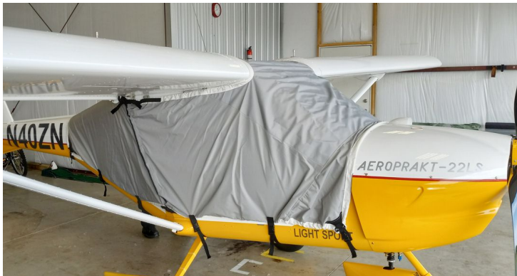
Aeroprakt A-22 Travel Weight Canopy Cover

Travel Covers are made with Silver Solution-Dyed Polyester fabric and only lined over the windshield to save weight. The material is lightweight and more compact for easy stowage in the aircraft. The polyester material is water resistant, but only intended for occasional use outside. We also have an ultra lightweight material available for fitted hangar dust covers. For daily outdoor use, the non-travel Sunbrella Cover is the best choice.