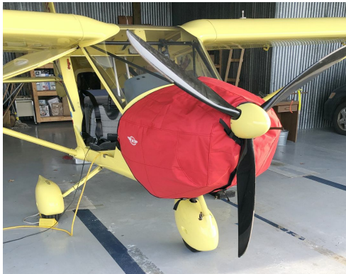
Aeroprakt A-22 Valor Insulated Engine Cover

Insulated Covers Material - A special composite material of solution-dyed polyester, 3M Thinsulate insulation, and soft nylon interior fabric. Our insulated covers are designed to complement an engine preheater and help retain heat in the engine compartment after shutdown. If you operate your aircraft in cold-weather, these covers will help prevent engine wear and tear.