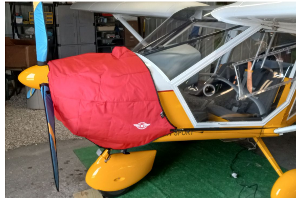
Aeroprakt A-22 Insulated Engine Cover