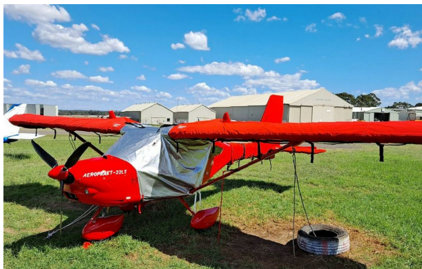
Aeroprakt A22 Wing & Empennage Covers