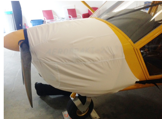
A-22 Engine Cover, test fit