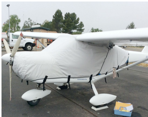
Aeroprakt A-22 Valor Canopy/Engine Cover

This cover type is made from Silver Acrylic Sunbrella canvas and is 100% lined with a soft and smooth microfiber. Bruce's Custom Covers developed this material combination especially for aircraft protection. The outer material is medium weight and treated for water resistance, UV resistance and anti-static buildup. The inner lining is a very soft and smooth microfiber to prevent scratching. The material is very reflective, and tests show that the cabin interior temperature can be reduced to near-ambient temperature on the hottest of days. It is water, ice and snow repellent, yet breathable to allow moisture to escape from between the cover and the aircraft surface.