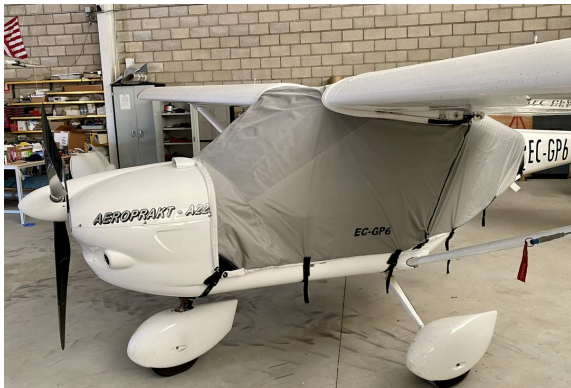
Aeroprakt A22 Over-Top Canopy Cover

Travel Covers are made with Silver Solution-Dyed Polyester fabric and only lined over the windshield to save weight. The material is lightweight and more compact for easy stowage in the aircraft. The polyester material is water resistant, but only intended for occasional use outside. We also have an ultra lightweight material available for fitted hangar dust covers. For daily outdoor use, the non-travel Sunbrella Cover is the best choice.