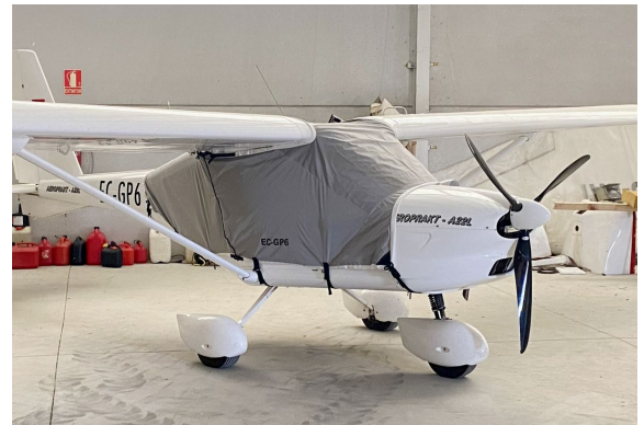
Aeroprakt A22 Over-Top Canopy Cover