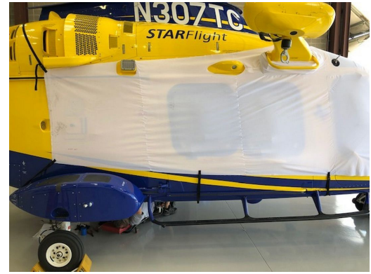
Leonardo (Agusta) A-169 Bubble Cover, test fit cover