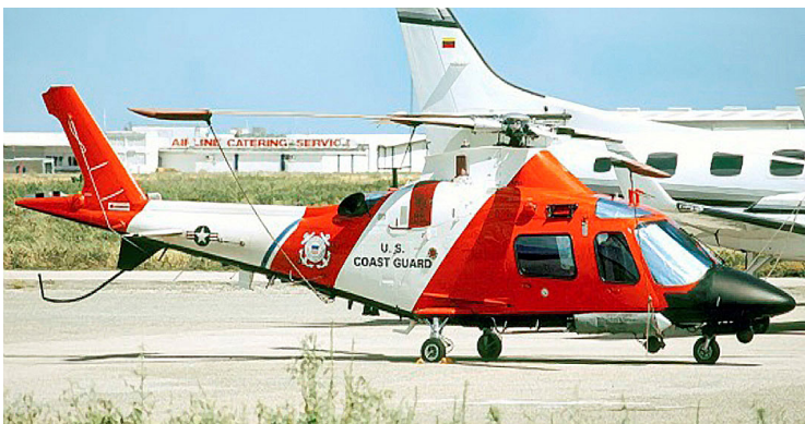
Covers, Plugs, HeatShields and related items for the Agusta MH-68A

Cockpit Heatshields are interior sunshades for the aircraft's cockpit. The product is a unique composite of closed-cell foam with a silver mylar finish. The semi-rigid design is stiff enough to stand inside the window framing. Darts and folds are incorporated into the material so that it conforms to the complex shape of the helicopter windows. The set folds up flat and is easily stored in the included storage sleeve. Some designs may require velcro and suction cups. A Heatshield is an excellent short-term remedy for cockpit overheating, but an external fabric cover is more effective for long-term protection.