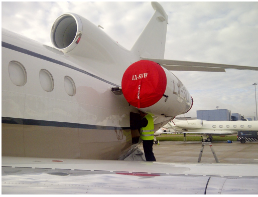
Falcon 900EX Engine Covers