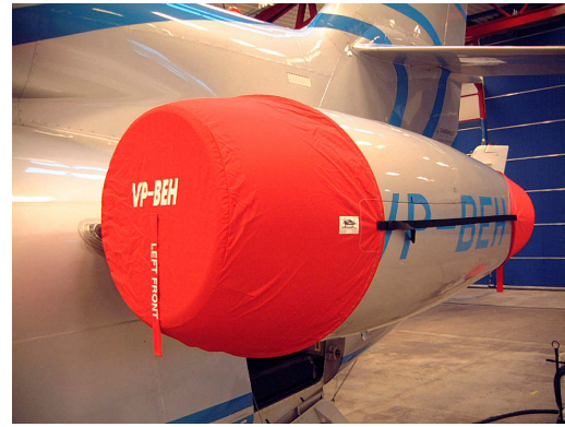
Falcon 900 Engine Covers, outboard & inboard strap detail