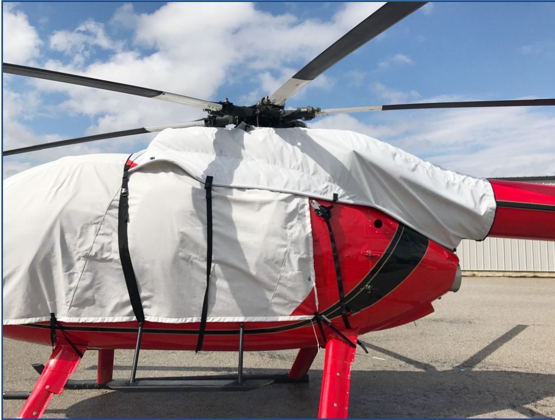
MD Helicopters 600 Bubble &amp; Doghouse Covers