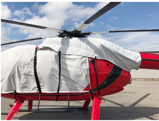
MD Helicopters 600 Bubble & Doghouse Covers