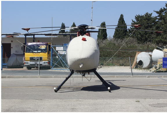
MD-500E Bubble Cover, Blade Tie-Diwns