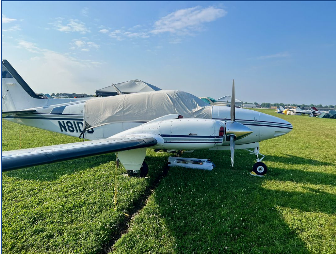
Beech Baron 58 Canopy Cover