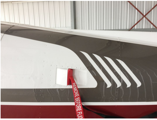
Beech Bonanza/Baron Fresh Air Intake & Exhaust Plugs