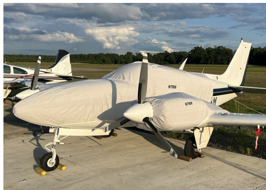
Beech C55 Baron Extended Canopy/Nose Cover, Engine Covers