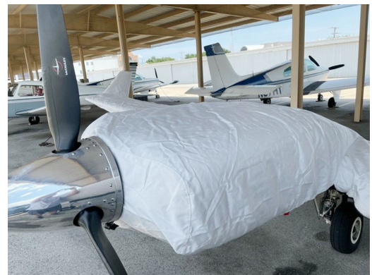
Beech Baron 58P Wing/Engine Covers (test fit)