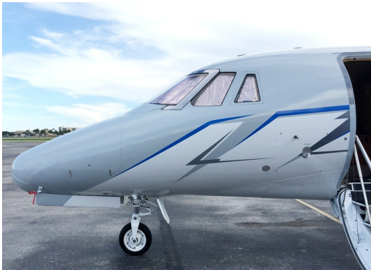
Cessna Citation 650 Cockpit HeataShields

Custom-made Heatshield Sunshades are available for almost any window in the jet. Side windows, Skylights, and Emergency Exits are all custom-made. The product is a unique composite of closed-cell foam with a silver mylar finish. The set is easily stored in the included storage sleeve. Some designs may require velcro and suction cups. Our Heatshields are offered white side out since aircraft manufacturers have issued advisories against reflective window inserts due to potential heat damage.