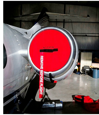
Beechjet 400A Engine Intake Plug with Generator Inlet Plug