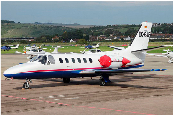
Cessna Citation II Engine Covers, Pitot Covers

The Cessna Citationjet V Encore (560) Intake/Exhaust Plugs are custom fit for the intake and exhaust openings, made with heavy-duty vinyl material, and stuffed with a single block of sculpted urethane foam. Each plug has a zipper that allows the foam to be removed and dried if necessary. Engine plugs have 'remove before flight' streamers sewn onto the face of the plugs. Most plugs are imprinted with the aircraft registration number in black. Engine plugs may be inserted after flight when the engine is still warm. Engine Inlet Plugs are commonly referred to as Cowl Plugs, Intake Plugs, Cowl Blocks, Engine Blocks, and Engine Bungs.