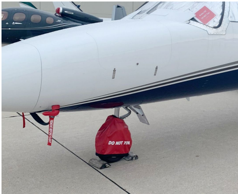
Cessna Citation Nose Tire Cover

ALL-YEAR USE MATERIAL - Made with Silver Acrylic Sunbrella canvas, the all-year use material is the best option for sun protection and cover longevity. This heavier more durable material is intended for all weather conditions, such as rain and snow or lots of sun.