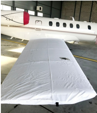
Cessna Citation CJ-4 Wing Covers, test fit cover