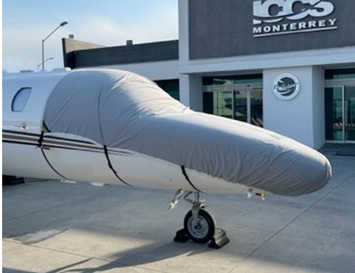
Cessna Citationjet 525B Travel Weight Cockpit/Nose Cover