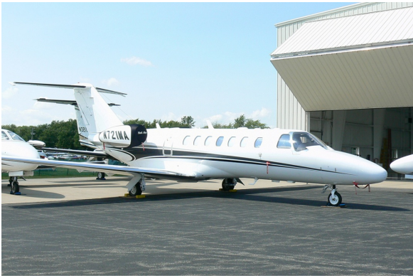
Cessna Citation CJ3 Bikini Style Engine Covers