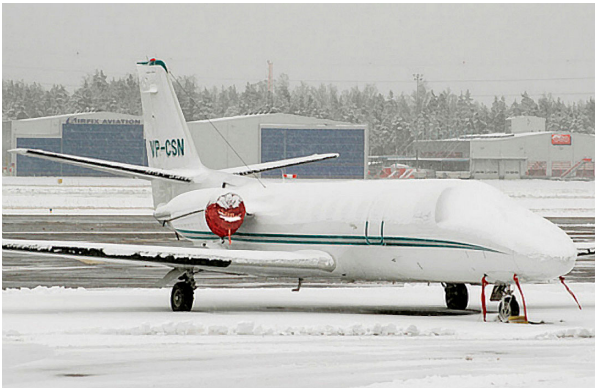
Cessna 560 Engine Inlet/Exhaust Covers, Pitot Cover Set