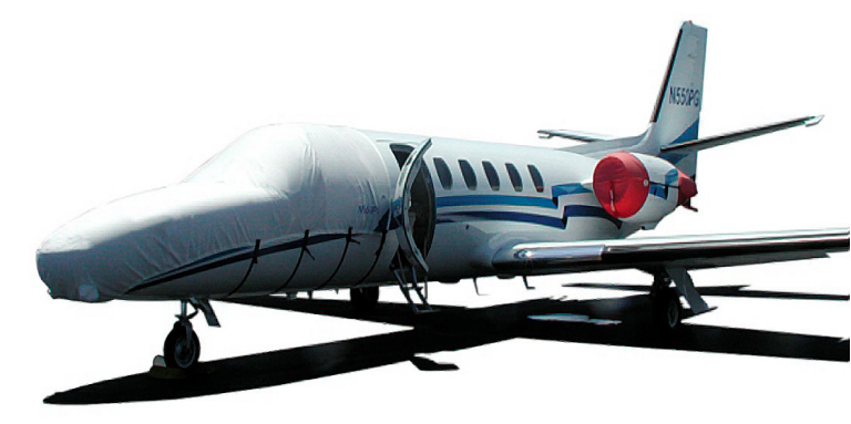
Cessna Citation Nose/Cockpit Cover, Engine Covers

This cover type is made from Silver Acrylic Sunbrella canvas and is 100% lined with a soft and smooth microfiber. Bruce's Custom Covers developed this material combination especially for aircraft protection. The outer material is medium weight and treated for water resistance, UV resistance and anti-static buildup. The inner lining is a very soft and smooth microfiber to prevent scratching. The material is very reflective, and tests show that the cabin interior temperature can be reduced to near-ambient temperature on the hottest of days. It is water, ice and snow repellent, yet breathable to allow moisture to escape from between the cover and the aircraft surface.