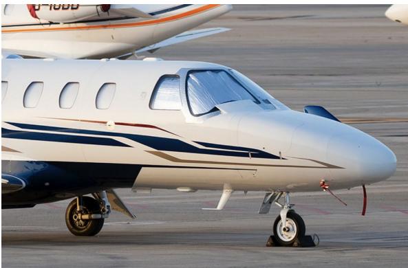
Cessna Citationjet 525, CJ-I, CJ1+, & M2 Cockpit Heatshields

Custom-made Heatshield Sunshades are available for almost any window in the jet. Side windows, Skylights, and Emergency Exits are all custom-made. The product is a unique composite of closed-cell foam with a silver mylar finish. The set is easily stored in the included storage sleeve. Some designs may require velcro and suction cups. Our Heatshields are offered white side out since aircraft manufacturers have issued advisories against reflective window inserts due to potential heat damage.