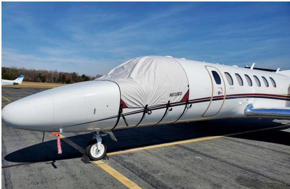
Cessna Citation 560 Cockpit Cover