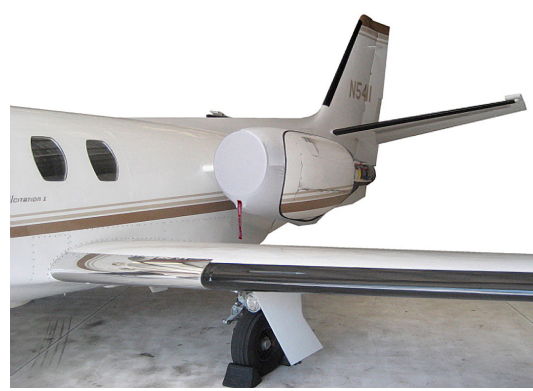
Cessna Citation "Bikini" Type Engine Covers: Extremely Light & Portable