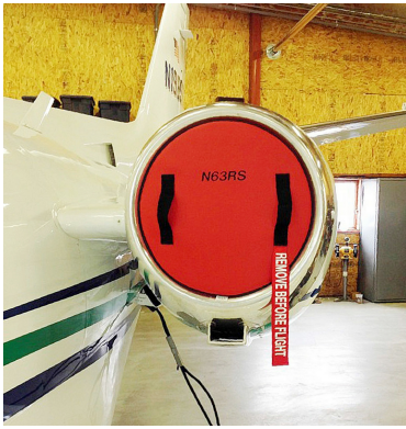
Cessna Citation S2 Intake Plugs