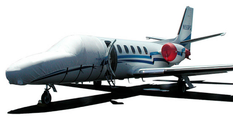
Cessna Citation Nose/Cockpit Cover, Engine Covers

This cover type is made from Silver Acrylic Sunbrella canvas and is 100% lined with a soft and smooth microfiber. Bruce's Custom Covers developed this material combination especially for aircraft protection. The outer material is medium weight and treated for water resistance, UV resistance and anti-static buildup. The inner lining is a very soft and smooth microfiber to prevent scratching. The material is very reflective, and tests show that the cabin interior temperature can be reduced to near-ambient temperature on the hottest of days. It is water, ice and snow repellent, yet breathable to allow moisture to escape from between the cover and the aircraft surface.