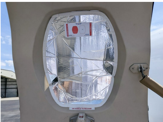
Citationjet Entrance Door Heatshield