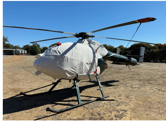
MDD 520 NOTAR Bubble Cover w/Intake Cover Add-On