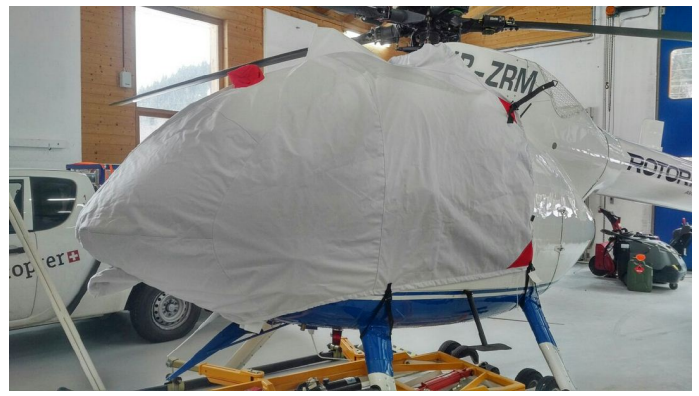
MD520 Bubble Cover with Intake Cover Add-On