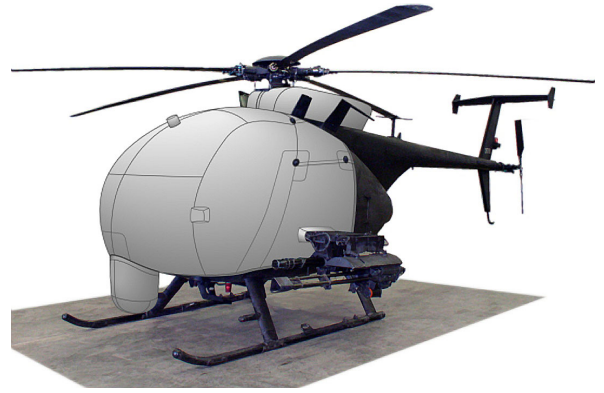
MDD 520 NOTAR Bubble Cover w/Intake Cover Add-On, Exhaust Cover MH-6J Bubble, Flir & Doghouse Covers (illustration)