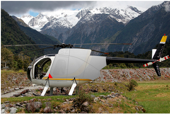
Engine Cover (illustration)