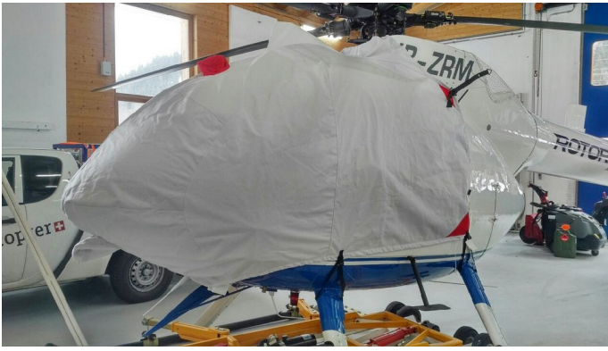
MD520 Bubble Cover with Intake Cover Add-On