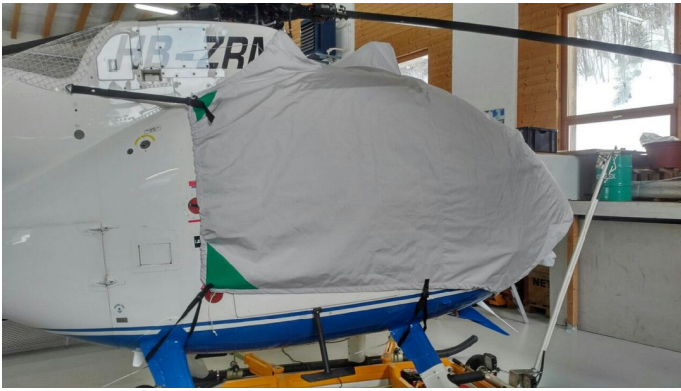
MD520 Bubble Cover with Intake Cover Add-On