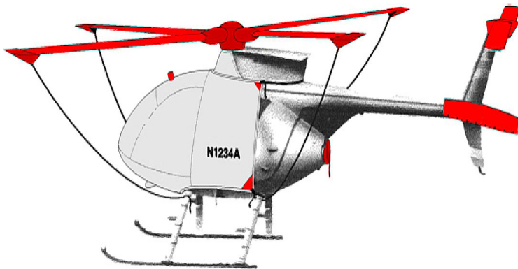
Full Cover Set

The Tailboom Cover details vary by model, but generally the helicopter tail boom cover encloses the tail boom from the "bottleneck" to the aft end. They usually also cover the horizontal stabilizers, and are custom made to allow for antennae, lights, and other protrusions. They attach with straps underneath the tail boom. Covers for the vertical and horizontal stabilizers are also available separately. Specific information for each model is available on request.