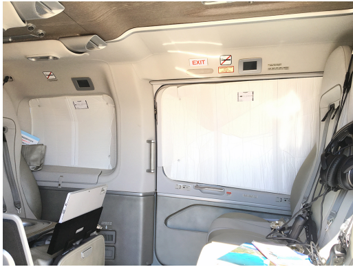
Eurocopter EC-145 Cabin Heatshields

Cockpit Heatshields are interior sunshades for the aircraft's cockpit. The product is a unique composite of closed-cell foam with a silver mylar finish. The semi-rigid design is stiff enough to stand inside the window framing. Darts and folds are incorporated into the material so that it conforms to the complex shape of the helicopter windows. The set folds up flat and is easily stored in the included storage sleeve. Some designs may require velcro and suction cups. A Heatshield is an excellent short-term remedy for cockpit overheating, but an external fabric cover is more effective for long-term protection.