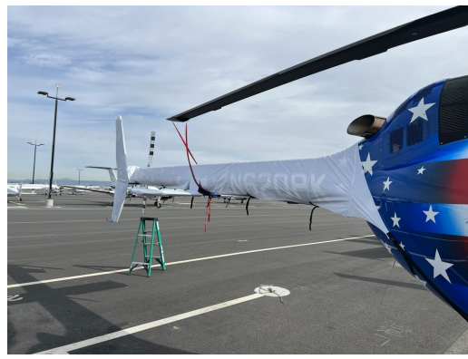
Bell 505 Tailboom & Stabilizer Covers, test fit cover