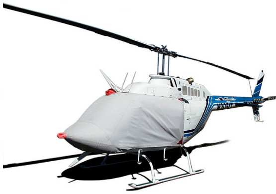
JetRanger Bubble Cover