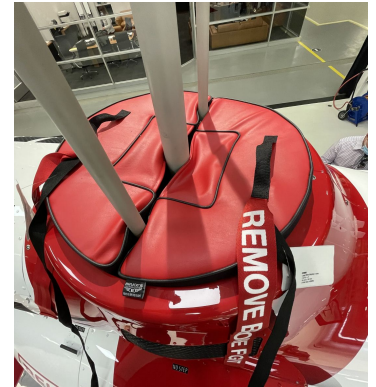
Bell 505 Swash Plate Plug