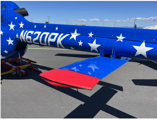
Bell 505 Horizontal Stabilizer Tip Pads