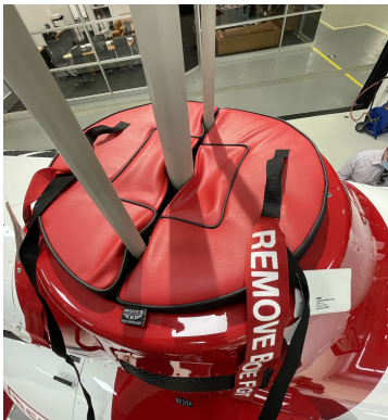
Bell 505 Swash Plate Plug