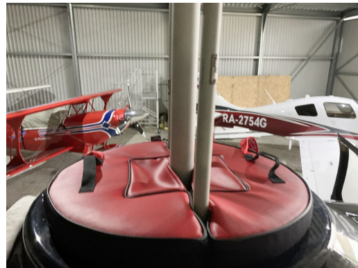
Bell 505 Jet Ranger X Swash Plate Plug