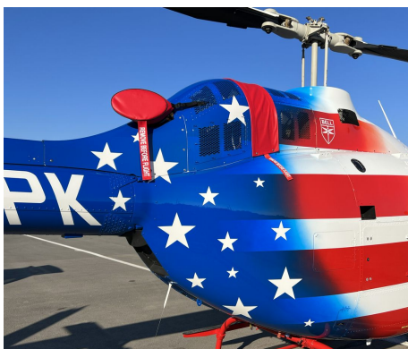
Bell 505 Exhaust & Intake Filter Covers

WINTER USE MATERIAL - Made with Solution-Dyed Polyester fabric, this option is intended for seasonal use to aid in deicing, rain mitigation, or for occasional travel. The material is lighter and more compact, but more susceptible to UV damage and may have a shorter useful life if used continuously outside than the all-year use material.