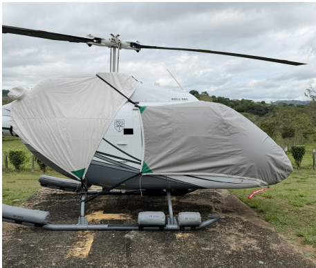
Bell 505 Bubble & Engine Covers