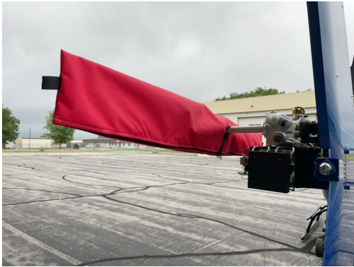
Bell 505 Jet Ranger X Tail Rotor Cover

WINTER USE MATERIAL - Made with Solution-Dyed Polyester fabric, this option is intended for seasonal use to aid in deicing, rain mitigation, or for occasional travel. The material is lighter and more compact, but more susceptible to UV damage and may have a shorter useful life if used continuously outside than the all-year use material.