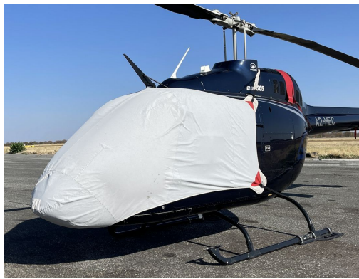
Bell 505 Bubble Cover, with Wire Strike