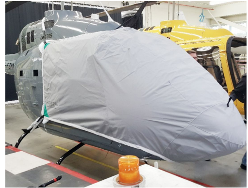
Bell 505 Bubble Cover, travel weight type