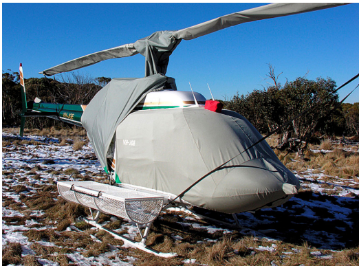
JetRanger Bubble, Engine, Rotor Hub & Blade Covers (& Tie-Downs)

The Engine Inlet Plugs are custom fit for your Bell 505 Jet Ranger X intakes, made with heavy-duty vinyl material, and stuffed with a single block of sculpted urethane foam. Each plug has a zipper that allows the foam to be removed and dried if necessary. Engine plugs have 'Remove Before Flight' streamers sewn onto the face of the plugs. Most plugs are imprinted with the aircraft registration number in black for an extra charge. Storage bag NOT included. Engine plugs may be inserted after flight when the engine is still warm. Engine Inlet Plugs are commonly referred to as Cowl Plugs, Intake Plugs, Cowl Blocks, Engine Blocks, and Engine Bungs.