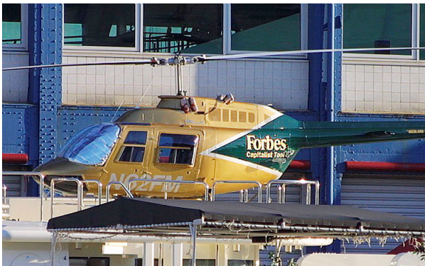
Bell 206B Jetranger Windshield HeatShields

Heatshields are interior sunshades for an aircraft's windows or canopy glass. The product is a unique composite of closed-cell foam with a silver mylar finish. The semi-rigid design is stiff enough to stand along the inside of the windshield using sun visors or window framing. It folds up flat and easily stores in the included storage sleeve. Some designs may require velcro and suction cups. A Heatshield is an excellent short-term remedy for cockpit overheating.