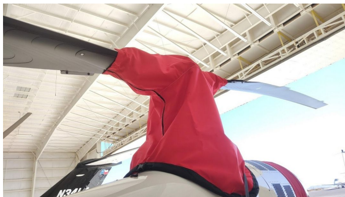
505 Jet Ranger X Rotor Hub/Drive Shaft Cover with outer skirt