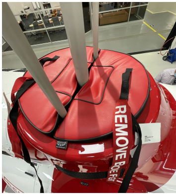
Bell 505 Swash Plate Plug

The Engine Inlet Plugs are custom fit for your Bell 505 Jet Ranger X intakes, made with heavy-duty vinyl material, and stuffed with a single block of sculpted urethane foam. Each plug has a zipper that allows the foam to be removed and dried if necessary. Engine plugs have 'Remove Before Flight' streamers sewn onto the face of the plugs. Most plugs are imprinted with the aircraft registration number in black for an extra charge. Storage bag NOT included. Engine plugs may be inserted after flight when the engine is still warm. Engine Inlet Plugs are commonly referred to as Cowl Plugs, Intake Plugs, Cowl Blocks, Engine Blocks, and Engine Bungs.