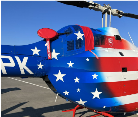
Bell 505 Exhaust & Intake Filter Covers