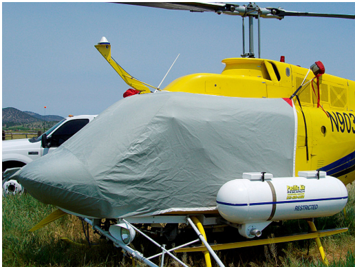
206B Bubble Cover