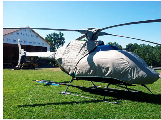
Bell 407 Covers: Bubble, Insulated Engine, Rotor Mast, Blades, Tailboom, Vertical Stabilizer and Tail Rotor