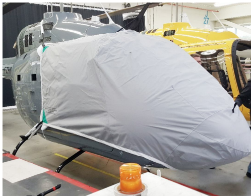
Bell 505 Bubble Cover, travel weight type

Travel Covers are made with Silver Solution-Dyed Polyester fabric and fully lined over the entire cover. The material is lightweight and more compact for easy storage in the aircraft. The polyester material is water resistant, but only intended for occasional use outside. We also have an ultra lightweight material available for fitted hangar dust covers. For daily outdoor use, the non-travel Sunbrella Cover is the best choice.