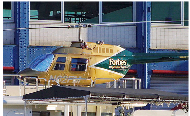
Bell 206B Jet Ranger Windshield HeatShields