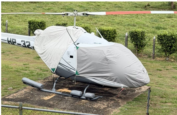
Bell 505 Bubble & Engine Covers

Travel Covers are made with Silver Solution-Dyed Polyester fabric and fully lined over the entire cover. The material is lightweight and more compact for easy storage in the aircraft. The polyester material is water resistant, but only intended for occasional use outside. We also have an ultra lightweight material available for fitted hangar dust covers. For daily outdoor use, the non-travel Sunbrella Cover is the best choice.