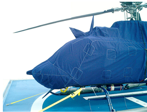
206B/206L/407 Full Body Cover