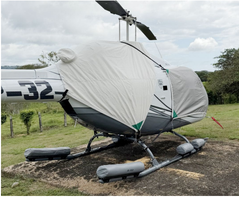
Bell 505 Bubble & Engine Covers