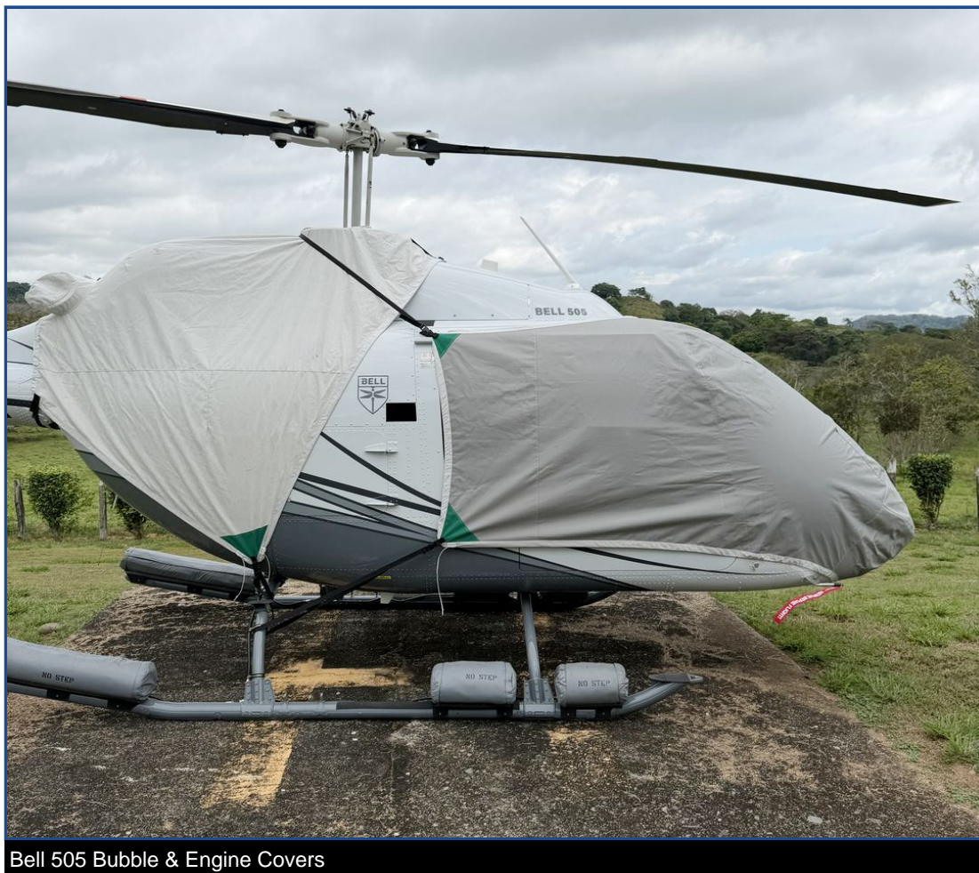
Bell 505 Bubble &amp; Engine Covers