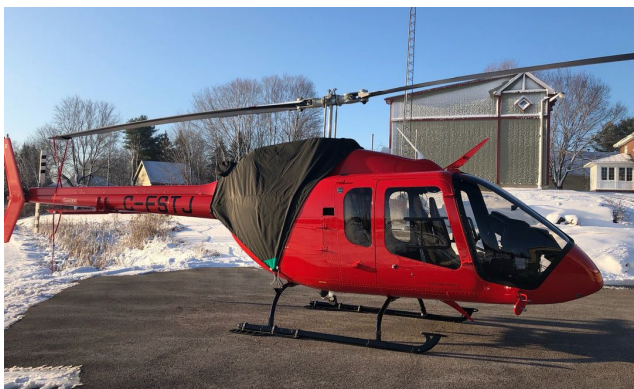
Bell 505 Engine Cover

WINTER USE MATERIAL - Made with Solution-Dyed Polyester fabric, this option is intended for seasonal use to aid in deicing, rain mitigation, or for occasional travel. The material is lighter and more compact, but more susceptible to UV damage and may have a shorter useful life if used continuously outside than the all-year use material.