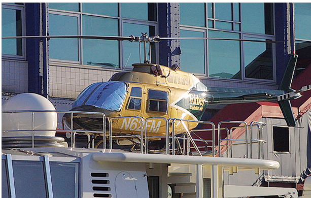
Bell 206B Jet Ranger Windshield HeatShields

Heatshields are interior sunshades for an aircraft's windows or canopy glass. The product is a unique composite of closed-cell foam with a silver mylar finish. The semi-rigid design is stiff enough to stand along the inside of the windshield using sun visors or window framing. It folds up flat and easily stores in the included storage sleeve. Some designs may require velcro and suction cups. A Heatshield is an excellent short-term remedy for cockpit overheating.