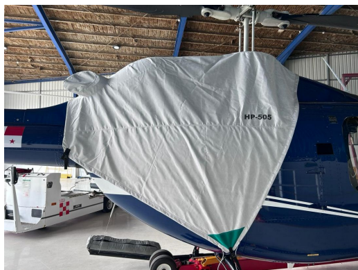
Bell 505 Engine Cover

WINTER USE MATERIAL - Made with Solution-Dyed Polyester fabric, this option is intended for seasonal use to aid in deicing, rain mitigation, or for occasional travel. The material is lighter and more compact, but more susceptible to UV damage and may have a shorter useful life if used continuously outside than the all-year use material.