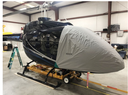
Bell 505 Light Weight Travel Bubble Cover