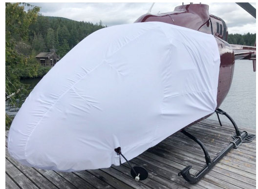
Bell 505 Bubble Cover, test fit cover