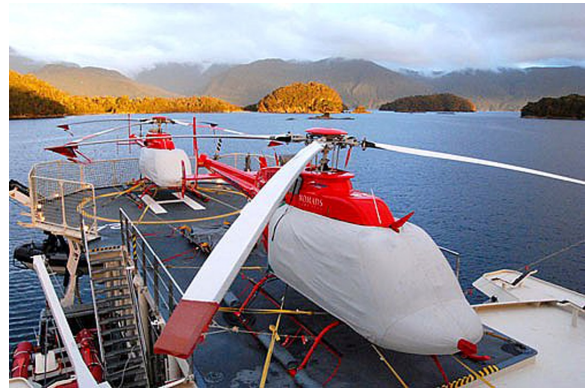
Bell 407 Bubble Cover