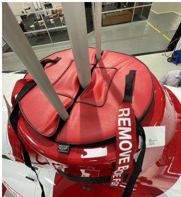
Bell 505 Swash Plate Plug

The Engine Inlet Plugs are custom fit for your Bell 505 Jet Ranger X intakes, made with heavy-duty vinyl material, and stuffed with a single block of sculpted urethane foam. Each plug has a zipper that allows the foam to be removed and dried if necessary. Engine plugs have 'Remove Before Flight' streamers sewn onto the face of the plugs. Most plugs are imprinted with the aircraft registration number in black for an extra charge. Storage bag NOT included. Engine plugs may be inserted after flight when the engine is still warm. Engine Inlet Plugs are commonly referred to as Cowl Plugs, Intake Plugs, Cowl Blocks, Engine Blocks, and Engine Bungs.