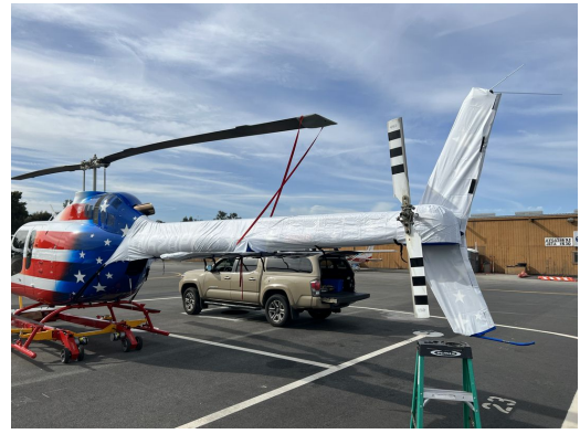
Bell 505 Tailboom & Stabilizer Covers, test fit cover