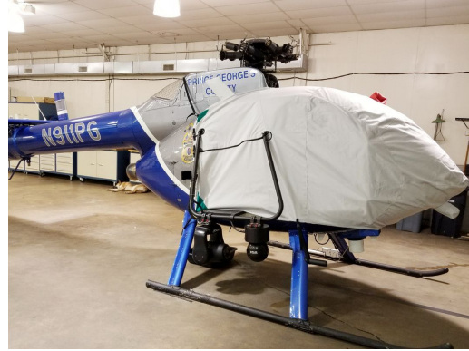
McDonnell Douglas MDD 520 Notar Bubble Cover, with special missions equipment.