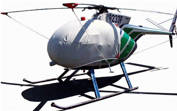
Hughes 500C Bubble Cover with Intake Add-on, Blade Tie-downs

Travel Covers are made with Silver Solution-Dyed Polyester fabric and fully lined over the entire cover. The material is lightweight and more compact for easy stowage in the aircraft. The polyester material is water resistant, but only intended for occasional use outside. We also have an ultra lightweight material available for fitted hangar dust covers. For daily outdoor use, the non-travel Sunbrella Cover is the best choice.