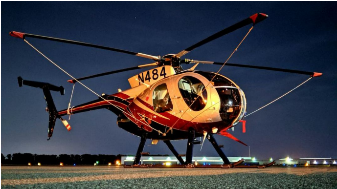
Hughes 500D Blade Tie-Downs