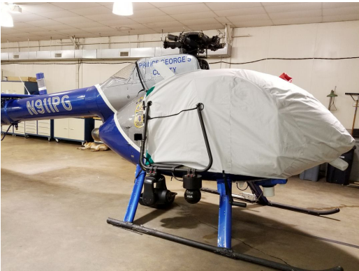
McDonnell Douglas MDD 520 Notar Bubble Cover, with special missions equipment.

Travel Covers are made with Silver Solution-Dyed Polyester fabric and fully lined over the entire cover. The material is lightweight and more compact for easy stowage in the aircraft. The polyester material is water resistant, but only intended for occasional use outside. We also have an ultra lightweight material available for fitted hangar dust covers. For daily outdoor use, the non-travel Sunbrella Cover is the best choice.