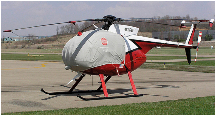
Hughes 500D Bubble Cover with Wire Strike detail and Blade Tie-downs