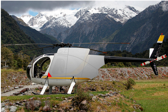
Engine Cover (illustration)

WINTER USE MATERIAL - Made with Solution-Dyed Polyester fabric, this option is intended for seasonal use to aid in deicing, rain mitigation, or for occasional travel. The material is lighter and more compact, but more susceptible to UV damage and may have a shorter useful life if used continuously outside than the all-year use material.