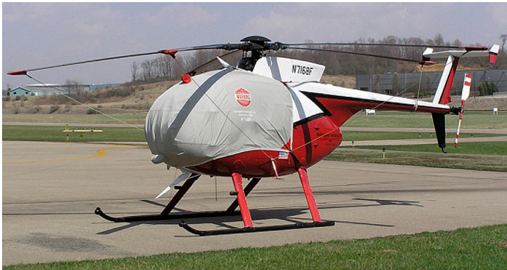
Hughes 500D Bubble Cover with Wire Strike detail and Blade Tie-downs