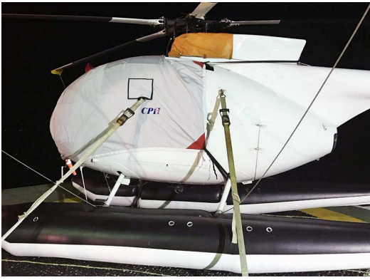
Customized with tie-down access flaps