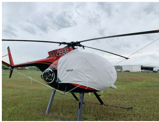
Hughes 500C Bubble Cover with Intake Add-On