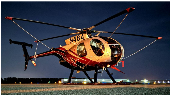
Hughes 500D Blade Tie-Downs