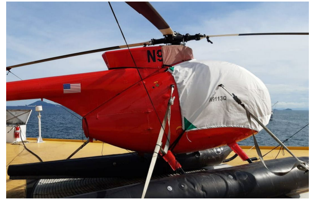
Hughes 500C (369HS) Bubble Cover