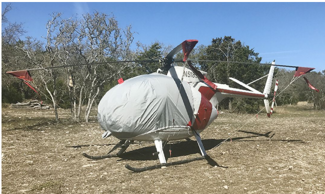
Hughes 500C, OH-6A Bubble Cover

WINTER USE MATERIAL - Made with Solution-Dyed Polyester fabric, this option is intended for seasonal use to aid in deicing, rain mitigation, or for occasional travel. The material is lighter and more compact, but more susceptible to UV damage and may have a shorter useful life if used continuously outside than the all-year use material.