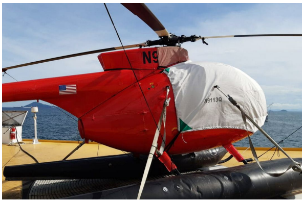
Hughes 500C (369HS) Bubble Cover