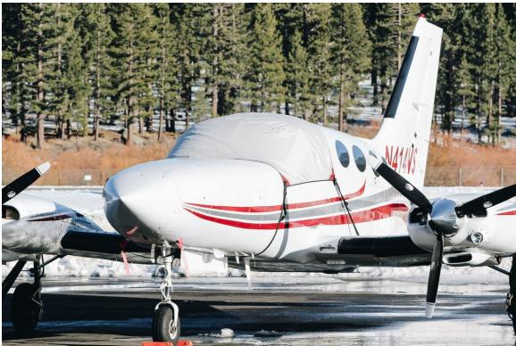
Cessna 414 Cockpit Cover

Covers developed this material combination especially for aircraft protection. The outer material is medium weight and treated for water resistance, UV resistance and anti-static buildup. The inner lining is a very soft and smooth microfiber to prevent scratching. The material is very reflective, and tests show that the cabin interior temperature can be reduced to near-ambient temperature on the hottest of days. It is water, ice and snow repellent, yet breathable to allow moisture to escape from between the cover and the aircraft surface.