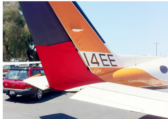
Cessna 414 Rudder Openings Cover (bird barrier)