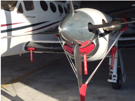
Cessna Conquest I Prop Tie/Exhaust Covers, Engine Plugs

Engine Inlet Plugs are custom fit for your Cessna 441, Conquest II intakes, made with heavy-duty vinyl material, and stuffed with a single block of sculpted urethane foam. Each plug has a zipper that allows the foam to be removed and dried if necessary. Engine plugs have warning flags that are visible from the cockpit or 'remove before flight' streamers sewn onto the face of the plugs. Most plugs are imprinted with the aircraft registration number in black for an extra charge. Storage bag NOT included. Engine plugs may be inserted after flight when the engine is still warm. Engine Inlet Plugs are commonly referred to as Cowl Plugs, Intake Plugs, Cowl Blocks, Engine Blocks, and Engine Bungs.