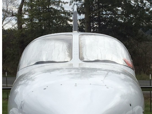
Cessna 421 Windshield HeatShields

Cockpit Heatshields are interior sunshades for the aircraft's cockpit. The product is a unique composite of closed-cell foam with a silver mylar finish. The semi-rigid design is stiff enough to stand inside the window framing. The set folds up flat and is easily stored in the included storage sleeve. Some designs may require velcro and suction cups. A Heatshield is an excellent short-term remedy for cockpit overheating, but an external fabric cover is more effective for long-term protection.