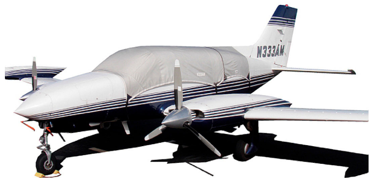
Cessna 414 Canopy Cover & Pitot Covers