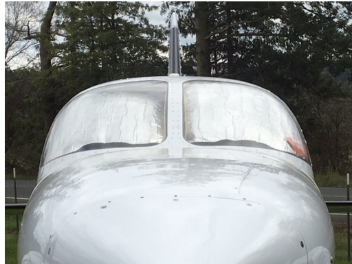
Cessna 421 Windshield HeatShields

Cockpit Heatshields are interior sunshades for the aircraft's cockpit. The product is a unique composite of closed-cell foam with a silver mylar finish. The semi-rigid design is stiff enough to stand inside the window framing. The set folds up flat and is easily stored in the included storage sleeve. Some designs may require velcro and suction cups. A Heatshield is an excellent short-term remedy for cockpit overheating, but an external fabric cover is more effective for long-term protection.