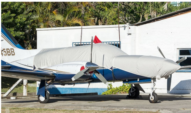
Cessna 421 Canopy Cover & Nose Cover

Travel Covers are made with Silver Solution-Dyed Polyester fabric and only lined over the windshield to save weight. The material is lightweight and more compact for easy stowage in the aircraft. The polyester material is water resistant, but only intended for occasional use outside. We also have an ultra lightweight material available for fitted hangar dust covers. For daily outdoor use, the non-travel Sunbrella Cover is the best choice.