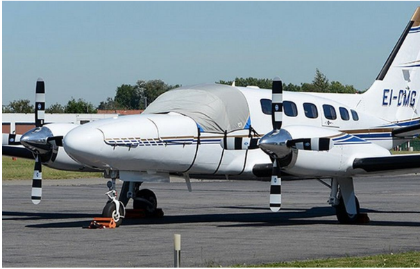
Cessna 441 Cockpit Cover

Covers developed this material combination especially for aircraft protection. The outer material is medium weight and treated for water resistance, UV resistance and anti-static buildup. The inner lining is a very soft and smooth microfiber to prevent scratching. The material is very reflective, and tests show that the cabin interior temperature can be reduced to near-ambient temperature on the hottest of days. It is water, ice and snow repellent, yet breathable to allow moisture to escape from between the cover and the aircraft surface.