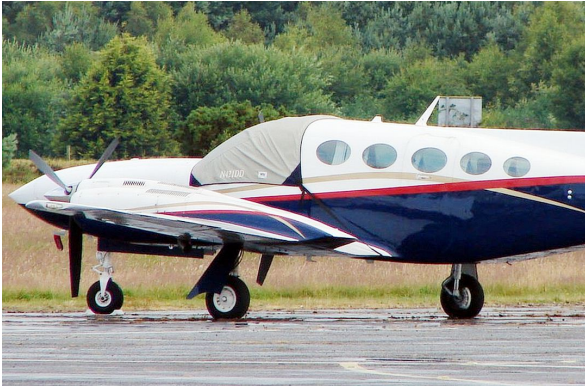
Cessna 421 Cockpit Cover

Covers developed this material combination especially for aircraft protection. The outer material is medium weight and treated for water resistance, UV resistance and anti-static buildup. The inner lining is a very soft and smooth microfiber to prevent scratching. The material is very reflective, and tests show that the cabin interior temperature can be reduced to near-ambient temperature on the hottest of days. It is water, ice and snow repellent, yet breathable to allow moisture to escape from between the cover and the aircraft surface.