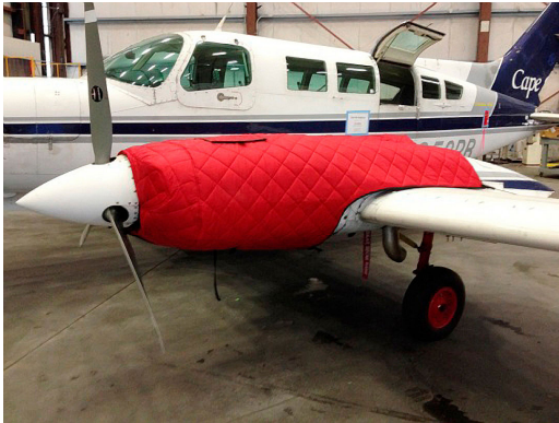
Cessna 402 Insulated Engine Cover

This cover type is made from Silver Acrylic Sunbrella canvas and is 100% lined with a soft and smooth microfiber. Bruce's Custom Covers developed this material combination especially for aircraft protection. The outer material is medium weight and treated for water resistance, UV resistance and anti-static buildup. The inner lining is a very soft and smooth microfiber to prevent scratching. The material is very reflective, and tests show that the cabin interior temperature can be reduced to near-ambient temperature on the hottest of days. It is water, ice and snow repellent, yet breathable to allow moisture to escape from between the cover and the aircraft surface.