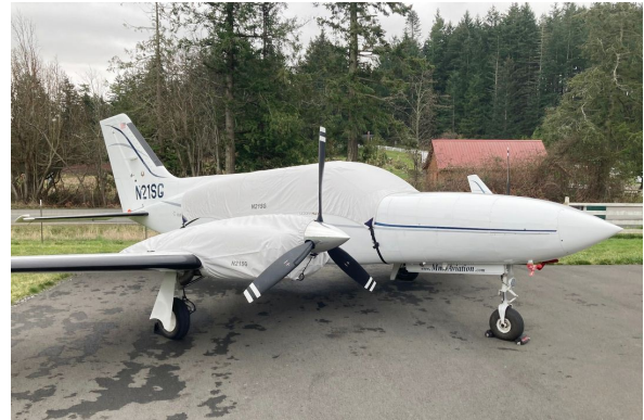
Cessna 421C Canopy & Engine Covers