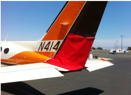
Cessna 414 Rudder Openings Cover (bird barrier)

WINTER USE MATERIAL - Made with Solution-Dyed Polyester fabric, this option is intended for seasonal use to aid in deicing, rain mitigation, or for occasional travel. The material is lighter and more compact, but more susceptible to UV damage and may have a shorter useful life if used continuously outside than the all-year use material.