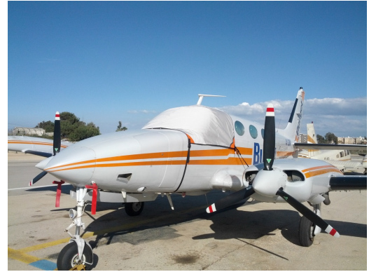
Cessna 340 Cockpit/Windshield Cover