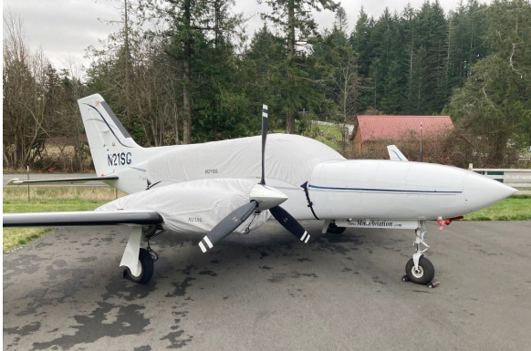
Cessna 421C Canopy & Engine Covers

This cover type is made from Silver Acrylic Sunbrella canvas and is 100% lined with a soft and smooth microfiber. Bruce's Custom Covers developed this material combination especially for aircraft protection. The outer material is medium weight and treated for water resistance, UV resistance and anti-static buildup. The inner lining is a very soft and smooth microfiber to prevent scratching. The material is very reflective, and tests show that the cabin interior temperature can be reduced to near-ambient temperature on the hottest of days. It is water, ice and snow repellent, yet breathable to allow moisture to escape from between the cover and the aircraft surface.