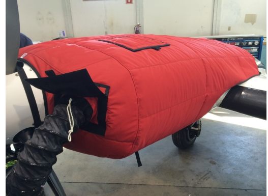
Cessna 402 Insulated Engine Cover with Heater