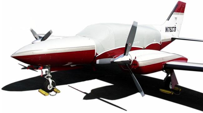
Cessna 421C Canopy Cover & Engine Plugs

Engine Inlet Plugs are custom fit for your Cessna 441, Conquest II intakes, made with heavy-duty vinyl material, and stuffed with a single block of sculpted urethane foam. Each plug has a zipper that allows the foam to be removed and dried if necessary. Engine plugs have warning flags that are visible from the cockpit or 'remove before flight' streamers sewn onto the face of the plugs. Most plugs are imprinted with the aircraft registration number in black for an extra charge. Storage bag NOT included. Engine plugs may be inserted after flight when the engine is still warm. Engine Inlet Plugs are commonly referred to as Cowl Plugs, Intake Plugs, Cowl Blocks, Engine Blocks, and Engine Bunges.