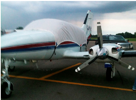
Cessna 401B Canopy Cover

Travel Covers are made with Silver Solution-Dyed Polyester fabric and only lined over the windshield to save weight. The material is lightweight and more compact for easy stowage in the aircraft. The polyester material is water resistant, but only intended for occasional use outside. We also have an ultra lightweight material available for fitted hangar dust covers. For daily outdoor use, the non-travel Sunbrella Cover is the best choice.