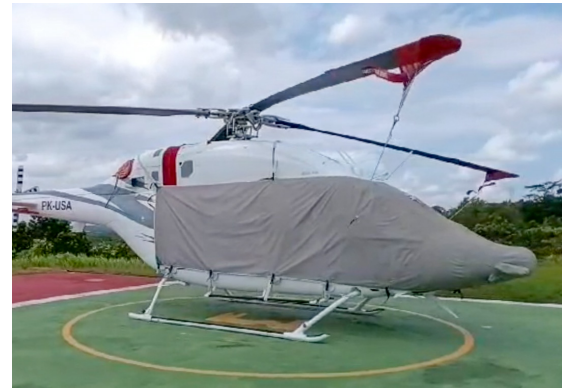
Bell 429 Bubble Cover