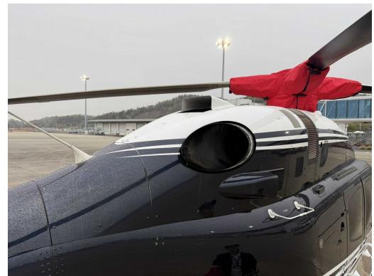
Bell 429 Insulated Main Rotor Mast Cover