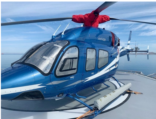
Bell 429 Rotor Hub Cover, Cockpit & Cabin HeatShields

Cockpit Heatshields are interior sunshades for the aircraft's cockpit. The product is a unique composite of closed-cell foam with a silver mylar finish. The semi-rigid design is stiff enough to stand inside the window framing. Darts and folds are incorporated into the material so that it conforms to the complex shape of the helicopter windows. The set folds up flat and is easily stored in the included storage sleeve. Some designs may require velcro and suction cups. A Heatshield is an excellent short-term remedy for cockpit overheating, but an external fabric cover is more effective for long-term protection.