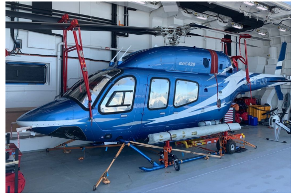
Bell 429 Cockpit & Cabin HeatShields