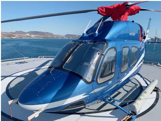
Bell 429 Cockpit & Cabin HeatShields, Rotor Mast/Drive Shafts Cover

WINTER USE MATERIAL - Made with Solution-Dyed Polyester fabric, this option is intended for seasonal use to aid in deicing, rain mitigation, or for occasional travel. The material is lighter and more compact, but more susceptible to UV damage and may have a shorter useful life if used continuously outside than the all-year use material.