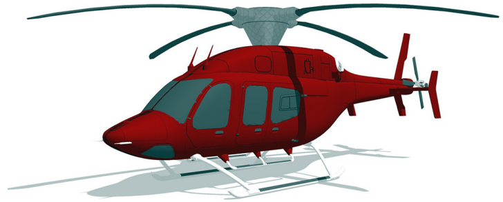
Bell 429 Insulated Main Rotor Hub Cover