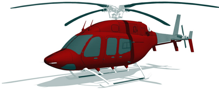
Bell 429 Insulated Tailboom Cover