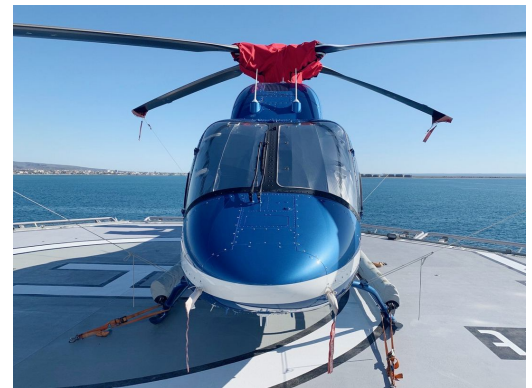
Bell 429 Windshield HeatShields, Rotor Mast Cover