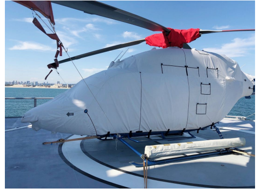
Bell 429 Main Body Cover