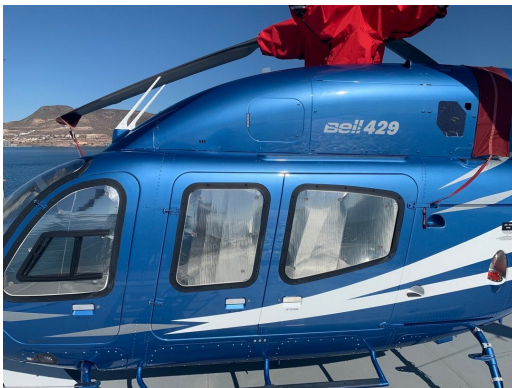
Bell 429 Cockpit & Cabin HeatShields, Rotor Mast/Drive Shafts Cover

Cockpit Heatshields are interior sunshades for the aircraft's cockpit. The product is a unique composite of closed-cell foam with a silver mylar finish. The semi-rigid design is stiff enough to stand inside the window framing. Darts and folds are incorporated into the material so that it conforms to the complex shape of the helicopter windows. The set folds up flat and is easily stored in the included storage sleeve. Some designs may require velcro and suction cups. A Heatshield is an excellent short-term remedy for cockpit overheating, but an external fabric cover is more effective for long-term protection.