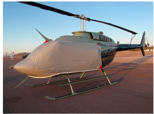
Bell 206L Longranger Bubble Cover