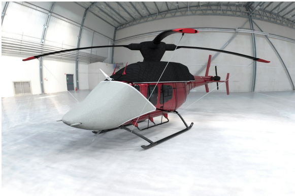
Bell 429 Cockpit/Nose Cover, Engine Cover, etc.