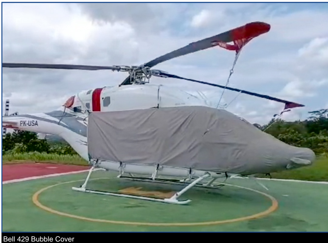
Bell 429 Bubble Cover