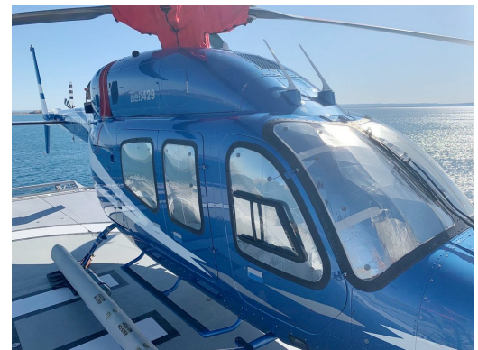
Bell 429 Cockpit & Cabin HeatShields