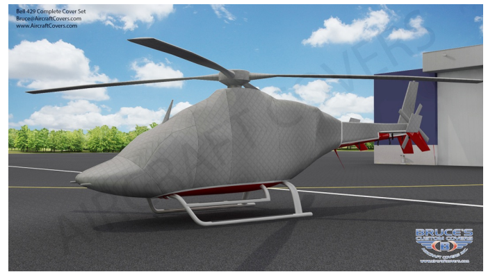
Bell 429 Full Cover Set (3D rendering)