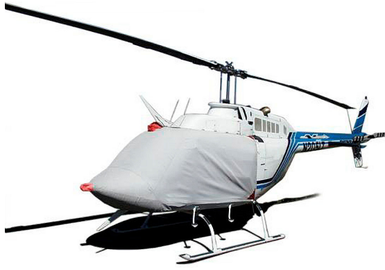
Bell 206B Bubble Cover