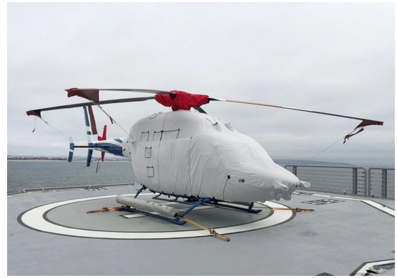
Bell 429 Main Body Cover, Rotor Hub & Tail Rotor Covers