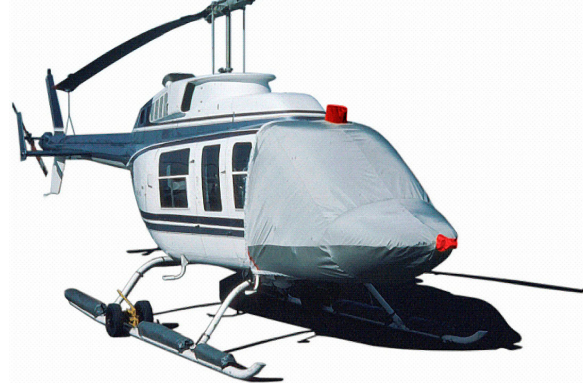
Cockpit Cover on Bell 206L