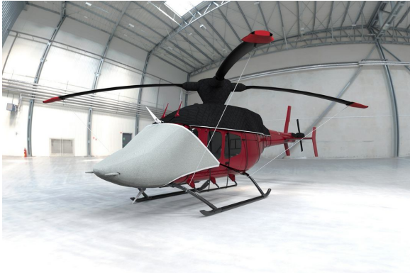
Bell 429 Cockpit/Nose Cover, Engine Cover, etc.

WINTER USE MATERIAL - Made with Solution-Dyed Polyester fabric, this option is intended for seasonal use to aid in deicing, rain mitigation, or for occasional travel. The material is lighter and more compact, but more susceptible to UV damage and may have a shorter useful life if used continuously outside than the all-year use material.