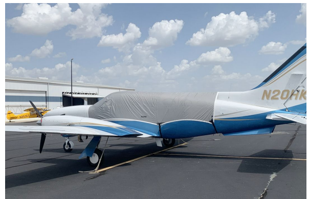
Cessna 414 Travel Weight Canopy Cover