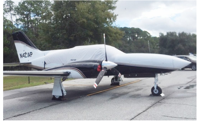
Cessna 421 Canopy Cover, Engine Plugs