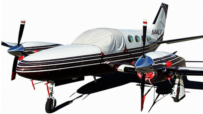
Cessna 425 Cockpit Cover

Travel Covers are made with Silver Solution-Dyed Polyester fabric and only lined over the windshield to save weight. The material is lightweight and more compact for easy stowage in the aircraft. The polyester material is water resistant, but only intended for occasional use outside. We also have an ultra lightweight material available for fitted hangar dust covers. For daily outdoor use, the non-travel Sunbrella Cover is the best choice.