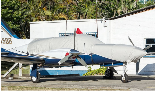
Cessna 421 Canopy Cover & Nose Cover

Covers developed this material combination especially for aircraft protection. The outer material is medium weight and treated for water resistance, UV resistance and anti-static buildup. The inner lining is a very soft and smooth microfiber to prevent scratching. The material is very reflective, and tests show that the cabin interior temperature can be reduced to near-ambient temperature on the hottest of days. It is water, ice and snow repellent, yet breathable to allow moisture to escape from between the cover and the aircraft surface.