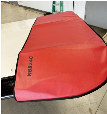
Cessna 421C Wingtip Pads

Designed to prevent damage to the aircraft extremities in crowded hangars, these products are made of bright red Naugahyde and thickly padded with a sandwich of closed cell foam. Nowadays they are also made using bright red Neoprene padded laminated (think: wetsuit material).