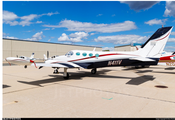
Cessna 340 Wingtip Pads