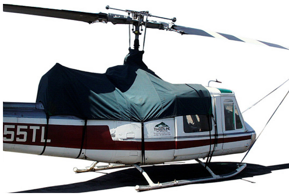
Bell 204/205 Engine/Mid-Cabin Cover

WINTER USE MATERIAL - Made with Solution-Dyed Polyester fabric, this option is intended for seasonal use to aid in deicing, rain mitigation, or for occasional travel. The material is lighter and more compact, but more susceptible to UV damage and may have a shorter useful life if used continuously outside than the all-year use material.