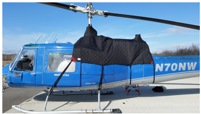
Bell 204 Insulated Engine Area Cover