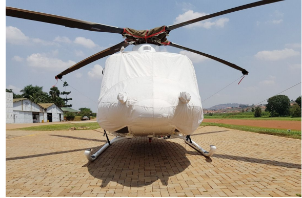
Bell 412 Cockpit/Canopy/Nose Cover