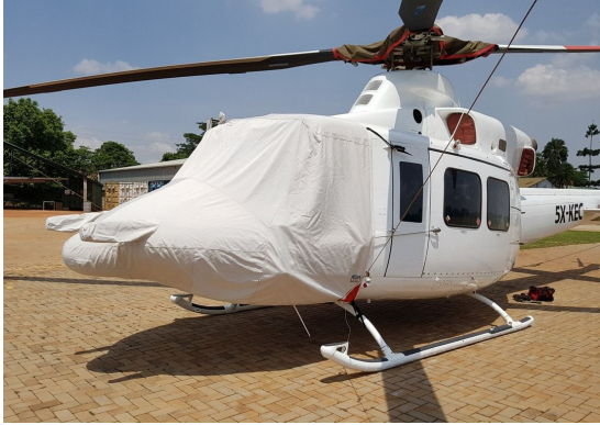
Bell 412 Cockpit/Canopy/Nose Cover

Canopy/Nose Covers enclose the entire canopy including the windshield, skylights, and chin bubble. Attachment buckles are made of nonmetal Delrin , designed for rugged outdoor use. Both the top and bottom hems of the cover have a special rope-hem feature with which they can be tightened to help prevent abrasive chafing of the windshield. Pockets are sewn into the cover for the temperature probe and pitot tubes. The bubble cover is reinforced with patches at hinge points, door handles, and for the windshield wipers. For ease of installation, the bubble cover is color-coded (red=left, green=right) with color swatches sewn into the corners. This cover type is made from Silver Acrylic Sunbrella canvas and is 100% lined with a soft and smooth microfiber. Bruce's Custom Covers developed this material combination especially for aircraft protection. The outer material is medium weight and treated for water resistance, UV resistance and anti-static buildup. The inner lining is a very soft and smooth microfiber to prevent scratching. The material is very reflective, and tests show that the cabin interior temperature can be reduced to near-ambient temperature on the hottest of days. It is water, ice and snow repellent, yet breathable to allow moisture to escape from between the cover and the aircraft surface.