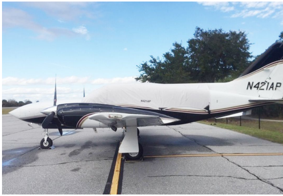
Cessna 421 Canopy Cover