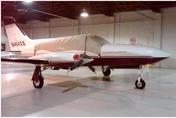
Cessna 414 Canopy Cover and Engine Inlet Plugs