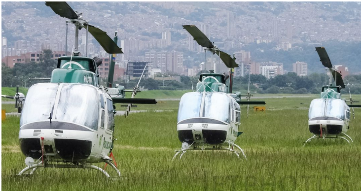
Bell 407 Windshield Heatshields