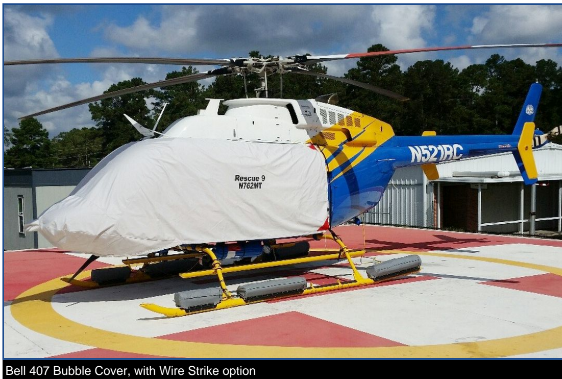
Bell 407 Bubble Cover, with Wire Strike option