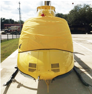
Yellow Windshield Cover with artwork