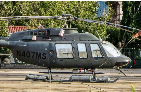
Bell 407 Cockpit & Cabin HeatShields

Heatshields are interior sunshades for an aircraft's windows or canopy glass. The product is a unique composite of closed-cell foam with a silver mylar finish. The semi-rigid design is stiff enough to stand along the inside of the windshield using sun visors or window framing. It folds up flat and easily stores in the included storage sleeve. Some designs may require velcro and suction cups. A Heatshield is an excellent short-term remedy for cockpit overheating.