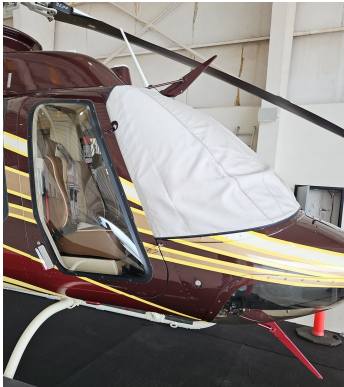
Bell 407 Windshield Cover, pinches into door jambs

This cover type is made from Silver Acrylic Sunbrella canvas and is 100% lined with a soft and smooth microfiber. Bruce's Custom Covers developed this material combination especially for aircraft protection. The outer material is medium weight and treated for water resistance, UV resistance and anti-static buildup. The inner lining is a very soft and smooth microfiber to prevent scratching. The material is very reflective, and tests show that the cabin interior temperature can be reduced to near-ambient temperature on the hottest of days. It is water, ice and snow repellent, yet breathable to allow moisture to escape from between the cover and the aircraft surface.