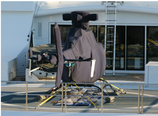
Bell 407 Complete Cover Set

The Tailboom Cover details vary by model, but generally the helicopter tail boom cover encloses the tail boom from the "bottleneck" to the aft end. They usually also cover the horizontal stabilizers, and are custom made to allow for antennae, lights, and other protrusions. They attach with straps underneath the tail boom. Covers for the vertical and horizontal stabilizers are also available separately. Specific information for each model is available on request.