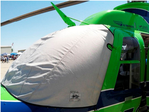
Bell 407 Windshield Cover