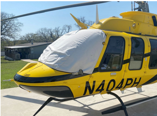
Bell 407 Windshield Cover

Travel Covers are made with Silver Solution-Dyed Polyester fabric and fully lined over the entire cover. The material is lightweight and more compact for easy stowage in the aircraft. The polyester material is water resistant, but only intended for occasional use outside. We also have an ultra lightweight material available for fitted hangar dust covers. For daily outdoor use, the non-travel Sunbrella Cover is the best choice.