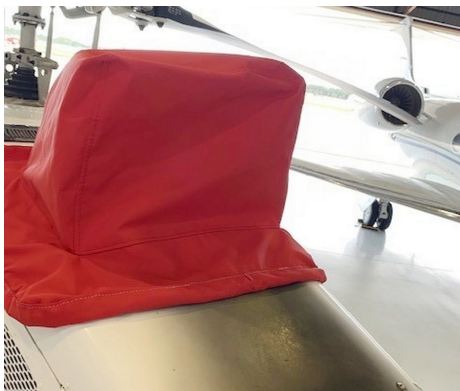
Bell 407 Exhaust/Gap Cover (weighted)

WINTER USE MATERIAL - Made with Solution-Dyed Polyester fabric, this option is intended for seasonal use to aid in deicing, rain mitigation, or for occasional travel. The material is lighter and more compact, but more susceptible to UV damage and may have a shorter useful life if used continuously outside than the all-year use material.