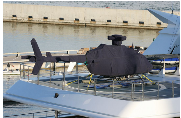
Bell 407 Complete Cover Set