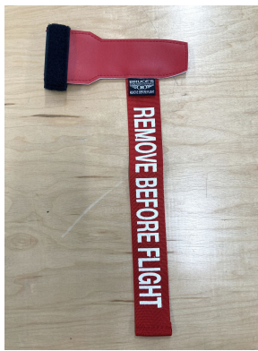
Pitot Tube Cover