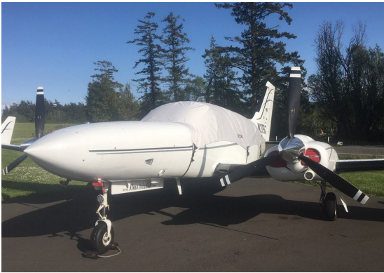
Cessna 421C Canopy Cover