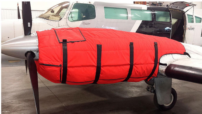
Cessna 404 Insulated Engine Cover