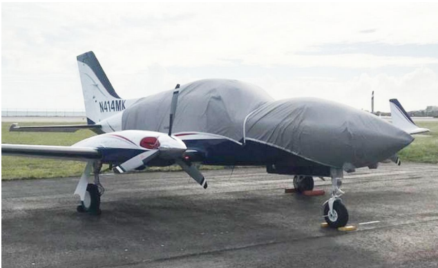
Cessna 414 Travel Cover, Light Weight Canopy Cover

non-travel Sunbrella Cover is the best choice.