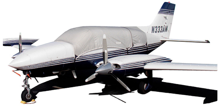
Cessna 414 Canopy Cover & Pitot Covers