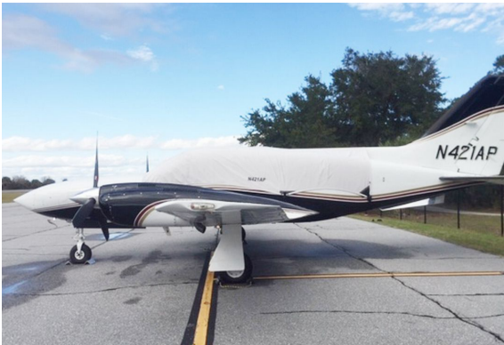
Cessna 421 Canopy Cover

The Cessna 402 Nose Cover is designed to cover the section of the fuselage forward of the windshield to the tip of the nose. It is secured with belly strapsThis cover type is made from Silver Acrylic Sunbrella canvas and is 100% lined with a soft and smooth microfiber. Bruce's Custom Covers developed this material combination especially for aircraft protection. The outer material is medium weight and treated for water resistance, UV resistance and anti-static buildup. The inner lining is a very soft and smooth microfiber to prevent scratching. The material is very reflective, and tests show that the cabin interior temperature can be reduced to near-ambient temperature on the hottest of days. It is water, ice and snow repellent, yet breathable to allow moisture to escape from between the cover and the aircraft surface.