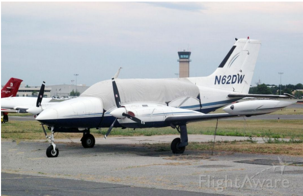
Cessna 421 Canopy Cover