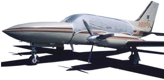
Cessna 421 Cockpit/Windshield Cover