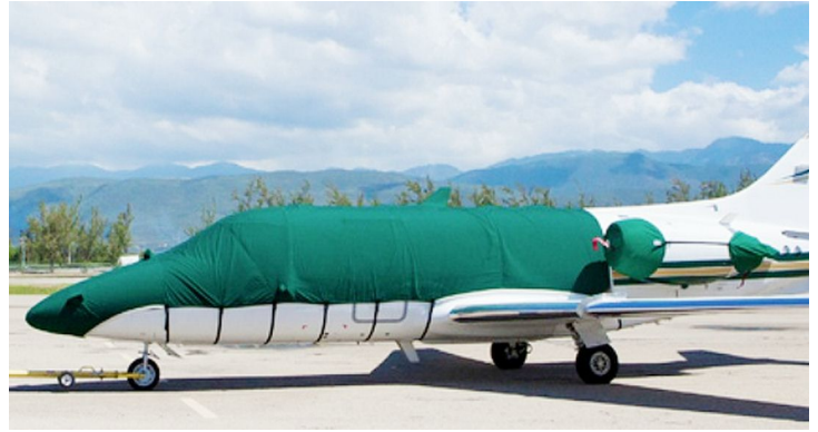
Raytheon Beechjet 400 Fuselage/Nose Cover, Engine Covers