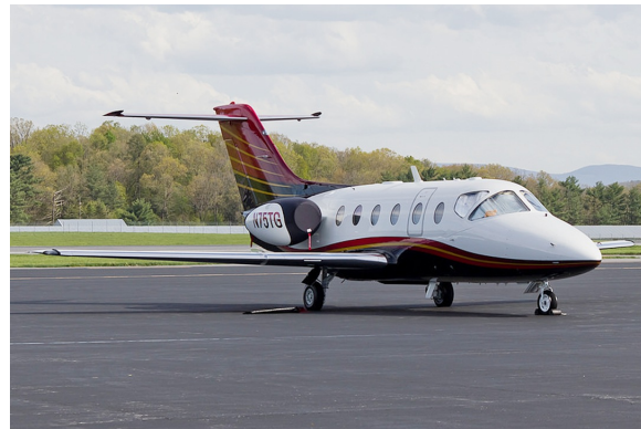
Nextant 400XTi Cockpit HeatShields, Bikini Type Engine Covers