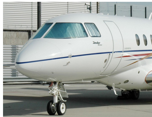
Hawker Beechcraft 4000 Horizon Cockpit Heatshields