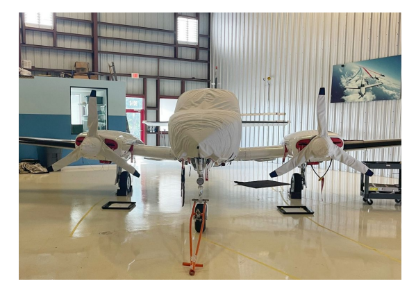
Cessna 340 Extended Canopy/Nose Cover