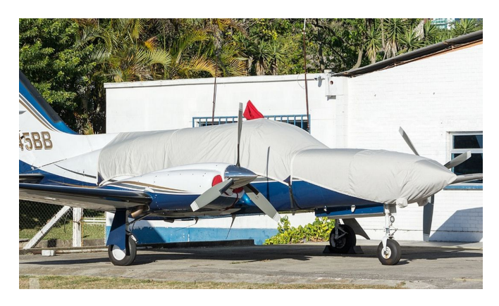
Cessna 421 Canopy Cover & Nose Cover

Travel Covers are made with Silver Solution-Dyed Polyester fabric and only lined over the windshield to save weight. The material is lightweight and more compact for easy stowage in the aircraft. The polyester material is water resistant, but only intended for occasional use outside. We also have an ultra lightweight material available for fitted hangar dust covers. For daily outdoor use, the non-travel Sunbrella Cover is the best choice.