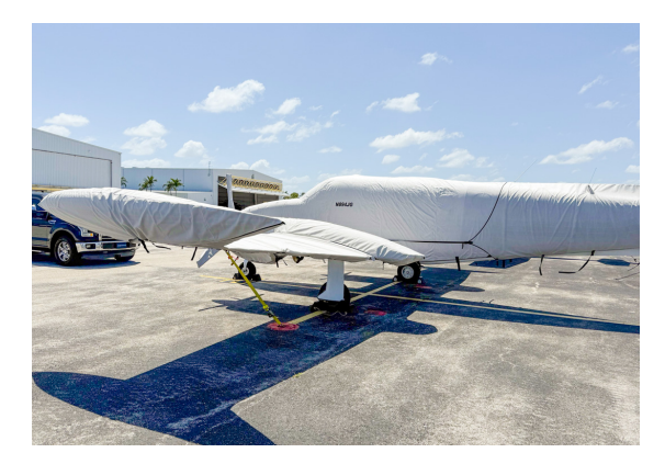
Cessna 340 Complete Cover Set