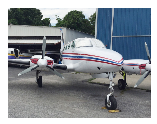
Cessna 340 Engine Inlet Plugs

Engine Inlet Plugs are custom fit for your Cessna 335, 340 intakes, made with heavy-duty vinyl material, and stuffed with a single block of sculpted urethane foam. Each plug has a zipper that allows the foam to be removed and dried if necessary. Engine plugs have warning flags that are visible from the cockpit or 'remove before flight' streamers sewn onto the face of the plugs. Most plugs are imprinted with the aircraft registration number in black for an extra charge. Storage bag NOT included. Engine plugs may be inserted after flight when the engine is still warm. Engine Inlet Plugs are commonly referred to as Cowl Plugs, Intake Plugs, Cowl Blocks, Engine Blocks, and Engine Bungs.