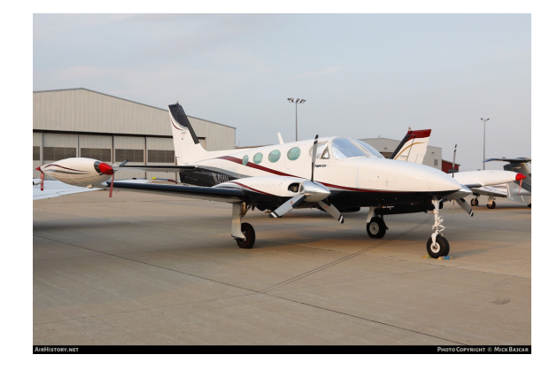
Cessna 340 Wingtip Pads