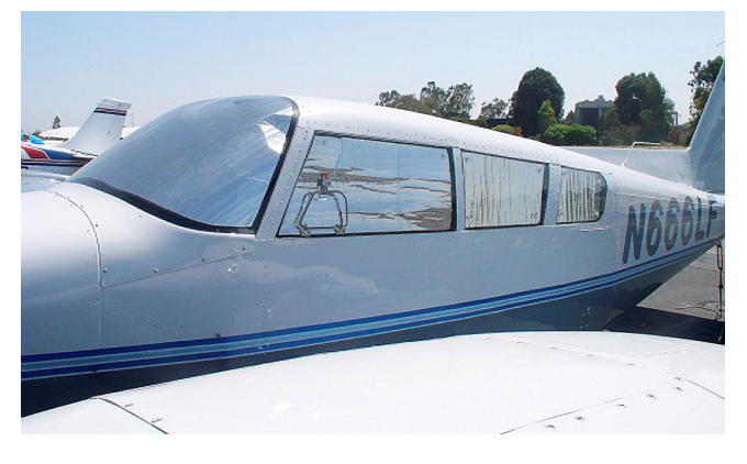
Piper PA-30 Twin Comanche Cockpit HeatShields

Cockpit Heatshields are interior sunshades for the aircraft's cockpit. The product is a unique composite of closed-cell foam with a silver mylar finish. The semi-rigid design is stiff enough to stand inside the window framing. The set folds up flat and is easily stored in the included storage sleeve. Some designs may require velcro and suction cups. A Heatshield is an excellent short-term remedy for cockpit overheating, but an external fabric cover is more effective for long-term protection.