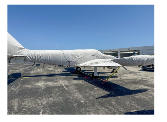
Cessna 340 Complete Cover Set

This cover type is made from Silver Acrylic Sunbrella canvas and is 100% lined with a soft and smooth microfiber. Bruce's Custom Covers developed this material combination especially for aircraft protection. The outer material is medium weight and treated for water resistance, UV resistance and anti-static buildup. The inner lining is a very soft and smooth microfiber to prevent scratching. The material is very reflective, and tests show that the cabin interior temperature can be reduced to near-ambient temperature on the hottest of days. It is water, ice and snow repellent, yet breathable to allow moisture to escape from between the cover and the aircraft surface.