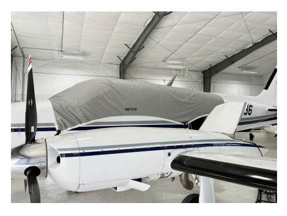
Cessna 340A Travel Weight Canopy Cover