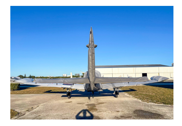
Cessna 340 Empennage Cover, Wing/Engine Covers

WINTER USE MATERIAL - Made with Solution-Dyed Polyester fabric, this option is intended for seasonal use to aid in deicing, rain mitigation, or for occasional travel. The material is lighter and more compact, but more susceptible to UV damage and may have a shorter useful life if used continuously outside than the all-year use material.