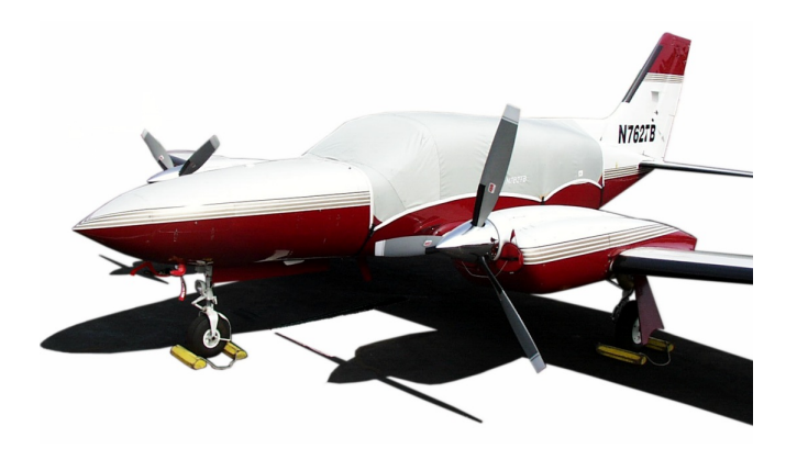
Cessna 421C Canopy Cover & Engine Plugs