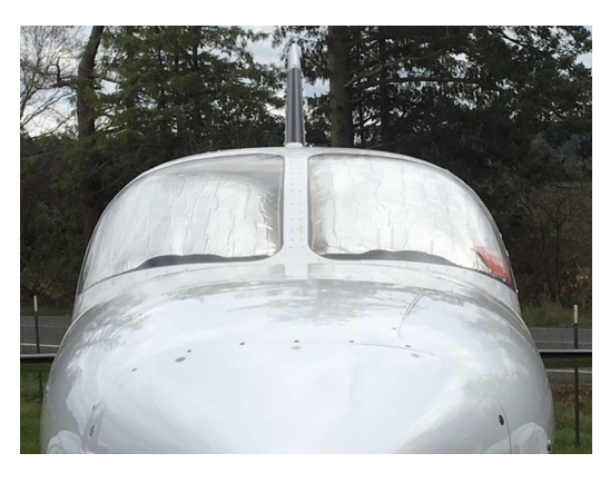
Cessna 421 Windshield HeatShields