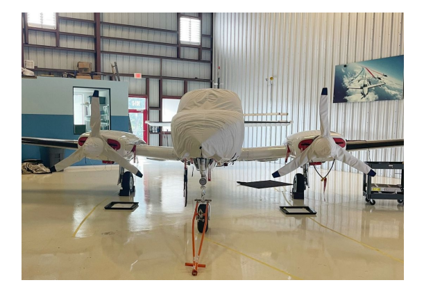
Cessna 340 Extended Canopy/Nose Cover

This cover type is made from Silver Acrylic Sunbrella canvas and is 100% lined with a soft and smooth microfiber. Bruce's Custom Covers developed this material combination especially for aircraft protection. The outer material is medium weight and treated for water resistance, UV resistance and anti-static buildup. The inner lining is a very soft and smooth microfiber to prevent scratching. The material is very reflective, and tests show that the cabin interior temperature can be reduced to near-ambient temperature on the hottest of days. It is water, ice and snow repellent, yet breathable to allow moisture to escape from between the cover and the aircraft surface.