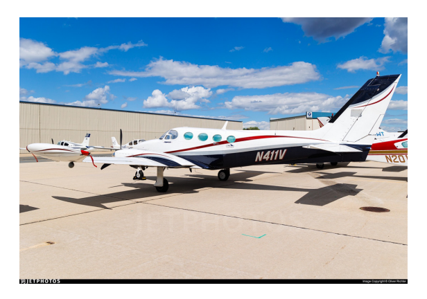
Cessna 340 Wingtip Pads

Designed to prevent damage to the aircraft extremities in crowded hangars, these products are made of bright red Naugahyde and thickly padded with a sandwich of closed cell foam.