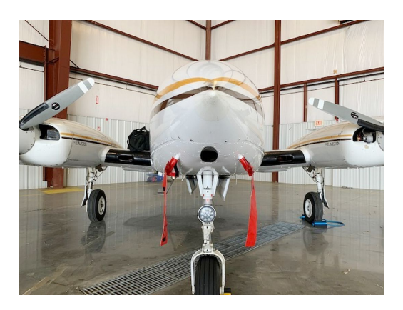
Cessna 340 Pitot Tube Covers