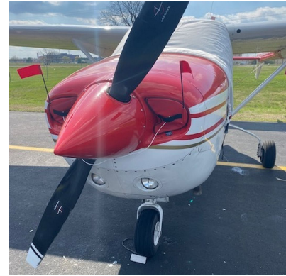
Cessna 337 Skymaster Fwd Engine Intake Plugs