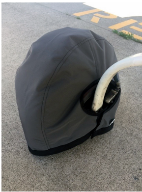
Cessna 337 Skymaster (O-2, O-2A) Tire Covers

The Cessna 337 Skymaster (O-2, O-2A) Tailcone Cover fits onto the tailcone area to cover the holes that birds can fly into and nest. The cover easily straps onto the leading edge of the horizontal stabilizer with padded hooks or overlaps with the elevators slightly and attaches under the horizontal stabilizers with adjustable straps. Tailcone Covers are normally made with Solution-Dyed Polyester or Acrylic Sunbrella .