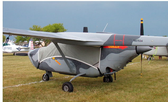
Cessna 337 Skymaster Canopy Cover w/ 14" bib ext.