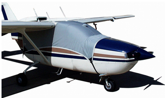
Cessna Skymaster Canopy Cover with Forward Extension

This cover type is made from Silver Acrylic Sunbrella canvas and is 100% lined with a soft and smooth microfiber. Bruce's Custom Covers developed this material combination especially for aircraft protection. The outer material is medium weight and treated for water resistance, UV resistance and anti-static buildup. The inner lining is a very soft and smooth microfiber to prevent scratching. The material is very reflective, and tests show that the cabin interior temperature can be reduced to near-ambient temperature on the hottest of days. It is water, ice and snow repellent, yet breathable to allow moisture to escape from between the cover and the aircraft surface.