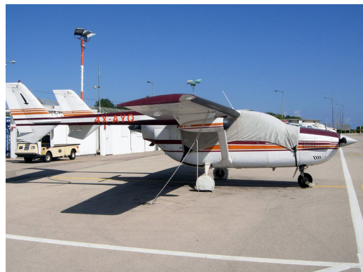
Cessna 337 Skymaster Canopy Cover w/ 14" bib ext.