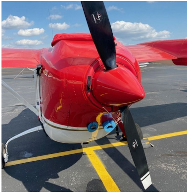
Cessna 337 Skymaster Aft Engine Prop Base Plugs

necessary. Engine plugs have warning flags that are visible from the cockpit or 'remove before flight' streamers sewn onto the face of the plugs. Most plugs are imprinted with the aircraft registration number in black for an extra charge. Storage bag NOT included. Engine plugs may be inserted after flight when the engine is still warm. Engine Inlet Plugs are commonly referred to as Cowl Plugs, Intake Plugs, Cowl Blocks, Engine Blocks, and Engine Bungs.