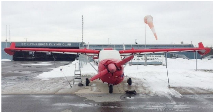
Cessna 337 Skymaster Winter Cover Set

WINTER USE MATERIAL - Made with Solution-Dyed Polyester fabric, this option is intended for seasonal use to aid in deicing, rain mitigation, or for occasional travel. The material is lighter and more compact, but more susceptible to UV damage and may have a shorter useful life if used continuously outside than the all-year use material.