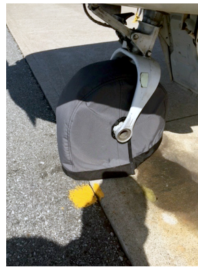
Cessna 337 Skymaster (O-2, O-2A) Tire Covers