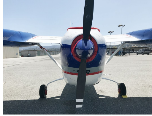
Cessna 337 Skymaster Rear Engine Plugs, Rear Engine Inlet Cover (SOLD SEPARATELY)