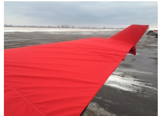
Cessna 337 Skymaster Wing Covers, with winglets