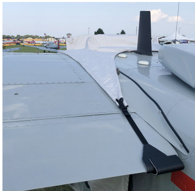
Cessna 337 Skymaster Canopy Cover

This cover type is made from Silver Acrylic Sunbrella canvas and is 100% lined with a soft and smooth microfiber. Bruce's Custom Covers developed this material combination especially for aircraft protection. The outer material is medium weight and treated for water resistance, UV resistance and anti-static buildup. The inner lining is a very soft and smooth microfiber to prevent scratching. The material is very reflective, and tests show that the cabin interior temperature can be reduced to near-ambient temperature on the hottest of days. It is water, ice and snow repellent, yet breathable to allow moisture to escape from between the cover and the aircraft surface.