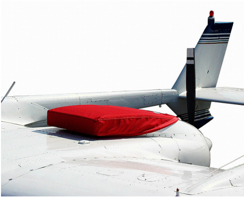
Cessna 337 Skymaster Aft Engine Cover