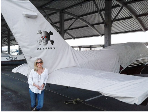
Cessna 310R Empennage Cover

shorter useful life if used continuously outside than the all-year use material.