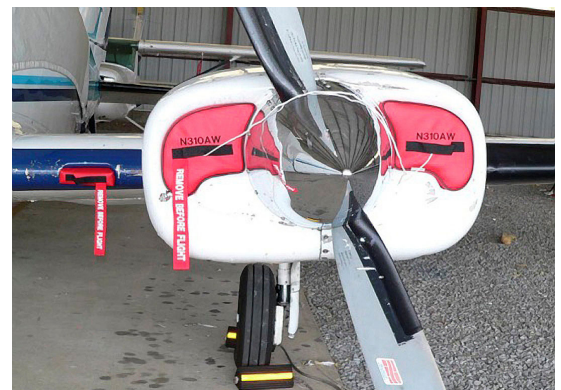
Cessna 310P Engine Inlet and Center Section Inlet Plugs