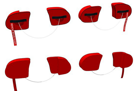
Cessna 414A Engine Plugs