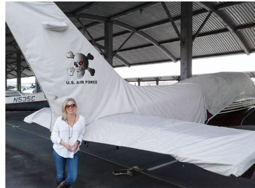
Cessna 310R Empennage Cover