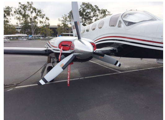
Cessna 414 Engine Inlet Plugs