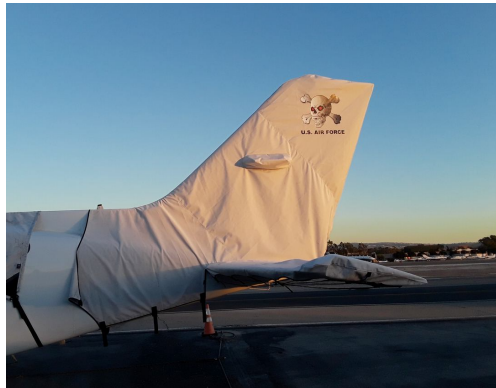
Cessna 421 Empennage Cover

shorter useful life if used continuously outside than the all-year use material.