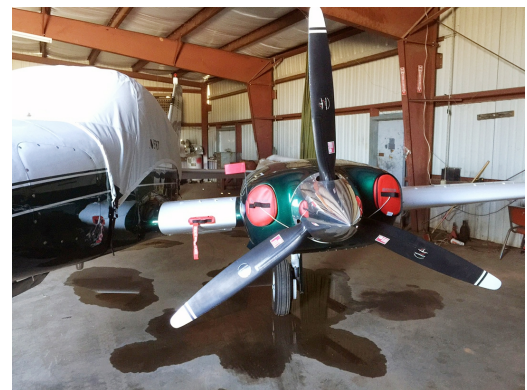
Cessna 310 Engine and Center Section Plugs