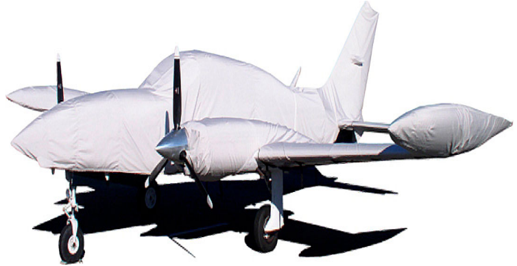
Cessna 310 Complete Cover Set