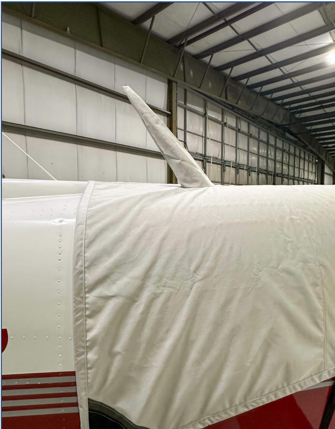
Cessna T303 Canopy Cover