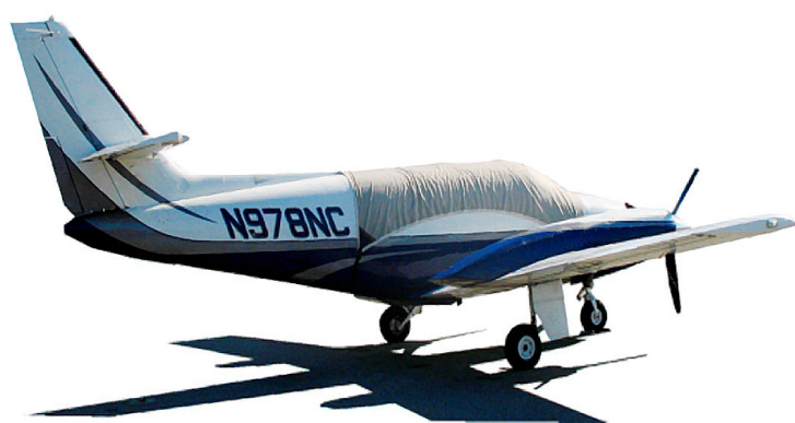
Cessna 303 Crusader Canopy Cover

Travel Covers are made with Silver Solution-Dyed Polyester fabric and only lined over the windshield to save weight. The material is lightweight and more compact for easy stowage in the aircraft. The polyester material is water resistant, but only intended for occasional use outside. We also have an ultra lightweight material available for fitted hangar dust covers. For daily outdoor use, the non-travel Sunbrella Cover is the best choice.