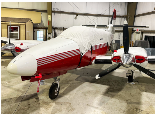
Cessna T303 Canopy Cover, Engine Plugs