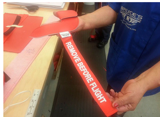
Cessna 150 Pitot Cover