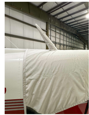
Cessna T303 Canopy Cover