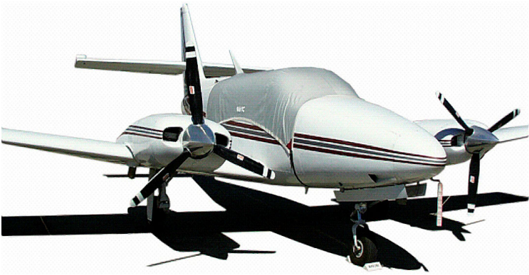
Cessna Crusader Standard Canopy Cover