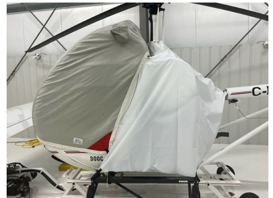
Schweizer 300C Engine Cover, test fit cover