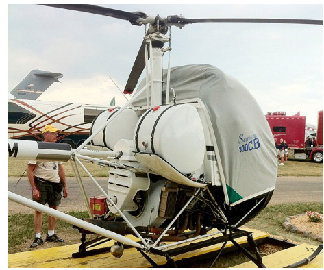
Schweizer 300CB Bubble Cover