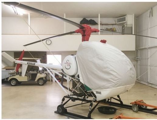
Schweizer 269C Bubble cover