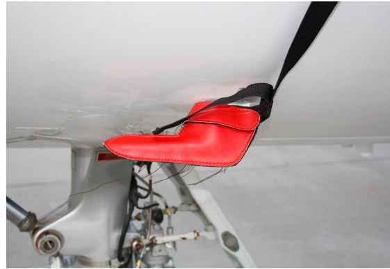
Falcon Jet 2000EX, 2000LXS Pitot Covers, Aoa's, Tat Cover Set, Heat Resistant Type