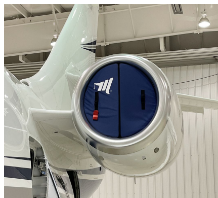
Falcon Jet Engine Inlet Plugs Folding Type