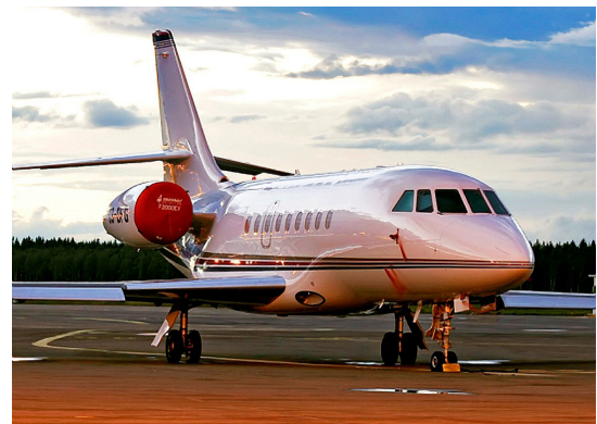
Falcon 2000EX Engine Covers, OEM type