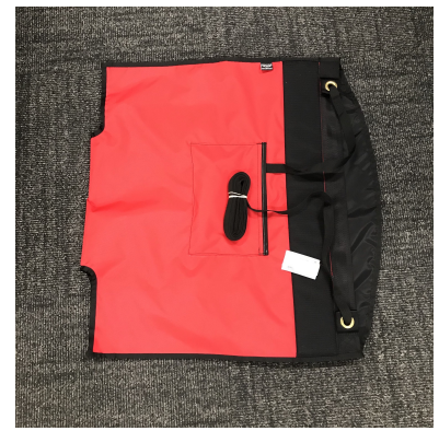
Full size blade cover.