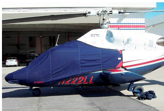
Bell 222 Bubble Cover