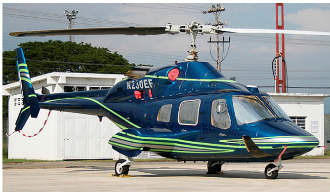
Bell 230 Engine Plugs, HeatShields

Heatshields are interior sunshades for an aircraft's windows or canopy glass. The product is a unique composite of closed-cell foam with a silver mylar finish. The semi-rigid design is stiff enough to stand along the inside of the windshield using sun visors or window framing. It folds up flat and easily stores in the included storage sleeve. Some designs may require velcro and suction cups. A Heatshield is an excellent short-term remedy for cockpit overheating.