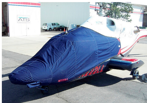
Bell 222 Bubble Cover

This cover type is made from Silver Acrylic Sunbrella canvas and is 100% lined with a soft and smooth microfiber. Bruce's Custom Covers developed this material combination especially for aircraft protection. The outer material is medium weight and treated for water resistance, UV resistance and anti-static buildup. The inner lining is a very soft and smooth microfiber to prevent scratching. The material is very reflective, and tests show that the cabin interior temperature can be reduced to near-ambient temperature on the hottest of days. It is water, ice and snow repellent, yet breathable to allow moisture to escape from between the cover and the aircraft surface.