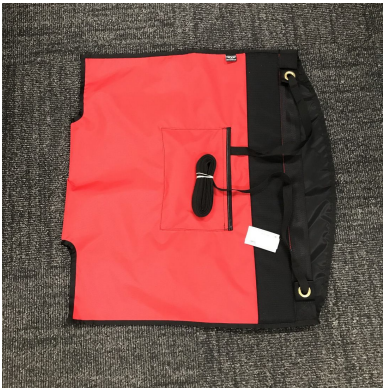
Bell 230 Blade Tie-Downs, (Semi-Rigid) W/Telescoping Attachment Handle