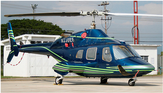
Bell 230 Engine Plugs, HeatShields