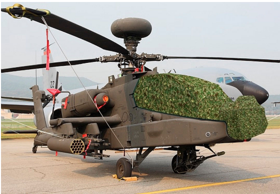
Canopy/Nose Cover, covers canopy glass and TADS