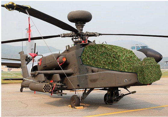
Canopy/Nose Cover, covers canopy glass and TADS

This cover type is made from Silver Acrylic Sunbrella canvas and is 100% lined with a soft and smooth microfiber. Bruce's Custom Covers developed this material combination especially for aircraft protection. The outer material is medium weight and treated for water resistance, UV resistance and anti-static buildup. The inner lining is a very soft and smooth microfiber to prevent scratching. The material is very reflective, and tests show that the cabin interior temperature can be reduced to near-ambient temperature on the hottest of days. It is water, ice and snow repellent, yet breathable to allow moisture to escape from between the cover and the aircraft surface.