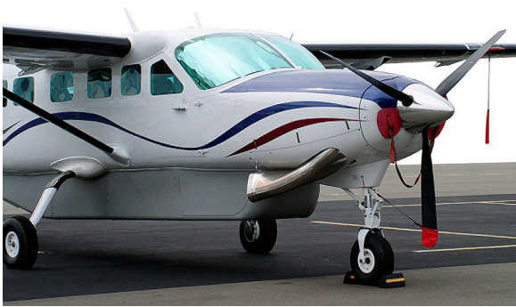
Cessna Caravan Windshield HeatShield, Plugs, Prop Ties & Pitot Cover

Heatshields are interior sunshades for an aircraft's windows or canopy glass. The product is a unique composite of closed-cell foam with a silver mylar finish. The semi-rigid design is stiff enough to stand along the inside of the windshield using sun visors or window framing. It folds up flat and easily stores in the included storage sleeve. Some designs may require velcro and suction cups. A Heatshield is an excellent short-term remedy for cockpit overheating.