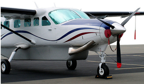
Cessna Caravan Windshield HeatShield, Plugs, Prop Ties & Pitot Cover

Heatshields are interior sunshades for an aircraft's windows or canopy glass. The product is a unique composite of closed-cell foam with a silver mylar finish. The semi-rigid design is stiff enough to stand along the inside of the windshield using sun visors or window framing. It folds up flat and easily stores in the included storage sleeve. Some designs may require velcro and suction cups. A Heatshield is an excellent short-term remedy for cockpit overheating.