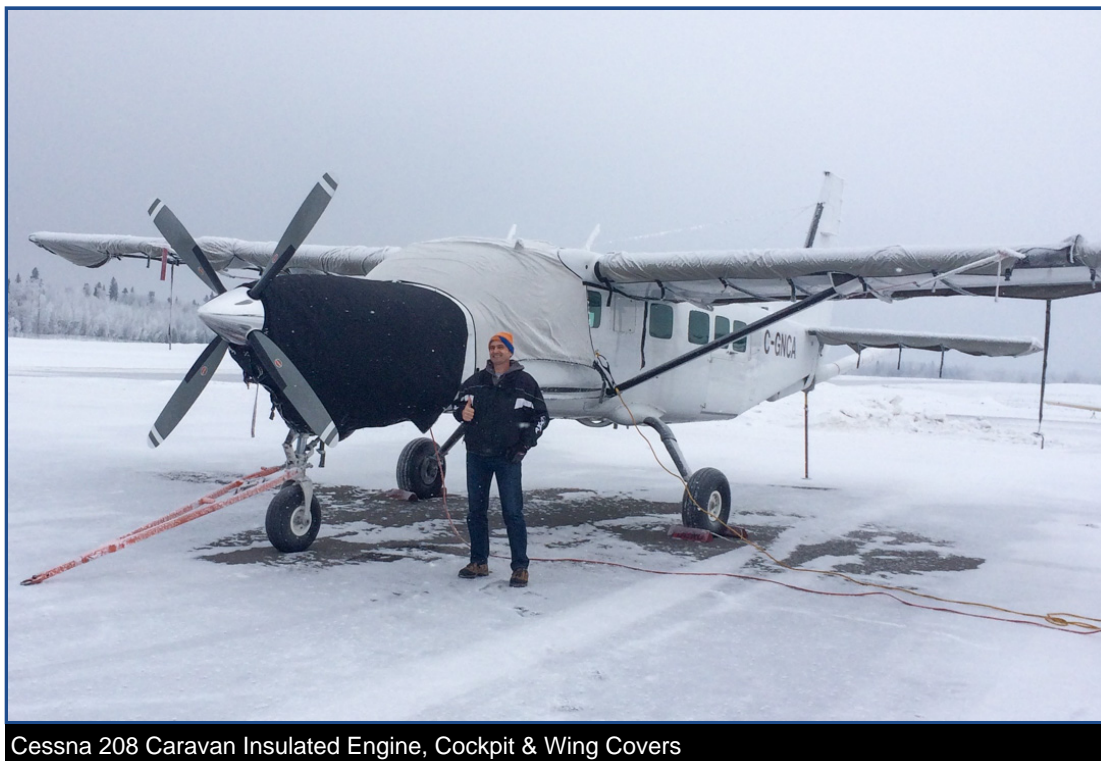
Cessna 208 Caravan Insulated Engine, Cockpit &amp; Wing Covers