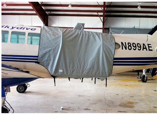
750XL Jump Door Cover