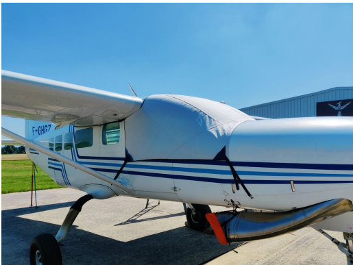
Cessna Caravan 208A Cockpit Cover