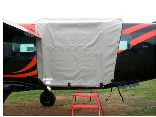
Cessna 208 Caravan Jump Door Cover