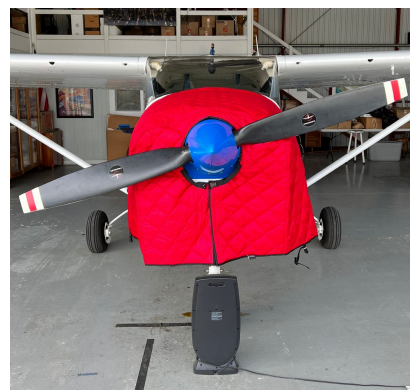
Insulated Hangar Blanket on Cessna 182