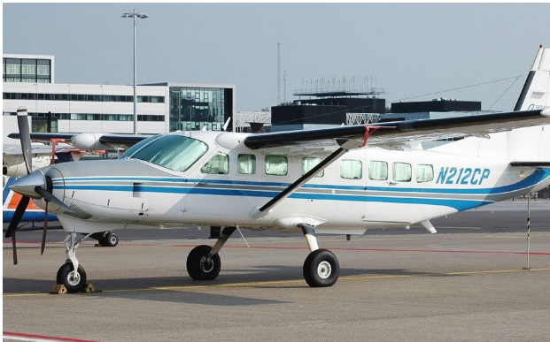
Cessna 208 Caravan, U-27A, AC-208 Heatshield Set (208a Models)