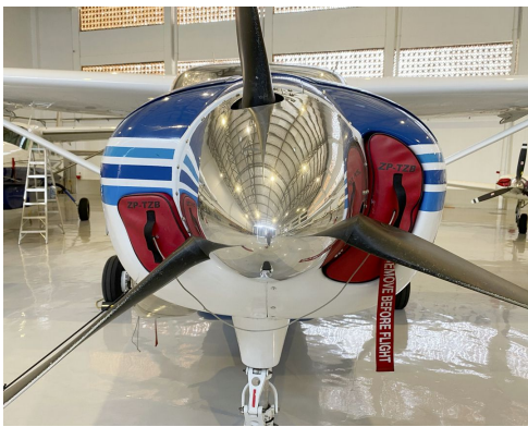
Cessna 208 Caravan Engine Inlet Plugs