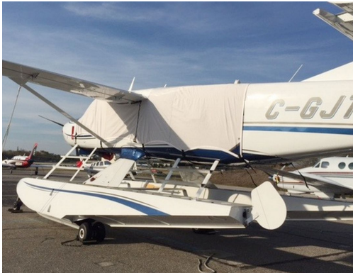
Cessna Caravan Canopy Cover

This cover type is made from Silver Acrylic Sunbrella canvas and is 100% lined with a soft and smooth microfiber. Bruce's Custom Covers developed this material combination especially for aircraft protection. The outer material is medium weight and treated for water resistance, UV resistance and anti-static buildup. The inner lining is a very soft and smooth microfiber to prevent scratching. The material is very reflective, and tests show that the cabin interior temperature can be reduced to near-ambient temperature on the hottest of days. It is water, ice and snow repellent, yet breathable to allow moisture to escape from between the cover and the aircraft surface.