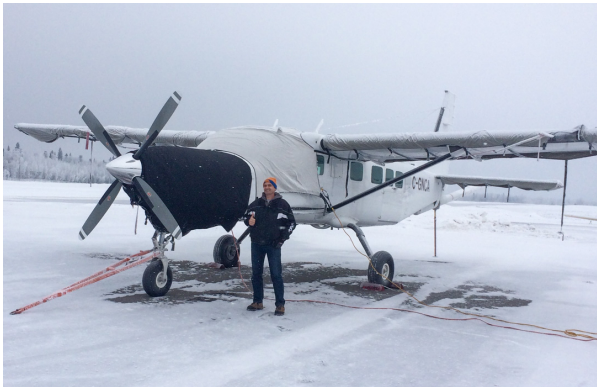
Cessna 208 Caravan Insulated Engine, Cockpit & Wing Covers

WINTER USE MATERIAL - Made with Solution-Dyed Polyester fabric, this option is intended for seasonal use to aid in deicing, rain mitigation, or for occasional travel. The material is lighter and more compact, but more susceptible to UV damage and may have a shorter useful life if used continuously outside than the all-year use material.