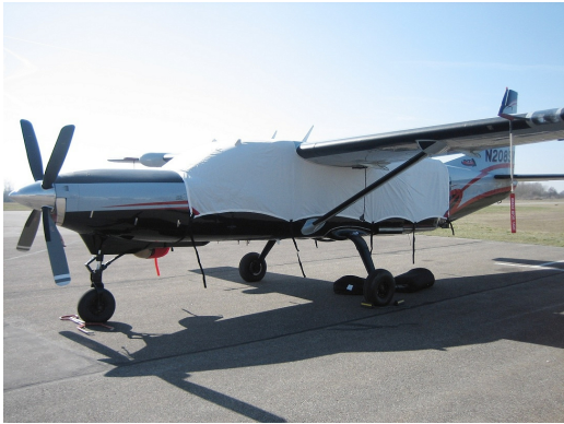
Cessna Caravan Canopy Cover

The material is very reflective, and tests show that the cabin interior temperature can be reduced to near-ambient temperature on the hottest of days. It is water, ice and snow repellent, yet breathable to allow moisture to escape from between the cover and the aircraft surface.