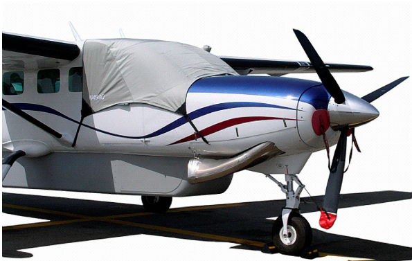
Cessna Caravan Windshield Cover, Plugs, Prop Ties & Pitot Cover