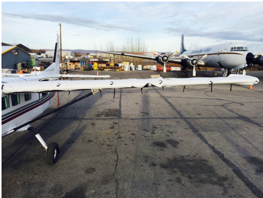
Cessna 208 Caravan Wing & Horiz. Stab Covers

WINTER USE MATERIAL - Made with Solution-Dyed Polyester fabric, this option is intended for seasonal use to aid in deicing, rain mitigation, or for occasional travel. The material is lighter and more compact, but more susceptible to UV damage and may have a shorter useful life if used continuously outside than the all-year use material.