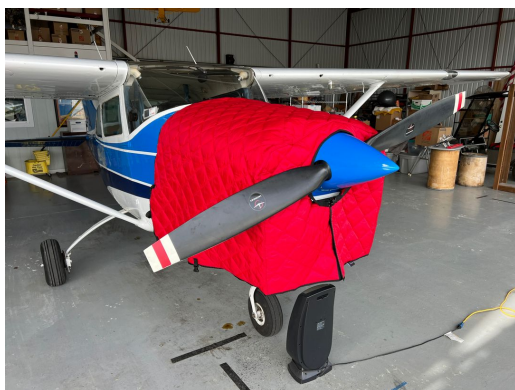
Insulated Hangar Blanket on Cessna 182

This cover type is made from Silver Acrylic Sunbrella canvas and is 100% lined with a soft and smooth microfiber. Bruce's Custom Covers developed this material combination especially for aircraft protection. The outer material is medium weight and treated for water resistance, UV resistance and anti-static buildup. The inner lining is a very soft and smooth microfiber to prevent scratching. The material is very reflective, and tests show that the cabin interior temperature can be reduced to near-ambient temperature on the hottest of days. It is water, ice and snow repellent, yet breathable to allow moisture to escape from between the cover and the aircraft surface.