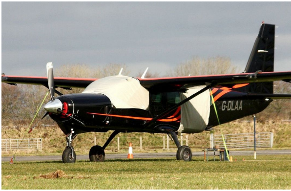
Cessna Caravan Cockpit Cover, Engine Plugs, Jump Door Cover