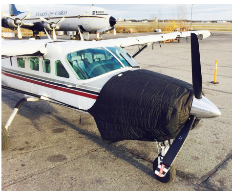
Cessna 208 Caravan Insulated Engine Cover, fully enclosed

This cover type is made from Silver Acrylic Sunbrella canvas and is 100% lined with a soft and smooth microfiber. Bruce's Custom Covers developed this material combination especially for aircraft protection. The outer material is medium weight and treated for water resistance, UV resistance and anti-static buildup. The inner lining is a very soft and smooth microfiber to prevent scratching. The material is very reflective, and tests show that the cabin interior temperature can be reduced to near-ambient temperature on the hottest of days. It is water, ice and snow repellent, yet breathable to allow moisture to escape from between the cover and the aircraft surface.