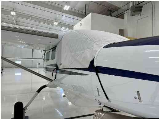
Cessna 208 Caravan Cockpit Cover

This cover type is made from Silver Acrylic Sunbrella canvas and is 100% lined with a soft and smooth microfiber. Bruce's Custom Covers developed this material combination especially for aircraft protection. The outer material is medium weight and treated for water resistance, UV resistance and anti-static buildup. The inner lining is a very soft and smooth microfiber to prevent scratching. The material is very reflective, and tests show that the cabin interior temperature can be reduced to near-ambient temperature on the hottest of days. It is water, ice and snow repellent, yet breathable to allow moisture to escape from between the cover and the aircraft surface.