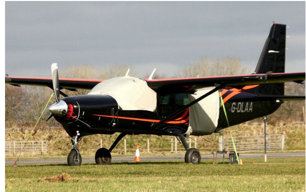
Cessna 208 Caravan Insulated Engine, Cockpit & Wing Covers Cessna Caravan Cockpit Cover, Engine Plugs, Jump Door Cover