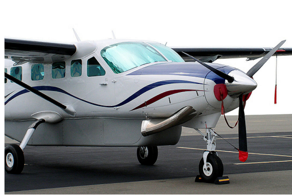
Cessna Caravan Windshield HeatShield, Plugs, Prop Ties & Pitot Cover