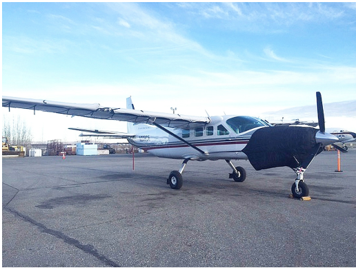
Cessna 208 Caravan Insulated Engine Cover & Wing Covers