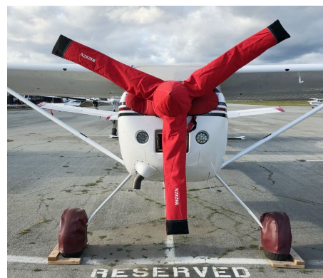
Cessna Skywagon Propellor/Spinner Cover, 3-blade type