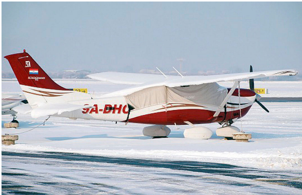
Cessna 206 Wrap-Around Canopy Cover

This cover type is made from Silver Acrylic Sunbrella canvas and is 100% lined with a soft and smooth microfiber. Bruce's Custom Covers developed this material combination especially for aircraft protection. The outer material is medium weight and treated for water resistance, UV resistance and anti-static buildup. The inner lining is a very soft and smooth microfiber to prevent scratching. The material is very reflective, and tests show that the cabin interior temperature can be reduced to near-ambient temperature on the hottest of days. It is water, ice and snow repellent, yet breathable to allow moisture to escape from between the cover and the aircraft surface.