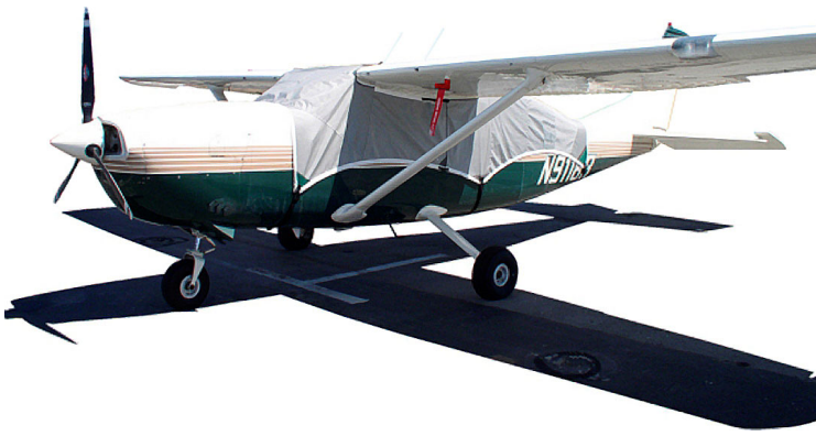
Cessna 207 Canopy Cover