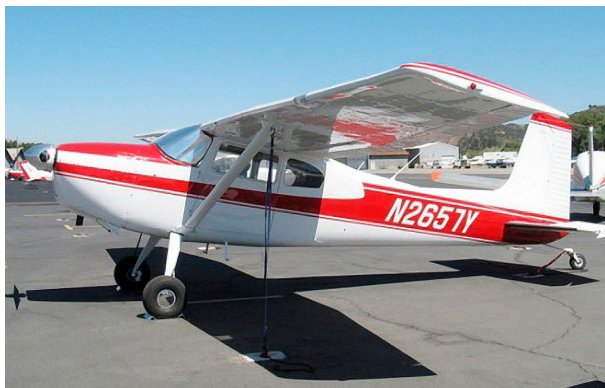
Cessna 180 & 185 Windshield HeatShield