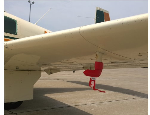
Mooney Pitot Cover