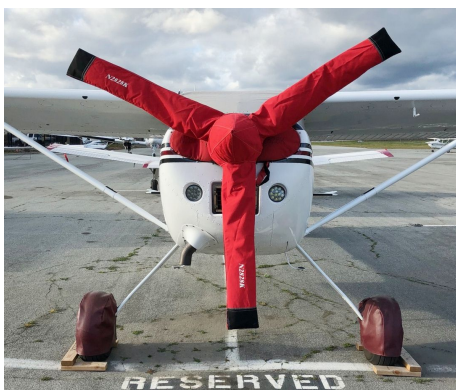
Cessna Skywagon Propellor/Spinner Cover, 3-blade type

This cover type is made from Silver Acrylic Sunbrella canvas and is 100% lined with a soft and smooth microfiber. Bruce's Custom Covers developed this material combination especially for aircraft protection. The outer material is medium weight and treated for water resistance, UV resistance and anti-static buildup. The inner lining is a very soft and smooth microfiber to prevent scratching. The material is very reflective, and tests show that the cabin interior temperature can be reduced to near-ambient temperature on the hottest of days. It is water, ice and snow repellent, yet breathable to allow moisture to escape from between the cover and the aircraft surface.