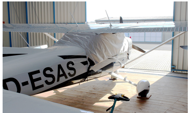
Cessna 206 Stationair Canopy Cover, Wrap-Around