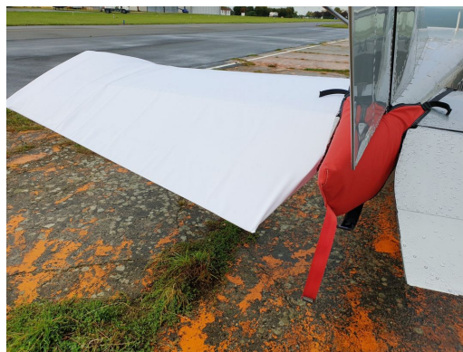
Cessna 207 Tailcone Cover, Horizontal Stab. Cover (test fit)