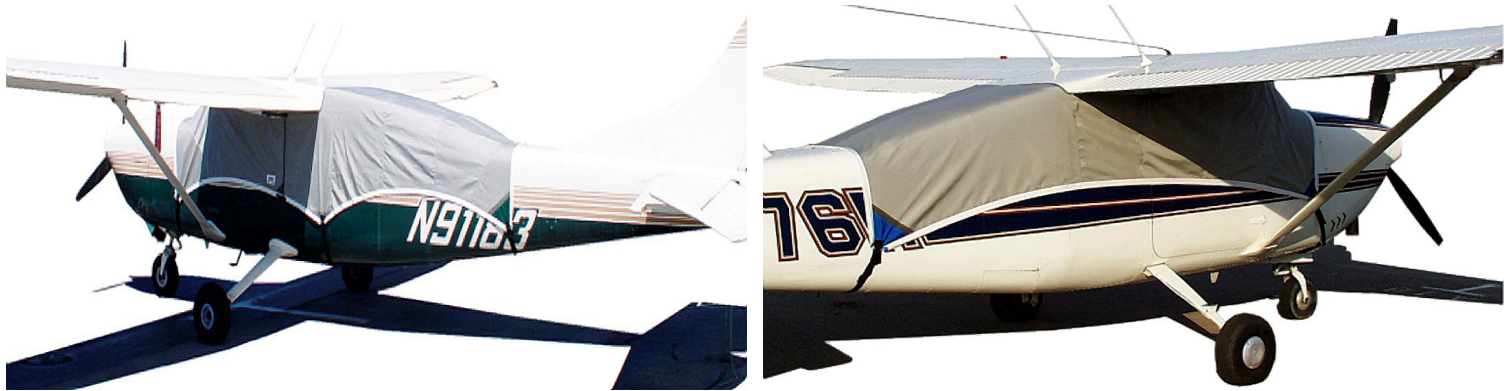
Cessna 207 Canopy Cover

This cover type is made from Silver Acrylic Sunbrella canvas and is 100% lined with a soft and smooth microfiber. Bruce's Custom Covers developed this material combination especially for aircraft protection. The outer material is medium weight and treated for water resistance, UV resistance and anti-static buildup. The inner lining is a very soft and smooth microfiber to prevent scratching. The material is very reflective, and tests show that the cabin interior temperature can be reduced to near-ambient temperature on the hottest of days. It is water, ice and snow repellent, yet breathable to allow moisture to escape from between the cover and the aircraft surface.