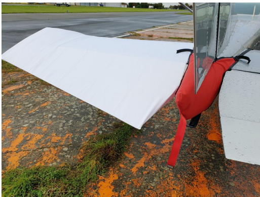
Cessna 207 Tailcone Cover, Horizontal Stab. Cover (test fit)

WINTER USE MATERIAL - Made with Solution-Dyed Polyester fabric, this option is intended for seasonal use to aid in deicing, rain mitigation, or for occasional travel. The material is lighter and more compact, but more susceptible to UV damage and may have a shorter useful life if used continuously outside than the all-year use material.