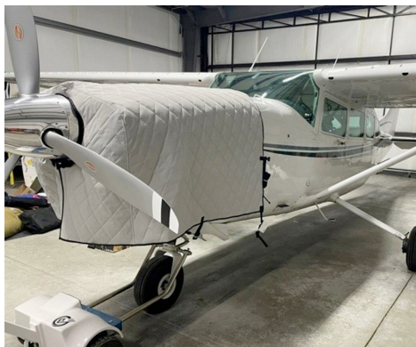
Cessna 207 Insulated Hangar Blanket

This cover type is made from Silver Acrylic Sunbrella canvas and is 100% lined with a soft and smooth microfiber. Bruce's Custom Covers developed this material combination especially for aircraft protection. The outer material is medium weight and treated for water resistance, UV resistance and anti-static buildup. The inner lining is a very soft and smooth microfiber to prevent scratching. The material is very reflective, and tests show that the cabin interior temperature can be reduced to near-ambient temperature on the hottest of days. It is water, ice and snow repellent, yet breathable to allow moisture to escape from between the cover and the aircraft surface.