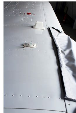
Cessna 206 Stationair Canopy Cover, Wrap-Around