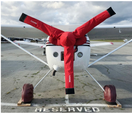
Cessna Skywagon Propellor/Spinner Cover, 3-blade type

This cover type is made from Silver Acrylic Sunbrella canvas and is 100% lined with a soft and smooth microfiber. Bruce's Custom Covers developed this material combination especially for aircraft protection. The outer material is medium weight and treated for water resistance, UV resistance and anti-static buildup. The inner lining is a very soft and smooth microfiber to prevent scratching. The material is very reflective, and tests show that the cabin interior temperature can be reduced to near-ambient temperature on the hottest of days. It is water, ice and snow repellent, yet breathable to allow moisture to escape from between the cover and the aircraft surface.