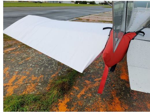
Cessna 207 Tailcone Cover, Horizontal Stab. Cover (test fit)