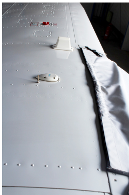
Cessna 206 Stationair Canopy Cover, Wrap-Around

This cover type is made from Silver Acrylic Sunbrella canvas and is 100% lined with a soft and smooth microfiber. Bruce's Custom Covers developed this material combination especially for aircraft protection. The outer material is medium weight and treated for water resistance, UV resistance and anti-static buildup. The inner lining is a very soft and smooth microfiber to prevent scratching. The material is very reflective, and tests show that the cabin interior temperature can be reduced to near-ambient temperature on the hottest of days. It is water, ice and snow repellent, yet breathable to allow moisture to escape from between the cover and the aircraft surface.