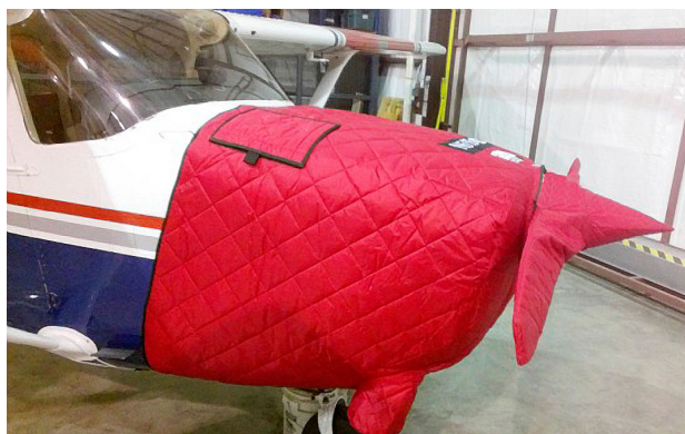
Cessna 172 Insulated Engine Cover w/ Oil Filler Door flap and Insulated Prop/Spinner Cover