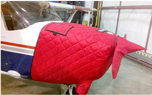
Cessna 172 Insulated Engine Cover w/ Oil Filler Door flap and Insulated Prop/Spinner Cover