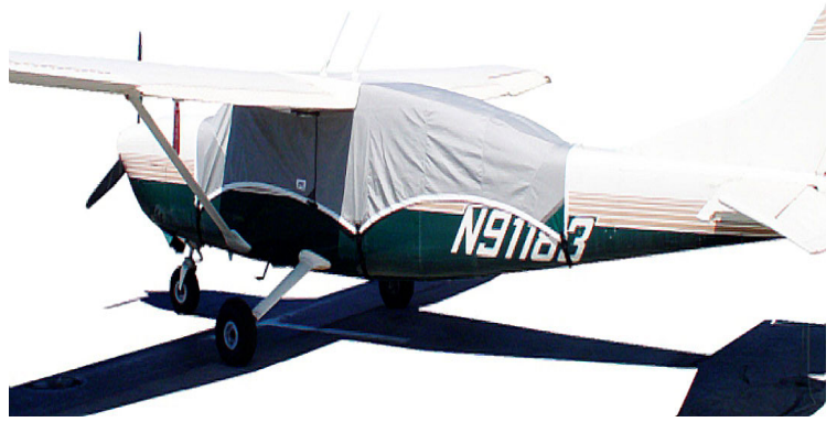
Cessna 207 Canopy Cover