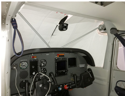
Cessna 180 Skywagon Windshield Heatshield, (W/ Compass)