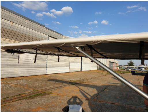
Cessna 207 Wing Covers

WINTER USE MATERIAL - Made with Solution-Dyed Polyester fabric, this option is intended for seasonal use to aid in deicing, rain mitigation, or for occasional travel. The material is lighter and more compact, but more susceptible to UV damage and may have a shorter useful life if used continuously outside than the all-year use material.