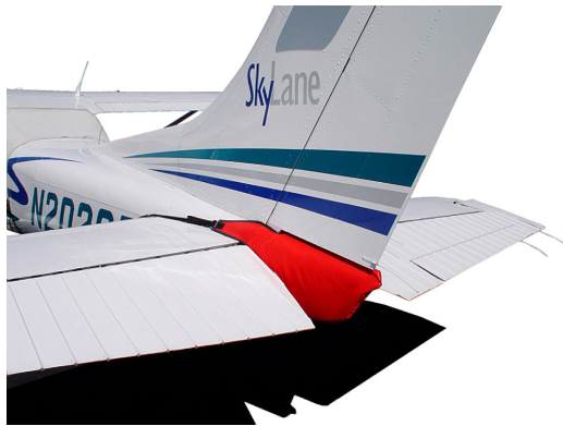
Cessna 182 Tailcone Cover

WINTER USE MATERIAL - Made with Solution-Dyed Polyester fabric, this option is intended for seasonal use to aid in deicing, rain mitigation, or for occasional travel. The material is lighter and more compact, but more susceptible to UV damage and may have a shorter useful life if used continuously outside than the all-year use material.