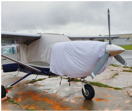
Cessna 207 Engine Cover (test fit)

This cover type is made from Silver Acrylic Sunbrella canvas and is 100% lined with a soft and smooth microfiber. Bruce's Custom Covers developed this material combination especially for aircraft protection. The outer material is medium weight and treated for water resistance, UV resistance and anti-static buildup. The inner lining is a very soft and smooth microfiber to prevent scratching. The material is very reflective, and tests show that the cabin interior temperature can be reduced to near-ambient temperature on the hottest of days. It is water, ice and snow repellent, yet breathable to allow moisture to escape from between the cover and the aircraft surface.