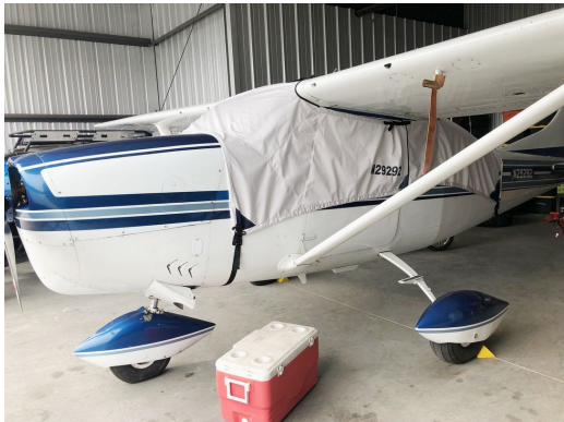
Cessna 206 Wrap-Around Canopy Cover