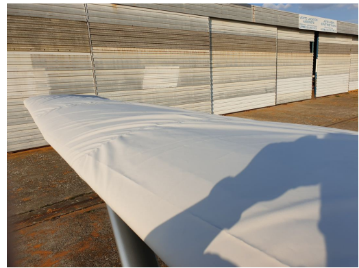
Cessna 207 Wing Covers