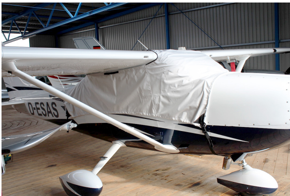
Cessna 206 Stationair Canopy Cover, Wrap-Around

This cover type is made from Silver Acrylic Sunbrella canvas and is 100% lined with a soft and smooth microfiber. Bruce's Custom Covers developed this material combination especially for aircraft protection. The outer material is medium weight and treated for water resistance, UV resistance and anti-static buildup. The inner lining is a very soft and smooth microfiber to prevent scratching. The material is very reflective, and tests show that the cabin interior temperature can be reduced to near-ambient temperature on the hottest of days. It is water, ice and snow repellent, yet breathable to allow moisture to escape from between the cover and the aircraft surface.