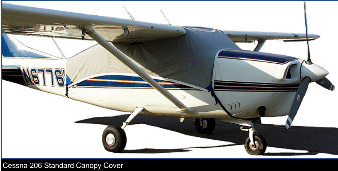
Cessna 206 Standard Canopy Cover