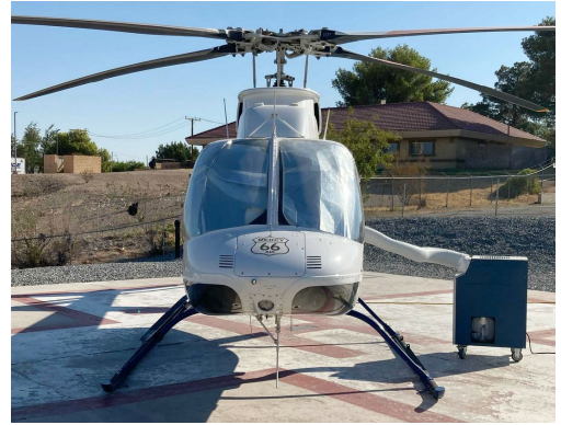
Bell 407 Windshield HeatShields