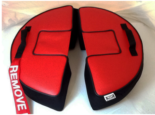
Bell 206 Swash Plate Plug