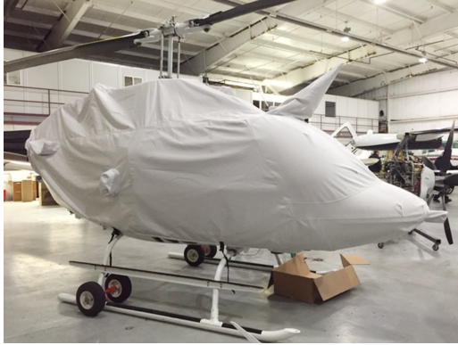
Bell JetRanger 206B Main Body Cover

This cover type is made from Silver Acrylic Sunbrella canvas and is 100% lined with a soft and smooth microfiber. Bruce's Custom Covers developed this material combination especially for aircraft protection. The outer material is medium weight and treated for water resistance, UV resistance and anti-static buildup. The inner lining is a very soft and smooth microfiber to prevent scratching. The material is very reflective, and tests show that the cabin interior temperature can be reduced to near-ambient temperature on the hottest of days. It is water, ice and snow repellent, yet breathable to allow moisture to escape from between the cover and the aircraft surface.