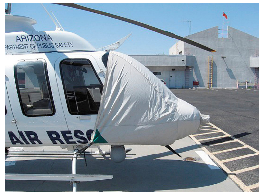
Bell 206L Windshield/Nose Cover