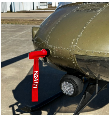
Bell 206B Jetranger Pitot Cover+

WINTER USE MATERIAL - Made with Solution-Dyed Polyester fabric, this option is intended for seasonal use to aid in deicing, rain mitigation, or for occasional travel. The material is lighter and more compact, but more susceptible to UV damage and may have a shorter useful life if used continuously outside than the all-year use material.