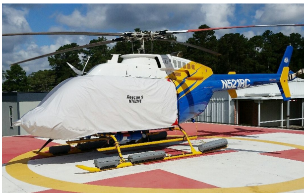
Bell 407 Bubble Cover, with Wire Strike option

Travel Covers are made with Silver Solution-Dyed Polyester fabric and fully lined over the entire cover. The material is lightweight and more compact for easy stowage in the aircraft. The polyester material is water resistant, but only intended for occasional use outside. We also have an ultra lightweight material available for fitted hangar dust covers. For daily outdoor use, the non-travel Sunbrella Cover is the best choice.