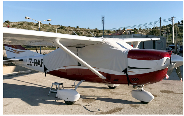
Cessna 206 Stationair Canopy Cover, Over-Top Style