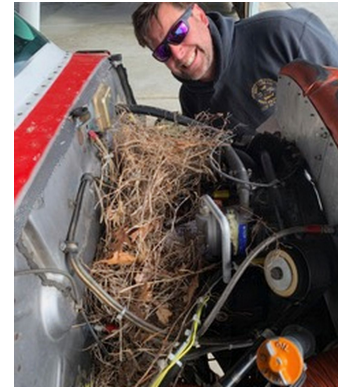
Cessna 172 Bird Nest Problem