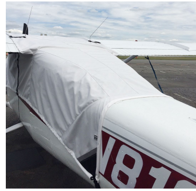
Cessna 205 Over-Top Canopy Cover