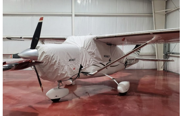
Textron Aviation Inc T206H Canopy cover over the top