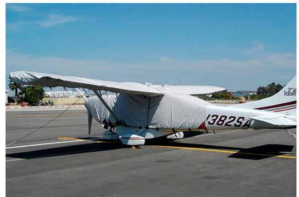
Wing Covers on Cessna 206