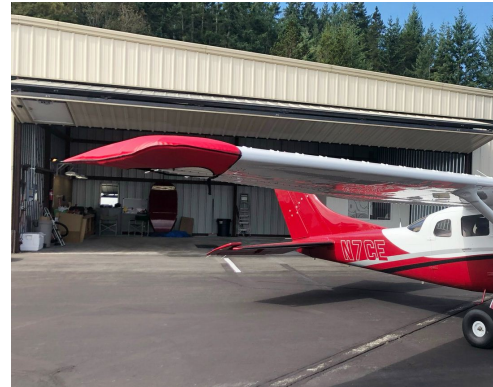
Cessna 206 Wingtip Pads