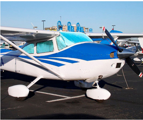
Cessna 182 HeatShield Set

Windshield Heatshields are interior sunshades for an aircraft's front windshield. The product is a unique composite of closed-cell foam with a silver mylar finish. The semi-rigid design is stiff enough to stand along the inside of the windshield using sun visors or window framing. It folds up flat and easily stores in the included storage sleeve. Some designs may require velcro and suction cups or split right and left sides. A Heatshield is an excellent short-term remedy for cockpit overheating. An external fabric cover is far more effective and practical for long-term protection.