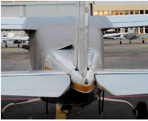
Cessna 210 Over-the-Top Canopy Cover