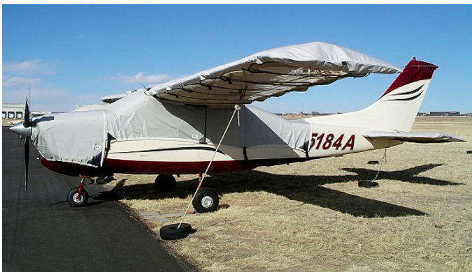
Wing Covers on Cessna 210

WINTER USE MATERIAL - Made with Solution-Dyed Polyester fabric, this option is intended for seasonal use to aid in deicing, rain mitigation, or for occasional travel. The material is lighter and more compact, but more susceptible to UV damage and may have a shorter useful life if used continuously outside than the all-year use material.