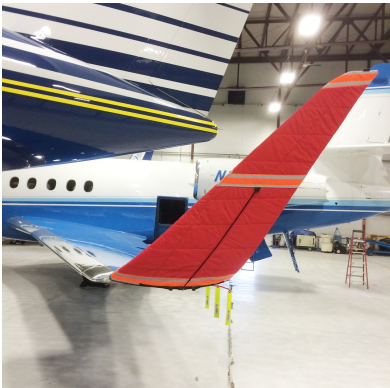
Falcon 2000 Winglet Pad

shorter useful life if used continuously outside than the all-year use material.