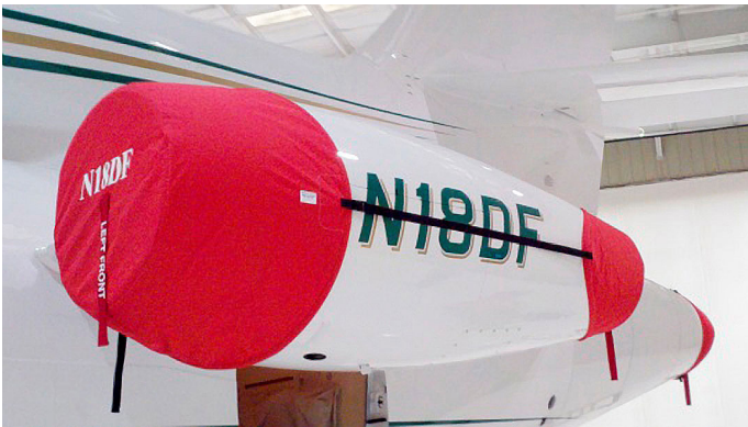
Falcon 900 Engine Cover Set

The Falcon Jet 2000 Intake Covers are designed to install easily yet be completely storable. A spring steel hoop is sewn into the hem of each cover, allowing them to be installed without climbing onto the wing or using a stepladder. To store the covers the spring steel hoop folds like a band-saw blade into three nesting rings. Each cover folds into a compact circular bundle which is stored in the included duffle bag, yet they unfold quickly for use. The Tri-Fold Ring cover is made of medium weight nylon which is available in a variety of colors to match the paint trim. Each cover set comes complete with installation and folding instructions. The aircraft's registration number can be silkscreened onto the cover for an extra charge.