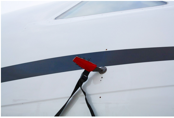
Falcon Jet 2000 Pitot Covers, Aoa's, Tat Cover Set, Heat Resistant Type