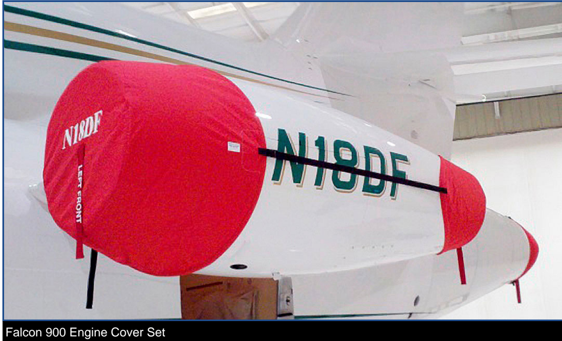
Falcon 900 Engine Cover Set