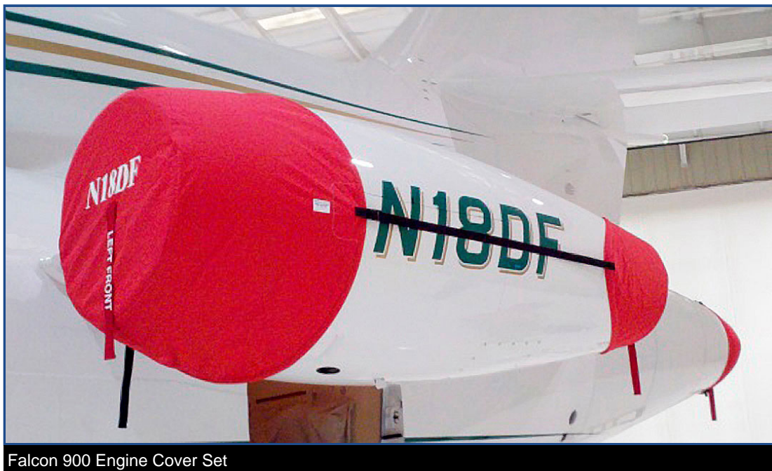
Falcon 900 Engine Cover Set