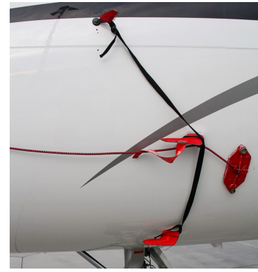
Falcon Jet 2000 Pitot Covers, Aoa's, Tat Cover Set, Heat Resistant Type