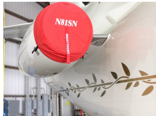
Falcon 900EX Intake Cover