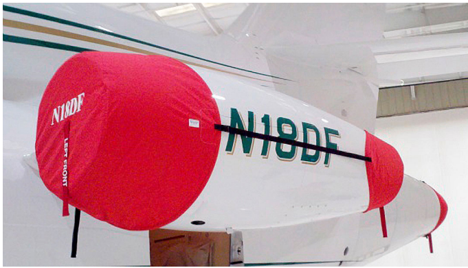
Falcon 900 Engine Cover Set

The Falcon Jet 2000 Intake Covers are designed to install easily yet be completely storable. A spring steel hoop is sewn into the hem of each cover, allowing them to be installed without climbing onto the wing or using a stepladder. To store the covers the spring steel hoop folds like a band-saw blade into three nesting rings. Each cover folds into a compact circular bundle which is stored in the included duffle bag, yet they unfold quickly for use. The Tri-Fold Ring cover is made of medium weight nylon which is available in a variety of colors to match the paint trim. Each cover set comes complete with installation and folding instructions. The aircraft's registration number can be silkscreened onto the cover for an extra charge.