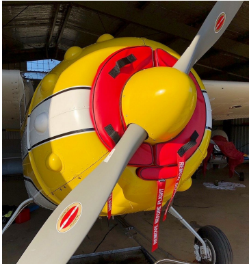
Cessna 195 Engine Plugs

Engine Inlet Plugs are custom fit for your Cessna 190 & 195 intakes, made with heavy-duty vinyl material, and stuffed with a single block of sculpted urethane foam. Each plug has a zipper that allows the foam to be removed and dried if necessary. Engine plugs have warning flags that are visible from the cockpit or 'remove before flight' streamers sewn onto the face of the plugs. Most plugs are imprinted with the aircraft registration number in black for an extra charge. Storage bag NOT included. Engine plugs may be inserted after flight when the engine is still warm. Engine Inlet Plugs are commonly referred to as Cowl Plugs, Intake Plugs, Cowl Blocks, Engine Blocks, and Engine Bungs.