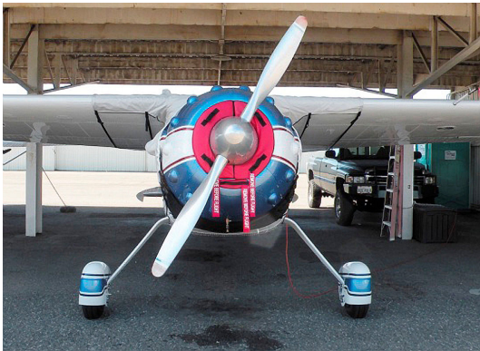
Cessna 195 Engine Inlet Plugs, set of 3