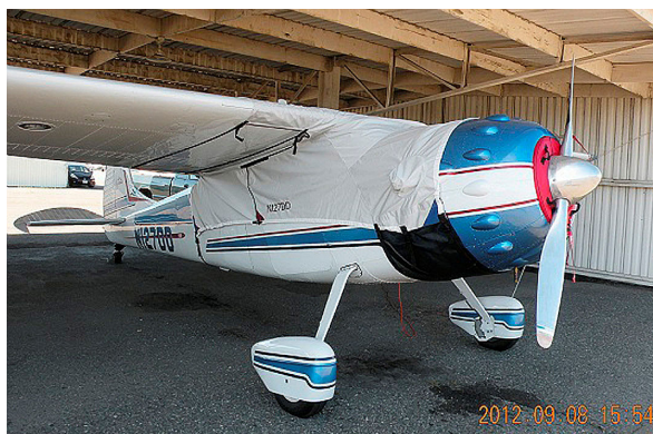
Cessna 195 Over-top Canopy Cover, 24" fwd ext to cover cowl ring gap, gas cap ext. & under belly cowl ring gap mesh covering