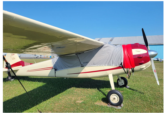
Cessna 190 Travel Cover, Light Weight Canopy Cover, Over-Top Type