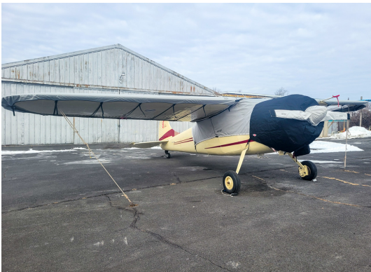
Cessna 190 Travel Canopy, Insulated Engine, Wing & Prop Covers