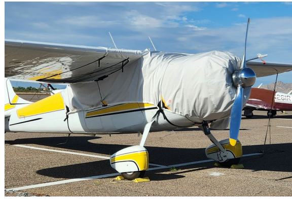
Cessna 190 & 195 Canopy Cover, Over-Top, 12" Fwd Ext, Gas Cap Ext., & Engine Cover