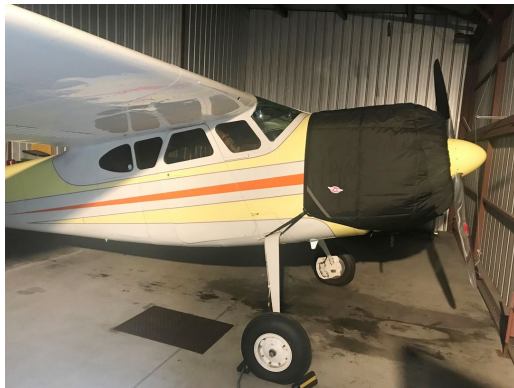
Cessna 195B Insulated Engine Cover

This cover type is made from Silver Acrylic Sunbrella canvas and is 100% lined with a soft and smooth microfiber. Bruce's Custom Covers developed this material combination especially for aircraft protection. The outer material is medium weight and treated for water resistance, UV resistance and anti-static buildup. The inner lining is a very soft and smooth microfiber to prevent scratching. The material is very reflective, and tests show that the cabin interior temperature can be reduced to near-ambient temperature on the hottest of days. It is water, ice and snow repellent, yet breathable to allow moisture to escape from between the cover and the aircraft surface.