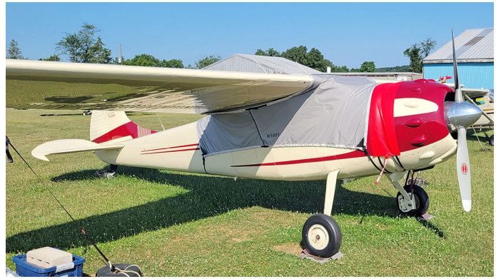
Cessna 190 Travel Cover, Light Weight Canopy Cover, Over-Top Type