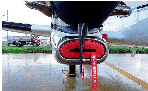
Beech King Air C90B Main Engine Inlet Plug