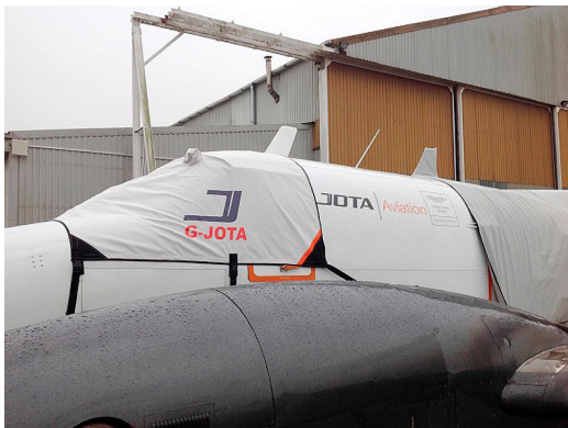
King Air Windshield/Cockpit Cover

The Beech 1900D Nose Cover is designed to cover the section of the fuselage forward of the windshield to the tip of the nose. It is secured with belly straps. This cover type is made from Silver Acrylic Sunbrella canvas and is 100% lined with a soft and smooth microfiber. Bruce's Custom Covers developed this material combination especially for aircraft protection. The outer material is medium weight and treated for water resistance, UV resistance and anti-static buildup. The inner lining is a very soft and smooth microfiber to prevent scratching. The material is very reflective, and tests show that the cabin interior temperature can be reduced to near-ambient temperature on the hottest of days. It is water, ice and snow repellent, yet breathable to allow moisture to escape from between the cover and the aircraft surface.