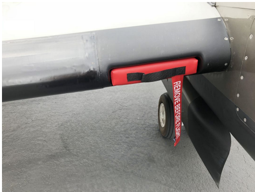
Beech King Air Heat Exchanger Inlet Plug

Engine Inlet Plugs are custom fit for your Beech 1900D intakes, made with heavy-duty vinyl material, and stuffed with a single block of sculpted urethane foam. Each plug has a zipper that allows the foam to be removed and dried if necessary. Engine plugs have warning flags that are visible from the cockpit or 'remove before flight' streamers sewn onto the face of the plugs. Most plugs are imprinted with the aircraft registration number in black for an extra charge. Storage bag NOT included. Engine plugs may be inserted after flight when the engine is still warm. Engine Inlet Plugs are commonly referred to as Cowl Plugs, Intake Plugs, Cowl Blocks, Engine Blocks, and Engine Bunges.