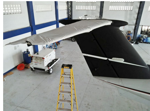
Beech King Air B350 Horizontal Stabilizer Covers