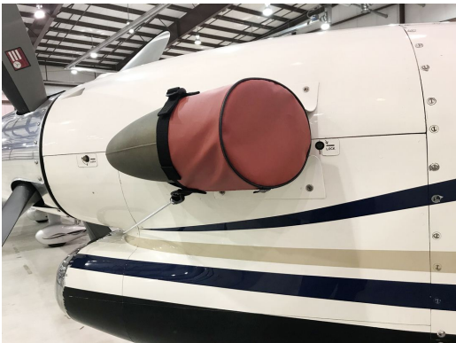
Beech King Air 350 Exhaust Covers