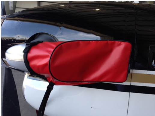
King Air Exhaust Stack Cover

This cover type is made from Silver Acrylic Sunbrella canvas and is 100% lined with a soft and smooth microfiber. Bruce's Custom Covers developed this material combination especially for aircraft protection. The outer material is medium weight and treated for water resistance, UV resistance and anti-static buildup. The inner lining is a very soft and smooth microfiber to prevent scratching. The material is very reflective, and tests show that the cabin interior temperature can be reduced to near-ambient temperature on the hottest of days. It is water, ice and snow repellent, yet breathable to allow moisture to escape from between the cover and the aircraft surface.