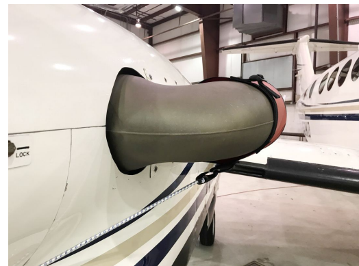
Beech King Air 350 Exhaust Covers