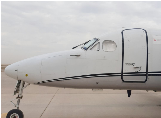
Raytheon 1900D Cockpit HeatShields

Cockpit Heatshields are interior sunshades for the aircraft's cockpit. The product is a unique composite of closed-cell foam with a silver mylar finish. The semi-rigid design is stiff enough to stand inside the window framing. The set folds up flat and is easily stored in the included storage sleeve. Some designs may require velcro and suction cups. A Heatshield is an excellent short-term remedy for cockpit overheating, but an external fabric cover is more effective for long-term protection.