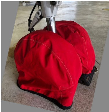
Beech King Air 300 Tire Covers (main gear)