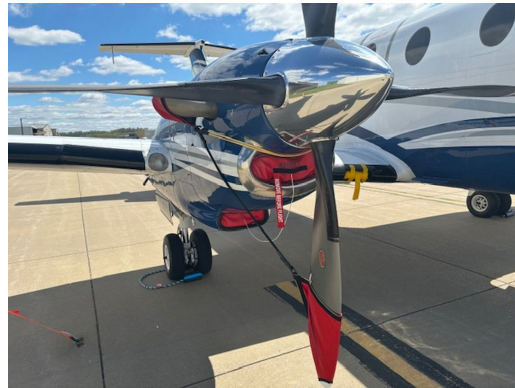
Beech 1900C Engine Inlet & Oil Cooler Plugs, Prop Tie/Exhaust Covers