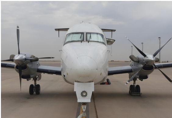
Raytheon 1900D Cockpit HeatShields