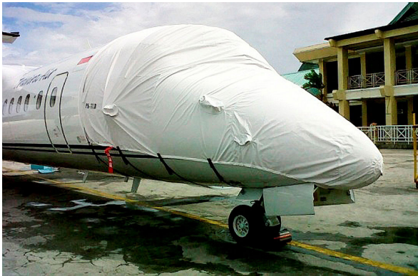
De Havilland Dash 8 Cockpit/Nose Cover