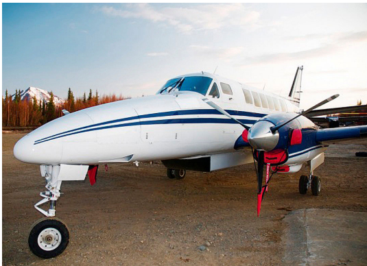
Beech 99 Engine Plugs & Prop Ties