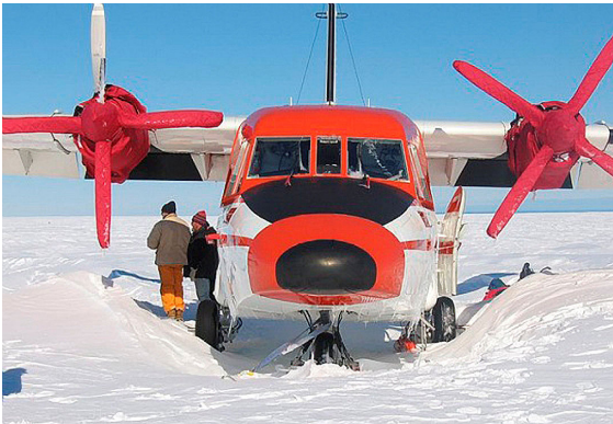
Casa 212 Insulated Engine & Propellor/Spinner Covers

This cover type is made from Silver Acrylic Sunbrella canvas and is 100% lined with a soft and smooth microfiber. Bruce's Custom Covers developed this material combination especially for aircraft protection. The outer material is medium weight and treated for water resistance, UV resistance and anti-static buildup. The inner lining is a very soft and smooth microfiber to prevent scratching. The material is very reflective, and tests show that the cabin interior temperature can be reduced to near-ambient temperature on the hottest of days. It is water, ice and snow repellent, yet breathable to allow moisture to escape from between the cover and the aircraft surface.