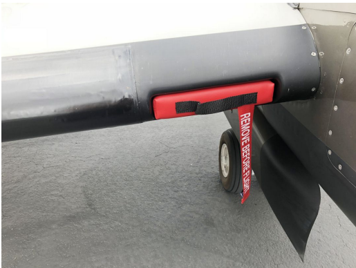
Beech King Air Heat Exchanger Inlet Plug

Engine Inlet Plugs are custom fit for your Beech 1900C intakes, made with heavy-duty vinyl material, and stuffed with a single block of sculpted urethane foam. Each plug has a zipper that allows the foam to be removed and dried if necessary. Engine plugs have warning flags that are visible from the cockpit or 'remove before flight' streamers sewn onto the face of the plugs. Most plugs are imprinted with the aircraft registration number in black for an extra charge. Storage bag NOT included. Engine plugs may be inserted after flight when the engine is still warm. Engine Inlet Plugs are commonly referred to as Cowl Plugs, Intake Plugs, Cowl Blocks, Engine Blocks, and Engine Bungs.