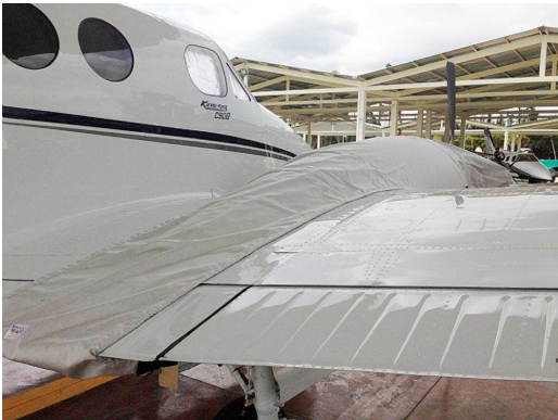
King Air C90 Engine Cover