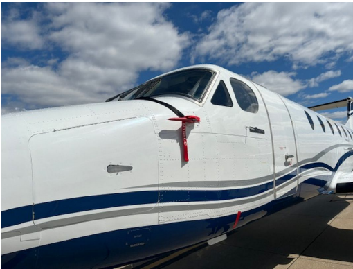
Beech 1900C PITOT COVERS

Engine Inlet Plugs are custom fit for your Beech 1900C intakes, made with heavy-duty vinyl material, and stuffed with a single block of sculpted urethane foam. Each plug has a zipper that allows the foam to be removed and dried if necessary. Engine plugs have warning flags that are visible from the cockpit or 'remove before flight' streamers sewn onto the face of the plugs. Most plugs are imprinted with the aircraft registration number in black for an extra charge. Storage bag NOT included. Engine plugs may be inserted after flight when the engine is still warm. Engine Inlet Plugs are commonly referred to as Cowl Plugs, Intake Plugs, Cowl Blocks, Engine Blocks, and Engine Bungs.