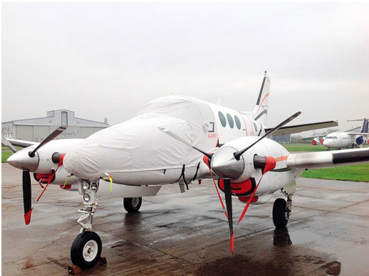
King Air Cockpit/Nose Cover, Plugs, Prop Tie/Exhaust Covers

The Beech 1900C Nose Cover is designed to cover the section of the fuselage forward of the windshield to the tip of the nose. It is secured with belly strapsThis cover type is made from Silver Acrylic Sunbrella canvas and is 100% lined with a soft and smooth microfiber. Bruce's Custom Covers developed this material combination especially for aircraft protection. The outer material is medium weight and treated for water resistance, UV resistance and anti-static buildup. The inner lining is a very soft and smooth microfiber to prevent scratching. The material is very reflective, and tests show that the cabin interior temperature can be reduced to near-ambient temperature on the hottest of days. It is water, ice and snow repellent, yet breathable to allow moisture to escape from between the cover and the aircraft surface.