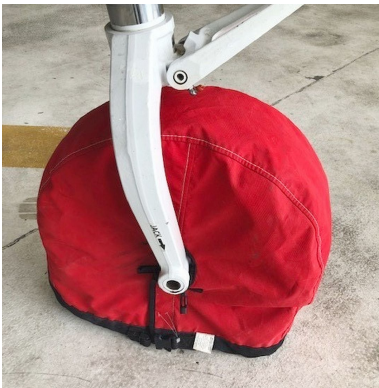
Beech King Air 300 Tire Covers (nose gear)

ALL-YEAR USE MATERIAL - Made with Silver Acrylic Sunbrella canvas, the all-year use material is the best option for sun protection and cover longevity. This heavier more durable material is intended for all weather conditions, such as rain and snow or lots of sun.