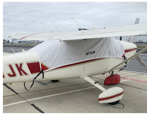
Cessna 182 Skylane Canopy, Prop & Nose Wheelpant Covers