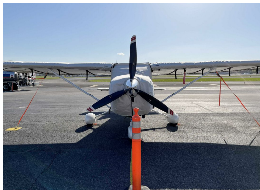
Cessna T182T Hail Protection Covers