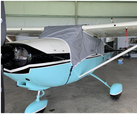
Cessna 182A Wrap Around Travel Cover