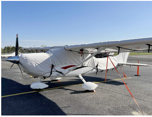
Cessna T182T Hail Protection Covers