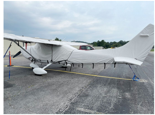
Cessna 182 Hail Protection Cover Set