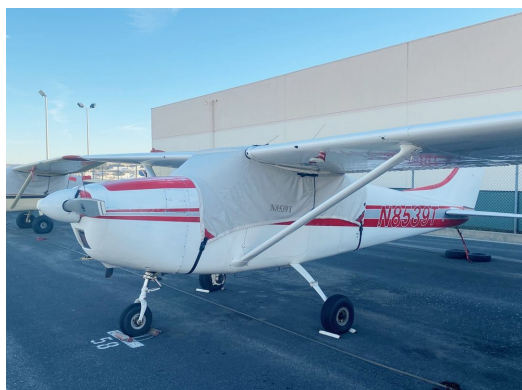
Cessna 182C Canopy Cover, Wrap-Around Type