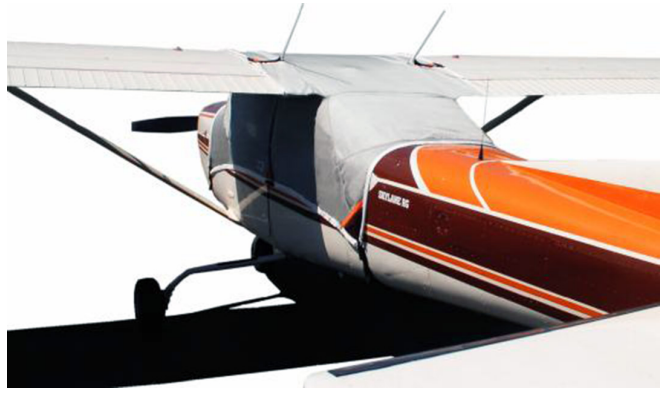
Cessna 182 Over-the-Top Canopy Cover