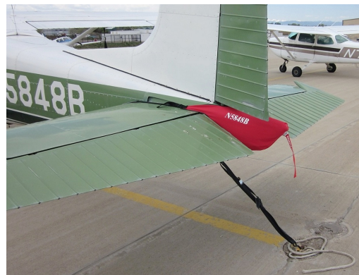
Cessna 182 Tailcone Cover