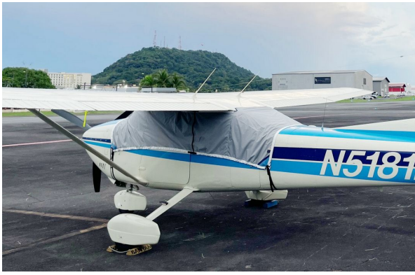
Cessna 182 Travel Canopy Cover