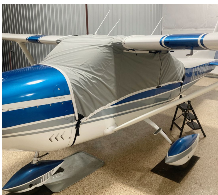
Cessna 182J Travel Weight Canopy Cover