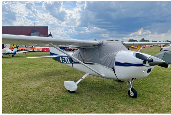
182 Skylane Travel Cover, (over-top style), Light Weight Travel Canopy Cover