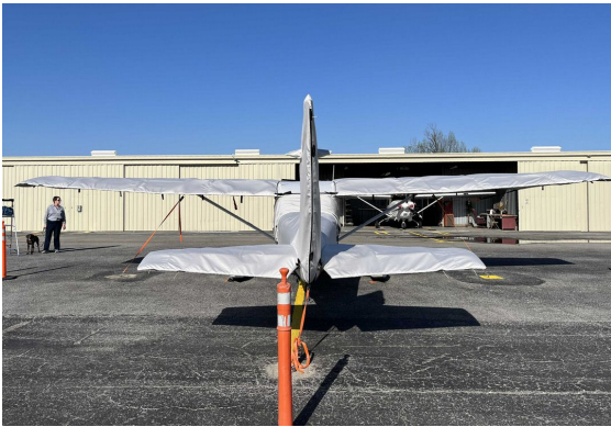
Cessna T182T Hail Protection Covers

This cover type is made from Silver Acrylic Sunbrella canvas and is 100% lined with a soft and smooth microfiber. Bruce's Custom Covers developed this material combination especially for aircraft protection. The outer material is medium weight and treated for water resistance, UV resistance and anti-static buildup. The inner lining is a very soft and smooth microfiber to prevent scratching. The material is very reflective, and tests show that the cabin interior temperature can be reduced to near-ambient temperature on the hottest of days. It is water, ice and snow repellent, yet breathable to allow moisture to escape from between the cover and the aircraft surface.