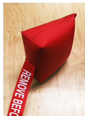
Cessna 182 Plug for third inlet below spinner (Induction Inlet)