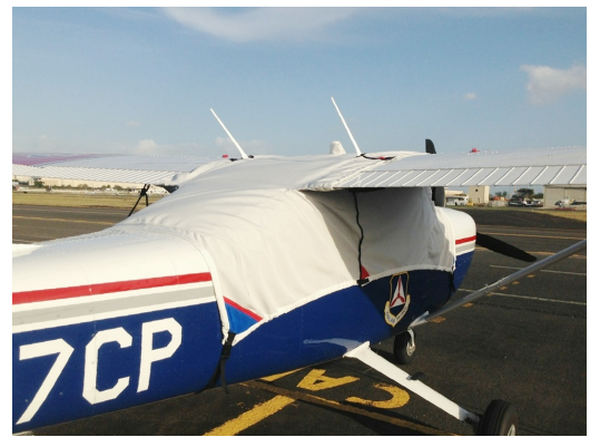
Cessna 182 Over-Top Canopy Cover