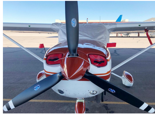
Cessna 182 (T182) Engine Plugs, Over-Top Extended Canopy Cover