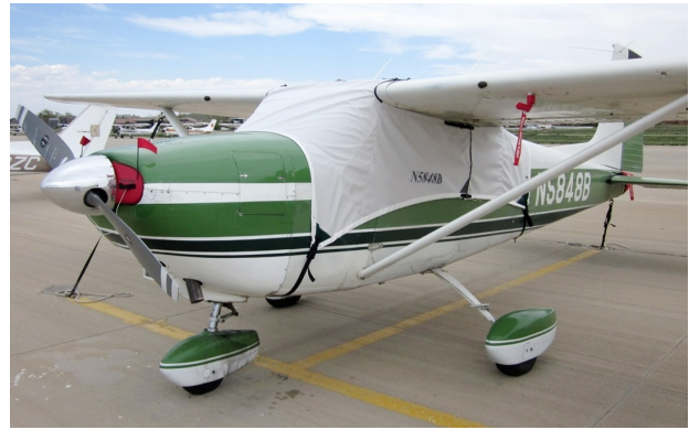
Cessna 182 Canopy Cover, Inlet Plugs