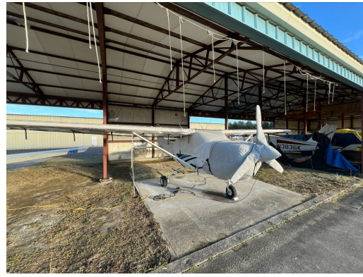
Cessna R182 Canopy, Engine, Wings, Empennage Covers