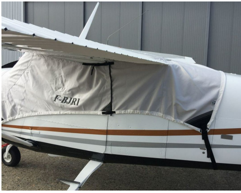
1961 Cessna 182 Wrap-Around Canopy Cover