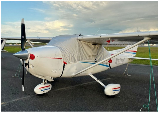
Cessna 182P Wrap Around Canopy Cover