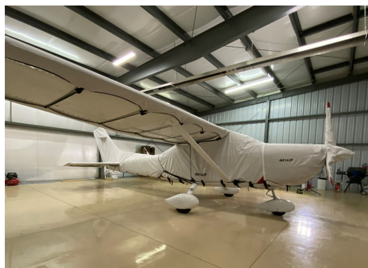
182 Skylane T182T Wing Covers