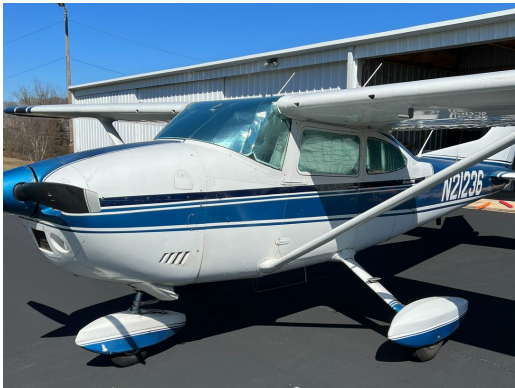
Cessna 182 Cockpit HeatShield Set