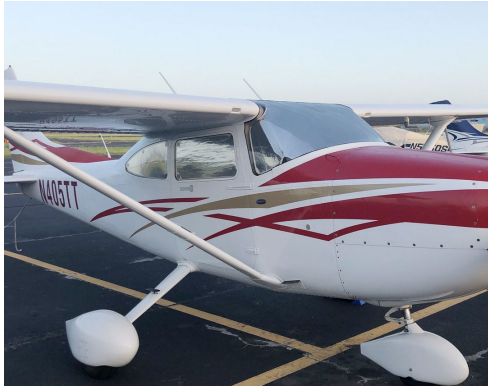
Cessna 182 Cabin HeatShields

Windshield Heatshields are interior sunshades for an aircraft's front windshield. The product is a unique composite of closed-cell foam with a silver mylar finish. The semi-rigid design is stiff enough to stand along the inside of the windshield using sun visors or window framing. It folds up flat and easily stores in the included storage sleeve. Some designs may require velcro and suction cups or split right and left sides. A Heatshield is an excellent short-term remedy for cockpit overheating. An external fabric cover is far more effective and practical for long-term protection.