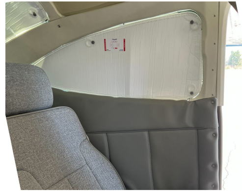
Cessna 182 Cockpit HeatShield Set