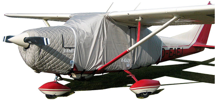
Cessna 182 Insulated Engine Cover ext. to l.e of nose gear, Extended Canopy Cover