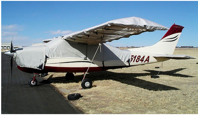
Wing Covers on Cessna 210