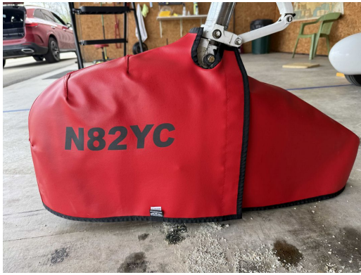
Cessna 182T Nose Wheelpant Cover