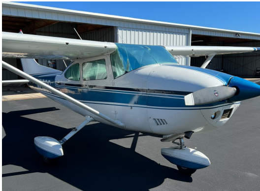
Cessna 182 Cockpit HeatShield Set

Windshield Heatshields are interior sunshades for an aircraft's front windshield. The product is a unique composite of closed-cell foam with a silver mylar finish. The semi-rigid design is stiff enough to stand along the inside of the windshield using sun visors or window framing. It folds up flat and easily stores in the included storage sleeve. Some designs may require velcro and suction cups or split right and left sides. A Heatshield is an excellent short-term remedy for cockpit overheating. An external fabric cover is far more effective and practical for long-term protection.