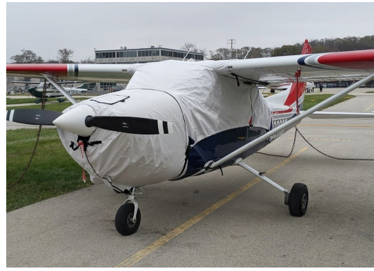
Cessna 182 Over-Top Canopy Cover, and Fully Enclosed Engine Cover