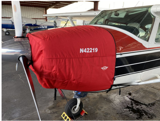
Cessna 182L Insulated Engine Cover

This cover type is made from Silver Acrylic Sunbrella canvas and is 100% lined with a soft and smooth microfiber. Bruce's Custom Covers developed this material combination especially for aircraft protection. The outer material is medium weight and treated for water resistance, UV resistance and anti-static buildup. The inner lining is a very soft and smooth microfiber to prevent scratching. The material is very reflective, and tests show that the cabin interior temperature can be reduced to near-ambient temperature on the hottest of days. It is water, ice and snow repellent, yet breathable to allow moisture to escape from between the cover and the aircraft surface.