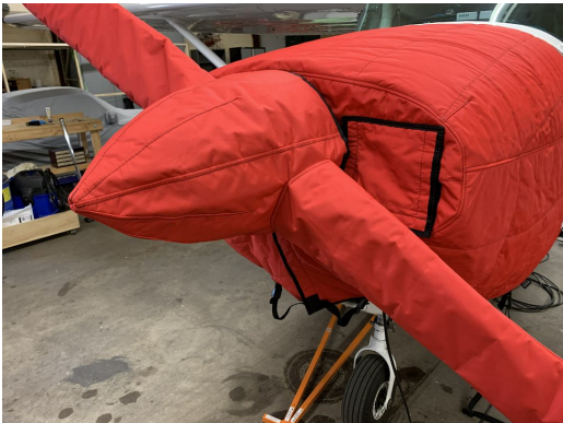
Cessna 182A Insulated Engine & Prop Covers