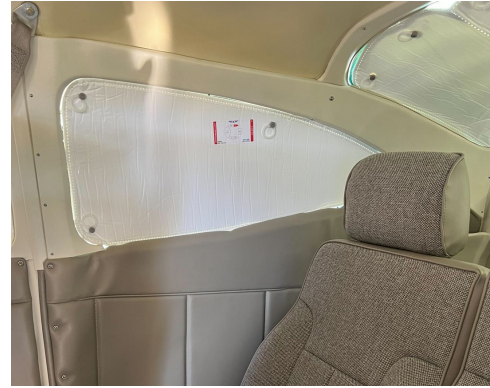
Cessna 182 Cockpit HeatShield Set