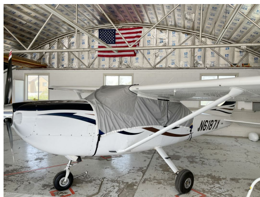
Cessna T182T Wrap Around Travel Cover