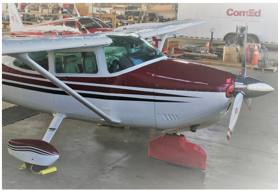
Cessna 182 Skylane Nose Wheelpant Cover