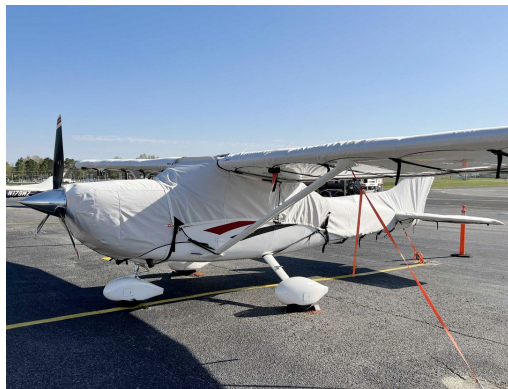
Cessna T182T Hail Protection Covers

This cover type is made from Silver Acrylic Sunbrella canvas and is 100% lined with a soft and smooth microfiber. Bruce's Custom Covers developed this material combination especially for aircraft protection. The outer material is medium weight and treated for water resistance, UV resistance and anti-static buildup. The inner lining is a very soft and smooth microfiber to prevent scratching. The material is very reflective, and tests show that the cabin interior temperature can be reduced to near-ambient temperature on the hottest of days. It is water, ice and snow repellent, yet breathable to allow moisture to escape from between the cover and the aircraft surface.