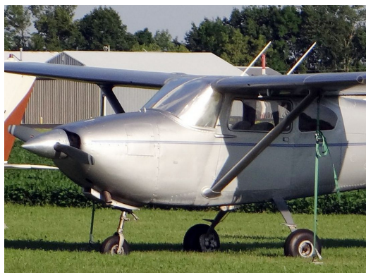
Cessna 182 Windshield HeatShield

Windshield Heatshields are interior sunshades for an aircraft's front windshield. The product is a unique composite of closed-cell foam with a silver mylar finish. The semi-rigid design is stiff enough to stand along the inside of the windshield using sun visors or window framing. It folds up flat and easily stores in the included storage sleeve. Some designs may require velcro and suction cups or split right and left sides. A Heatshield is an excellent short-term remedy for cockpit overheating. An external fabric cover is far more effective and practical for long-term protection.