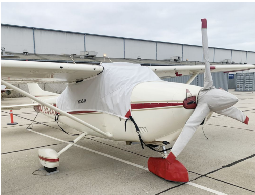
Cessna 182 Skylane Canopy, Prop & Nose Wheelpant Covers

This cover type is made from Silver Acrylic Sunbrella canvas and is 100% lined with a soft and smooth microfiber. Bruce's Custom Covers developed this material combination especially for aircraft protection. The outer material is medium weight and treated for water resistance, UV resistance and anti-static buildup. The inner lining is a very soft and smooth microfiber to prevent scratching. The material is very reflective, and tests show that the cabin interior temperature can be reduced to near-ambient temperature on the hottest of days. It is water, ice and snow repellent, yet breathable to allow moisture to escape from between the cover and the aircraft surface.