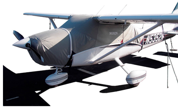
Cessna 182 Over-the-Top Canopy Cover and Engine Cover