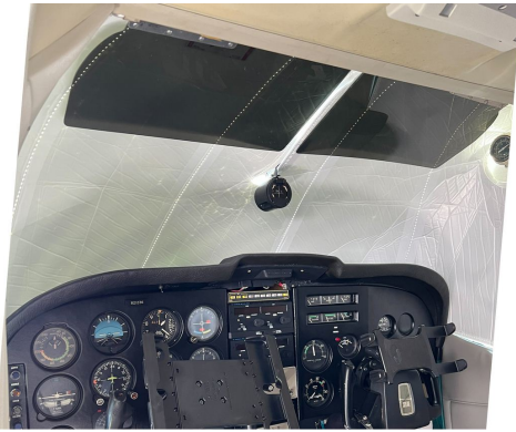
Cessna 182 Cockpit HeatShield Set

Windshield Heatshields are interior sunshades for an aircraft's front windshield. The product is a unique composite of closed-cell foam with a silver mylar finish. The semi-rigid design is stiff enough to stand along the inside of the windshield using sun visors or window framing. It folds up flat and easily stores in the included storage sleeve. Some designs may require velcro and suction cups or split right and left sides. A Heatshield is an excellent short-term remedy for cockpit overheating. An external fabric cover is far more effective and practical for long-term protection.