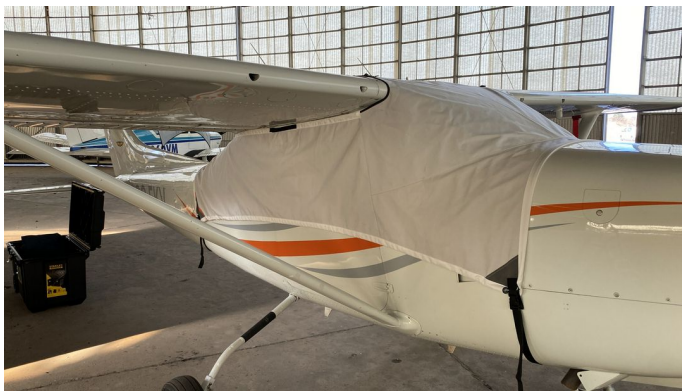
R182 Skylane Canopy cover, wrap-around