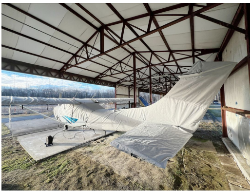
Cessna R182 Canopy, Engine, Wings, Empennage Covers