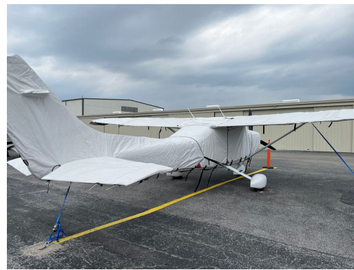
Cessna 182 Hail Protection Cover Set