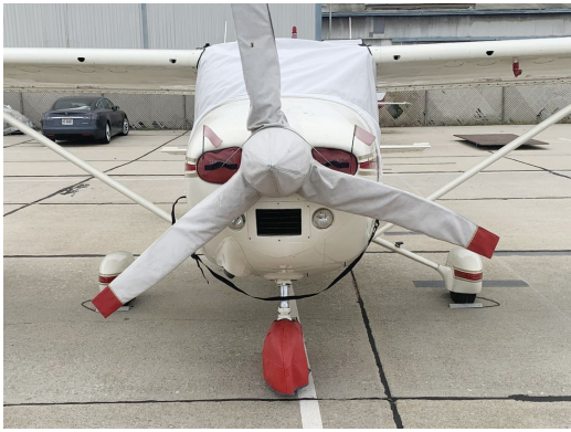
Cessna 182 Skylane Canopy, Prop & Nose Wheelpant Covers