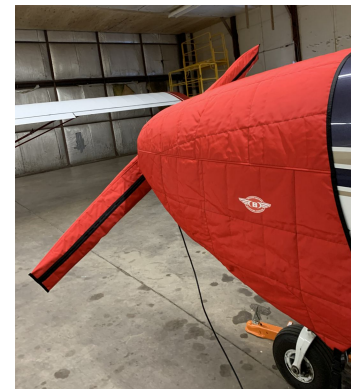
Cessna 182A Insulated Engine & Prop Covers