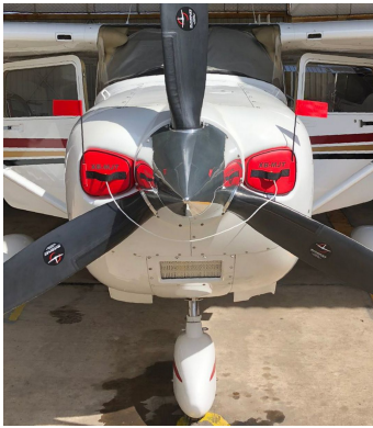
Cessna 182 Skylane Engine Inlet Plugs

Engine Inlet Plugs are custom fit for your Cessna 182 Skylane intakes, made with heavy-duty vinyl material, and stuffed with a single block of sculpted urethane foam. Each plug has a zipper that allows the foam to be removed and dried if necessary. Engine plugs have warning flags that are visible from the cockpit or 'remove before flight' streamers sewn onto the face of the plugs. Most plugs are imprinted with the aircraft registration number in black for an extra charge. Storage bag NOT included. Engine plugs may be inserted after flight when the engine is still warm. Engine Inlet Plugs are commonly referred to as Cowl Plugs, Intake Plugs, Cowl Blocks, Engine Blocks, and Engine Bungs.