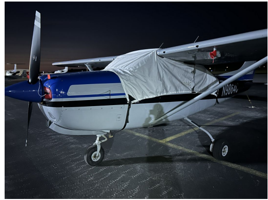
Cessna R182 Canopy Cover & Engine Plugs