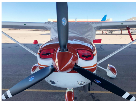
Cessna 182 (T182) Engine Plugs, Over-Top Extended Canopy Cover

Engine Inlet Plugs are custom fit for your Cessna 182 Skylane intakes, made with heavy-duty vinyl material, and stuffed with a single block of sculpted urethane foam. Each plug has a zipper that allows the foam to be removed and dried if necessary. Engine plugs have warning flags that are visible from the cockpit or 'remove before flight' streamers sewn onto the face of the plugs. Most plugs are imprinted with the aircraft registration number in black for an extra charge. Storage bag NOT included. Engine plugs may be inserted after flight when the engine is still warm. Engine Inlet Plugs are commonly referred to as Cowl Plugs, Intake Plugs, Cowl Blocks, Engine Blocks, and Engine Bungs.