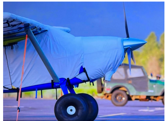
Cessna 185 Canopy, Wing & Engine Covers