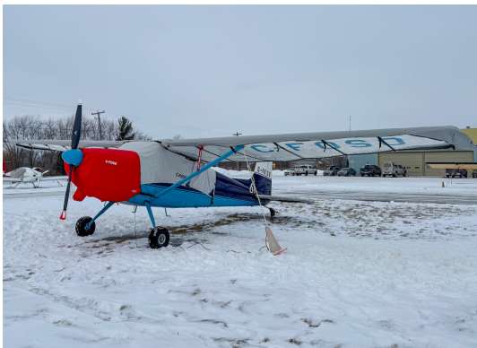
Cessna 180E Winter Cover Set

This cover type is made from Silver Acrylic Sunbrella canvas and is 100% lined with a soft and smooth microfiber. Bruce's Custom Covers developed this material combination especially for aircraft protection. The outer material is medium weight and treated for water resistance, UV resistance and anti-static buildup. The inner lining is a very soft and smooth microfiber to prevent scratching. The material is very reflective, and tests show that the cabin interior temperature can be reduced to near-ambient temperature on the hottest of days. It is water, ice and snow repellent, yet breathable to allow moisture to escape from between the cover and the aircraft surface.