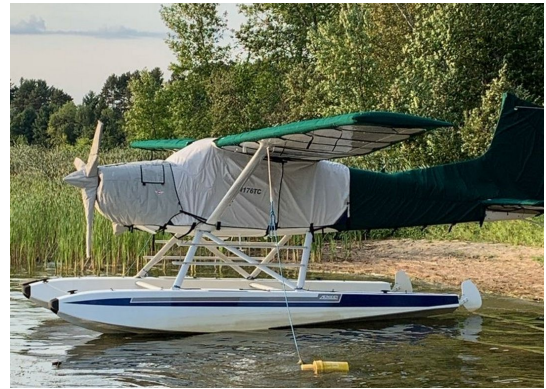
Cessna A185F Complete Cover Set