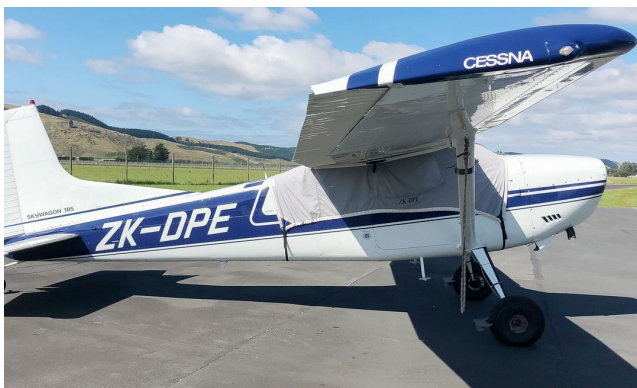
Cessna 185 Light Weight Travel Canopy Cover

This cover type is made from Silver Acrylic Sunbrella canvas and is 100% lined with a soft and smooth microfiber. Bruce's Custom Covers developed this material combination especially for aircraft protection. The outer material is medium weight and treated for water resistance, UV resistance and anti-static buildup. The inner lining is a very soft and smooth microfiber to prevent scratching. The material is very reflective, and tests show that the cabin interior temperature can be reduced to near-ambient temperature on the hottest of days. It is water, ice and snow repellent, yet breathable to allow moisture to escape from between the cover and the aircraft surface.