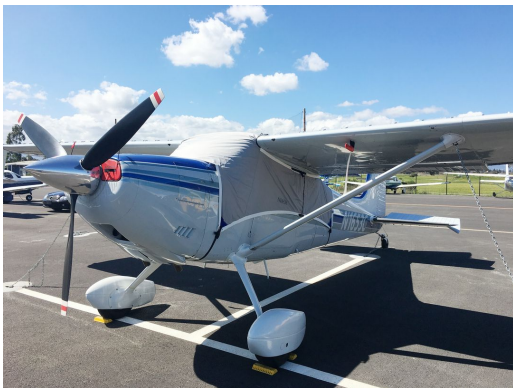
Cessna 180 Travel Weight Canopy Cover, Engine Plugs

This cover type is made from Silver Acrylic Sunbrella canvas and is 100% lined with a soft and smooth microfiber. Bruce's Custom Covers developed this material combination especially for aircraft protection. The outer material is medium weight and treated for water resistance, UV resistance and anti-static buildup. The inner lining is a very soft and smooth microfiber to prevent scratching. The material is very reflective, and tests show that the cabin interior temperature can be reduced to near-ambient temperature on the hottest of days. It is water, ice and snow repellent, yet breathable to allow moisture to escape from between the cover and the aircraft surface.