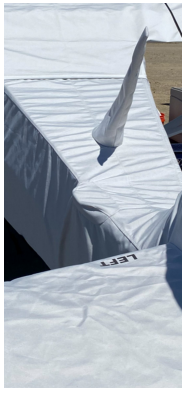
Kitfox Full Cover Set