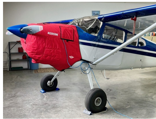
Cessna 180K Insulated Engine Cover, Fully Enclosed