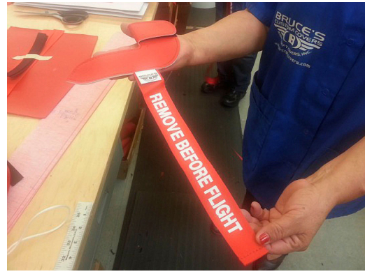
Cessna 150 Pitot Cover