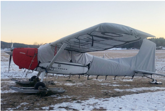
Cessna A185E Winter Cover Set

WINTER USE MATERIAL - Made with Solution-Dyed Polyester fabric, this option is intended for seasonal use to aid in deicing, rain mitigation, or for occasional travel. The material is lighter and more compact, but more susceptible to UV damage and may have a shorter useful life if used continuously outside than the all-year use material.