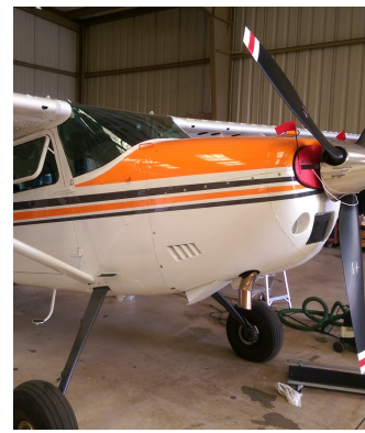
Cessna 180/185 Engine Plugs