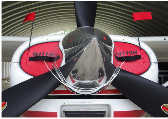
Cessna 180G Engine Inlet Plugs