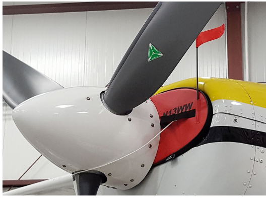
Cessna 180/185 Skywagon Engine Inlet Plugs