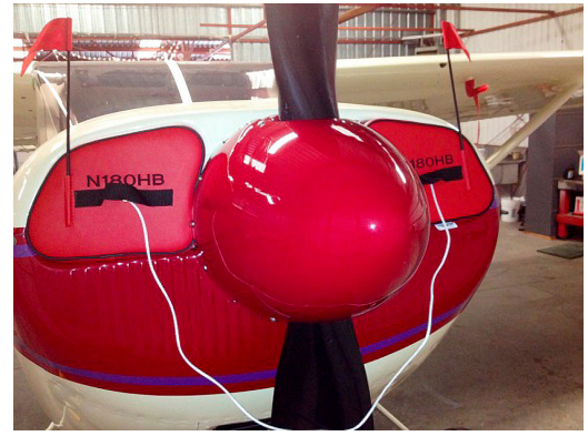
Cessna 180 Engine Plugs, Pitot Cover