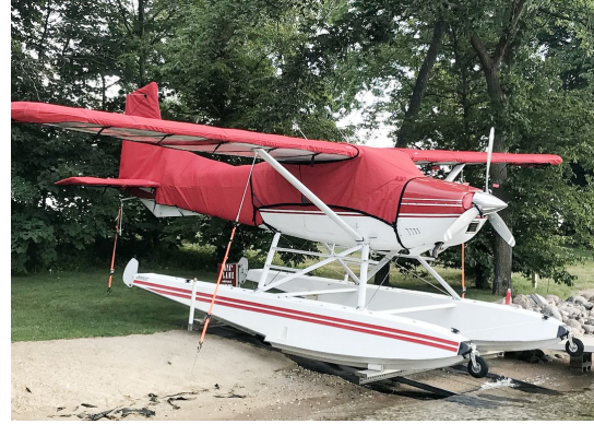
Cessna 185 Canopy, Wings & Empennage Covers, and Engine Plugs