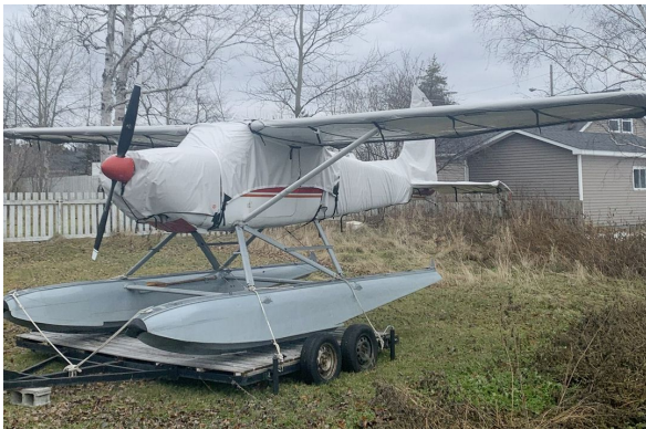
Cessna 180A Canopy, Engine, Wing & Empennage Covers

WINTER USE MATERIAL - Made with Solution-Dyed Polyester fabric, this option is intended for seasonal use to aid in deicing, rain mitigation, or for occasional travel. The material is lighter and more compact, but more susceptible to UV damage and may have a shorter useful life if used continuously outside than the all-year use material.