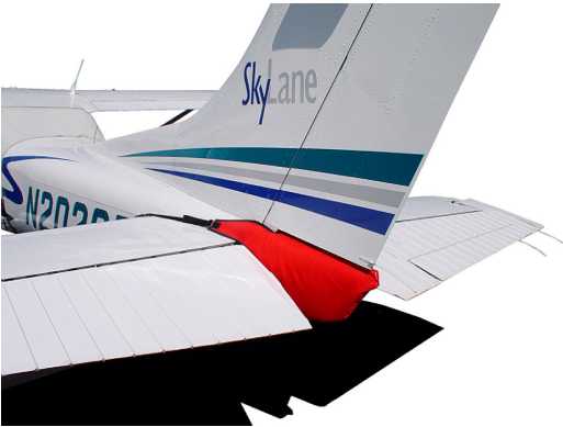
Cessna 182 Tailcone Cover

WINTER USE MATERIAL - Made with Solution-Dyed Polyester fabric, this option is intended for seasonal use to aid in deicing, rain mitigation, or for occasional travel. The material is lighter and more compact, but more susceptible to UV damage and may have a shorter useful life if used continuously outside than the all-year use material.