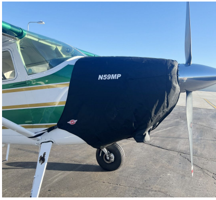
Cessna 180B Insulated Engine Cover, Fully Enclosed