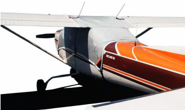
Cessna 182 Over-the-Top Canopy Cover

This cover type is made from Silver Acrylic Sunbrella canvas and is 100% lined with a soft and smooth microfiber. Bruce's Custom Covers developed this material combination especially for aircraft protection. The outer material is medium weight and treated for water resistance, UV resistance and anti-static buildup. The inner lining is a very soft and smooth microfiber to prevent scratching. The material is very reflective, and tests show that the cabin interior temperature can be reduced to near-ambient temperature on the hottest of days. It is water, ice and snow repellent, yet breathable to allow moisture to escape from between the cover and the aircraft surface.