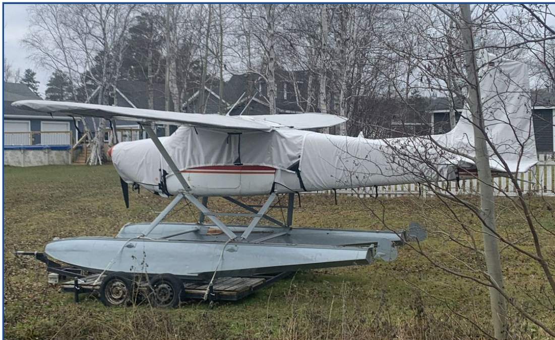
Cessna 180A Canopy, Engine, Wing &amp; Empennage Covers