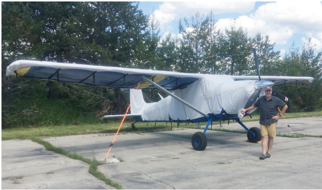
Cessna 180 Complete Hail Protection Cover Set

WINTER USE MATERIAL - Made with Solution-Dyed Polyester fabric, this option is intended for seasonal use to aid in deicing, rain mitigation, or for occasional travel. The material is lighter and more compact, but more susceptible to UV damage and may have a shorter useful life if used continuously outside than the all-year use material.