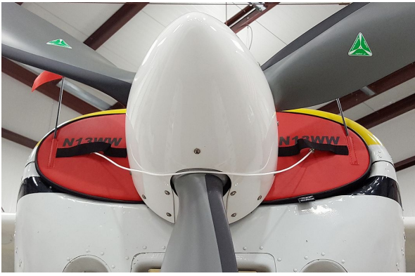
Cessna 185F Engine Plugs