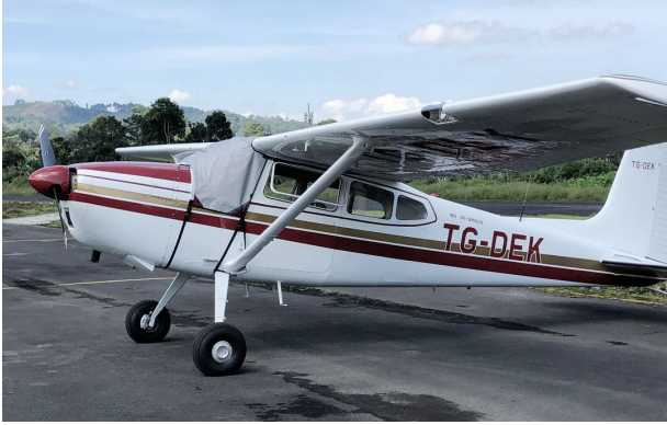
Cessna 180 Windshield Cover

The material is very reflective, and tests show that the cabin interior temperature can be reduced to near-ambient temperature on the hottest of days. It is water, ice and snow repellent, yet breathable to allow moisture to escape from between the cover and the aircraft surface.