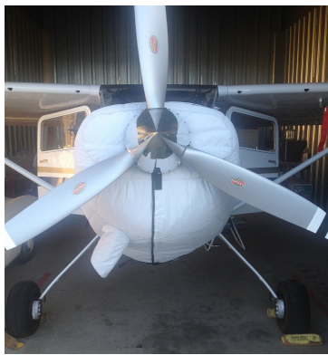
Cessna 180 Insulated Engine Cover