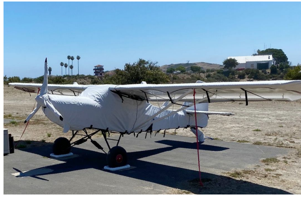
Kitfox Full Cover Set