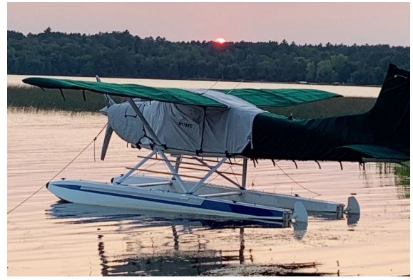
Cessna A185F Complete Cover Set