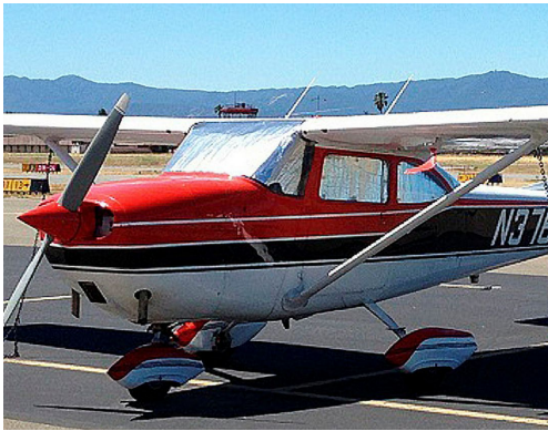
Cessna 172 Cabin HeatShields

Windshield Heatshields are interior sunshades for an aircraft's front windshield. The product is a unique composite of closed-cell foam with a silver mylar finish. The semi-rigid design is stiff enough to stand along the inside of the windshield using sun visors or window framing. It folds up flat and easily stores in the included storage sleeve. Some designs may require velcro and suction cups or split right and left sides. A Heatshield is an excellent short-term remedy for cockpit overheating. An external fabric cover is far more effective and practical for long-term protection.