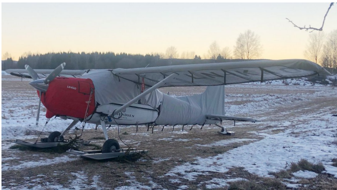
Cessna A185E Winter Cover Set

This cover type is made from Silver Acrylic Sunbrella canvas and is 100% lined with a soft and smooth microfiber. Bruce's Custom Covers developed this material combination especially for aircraft protection. The outer material is medium weight and treated for water resistance, UV resistance and anti-static buildup. The inner lining is a very soft and smooth microfiber to prevent scratching. The material is very reflective, and tests show that the cabin interior temperature can be reduced to near-ambient temperature on the hottest of days. It is water, ice and snow repellent, yet breathable to allow moisture to escape from between the cover and the aircraft surface.