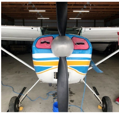
Cessna 180 Engine Plugs