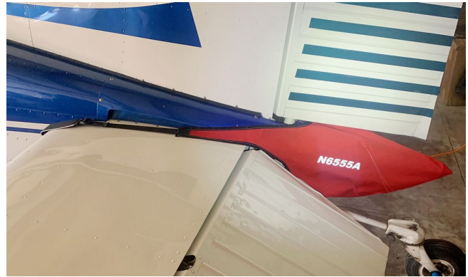
Cessna 180 Skywagon Tailcone Cover