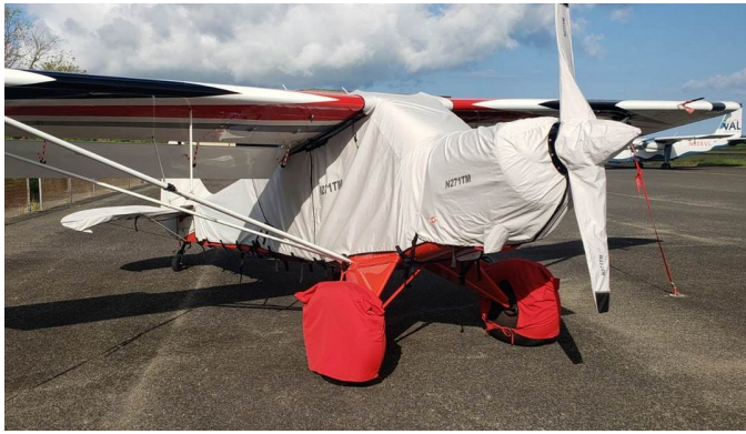
Aviat Husky Extended Canopy Cover, Engine, Prop, Empennage & Tire Covers