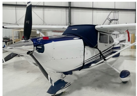
Cessna 182 Windshield Cover, Engine Plugs