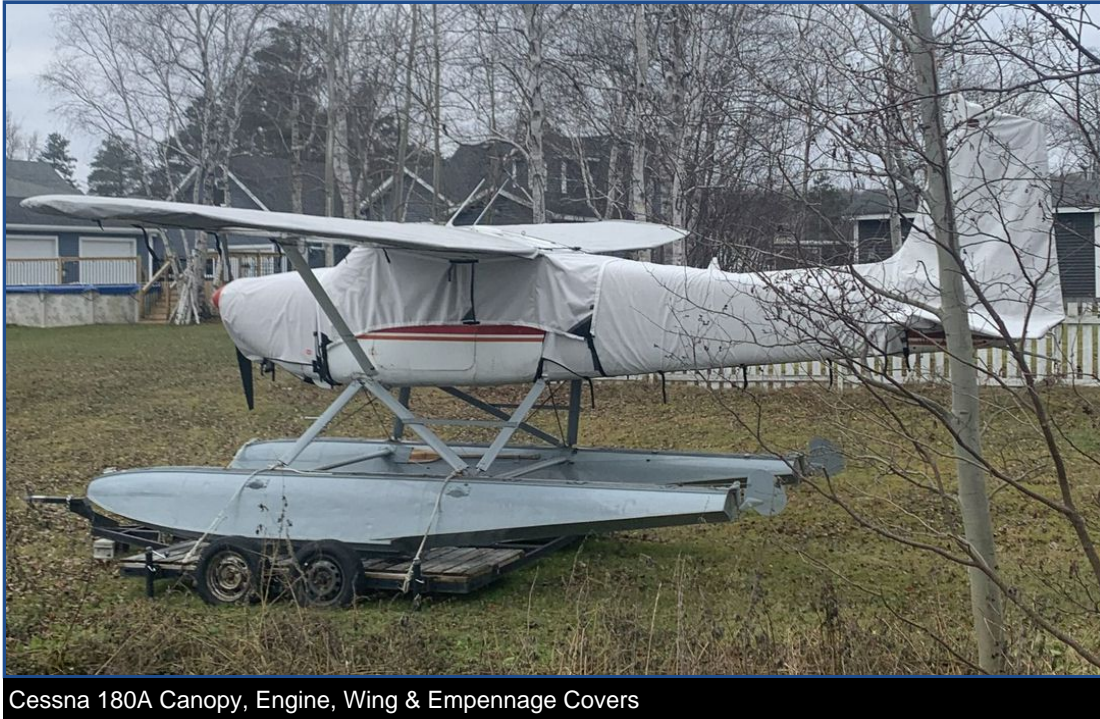
Cessna 180A Canopy, Engine, Wing &amp; Empennage Covers