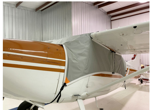
Cessna 180 Travel Weight Canopy Cover