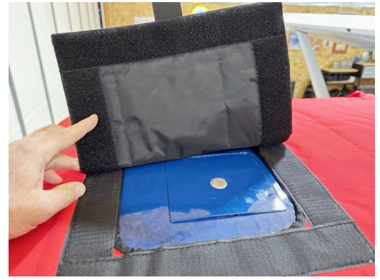
Cessna 180H Insulated Engine Cover