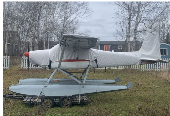
Cessna 180A Canopy, Engine, Wing & Empennage Covers