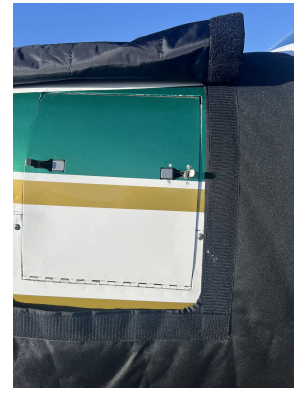
Cessna 180B Insulated Engine Cover, Fully Enclosed