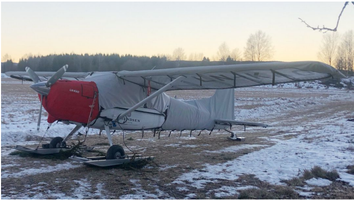
Cessna A185E Winter Cover Set