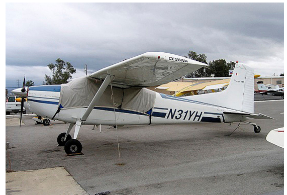
Cessna 185 Standard Canopy Cover