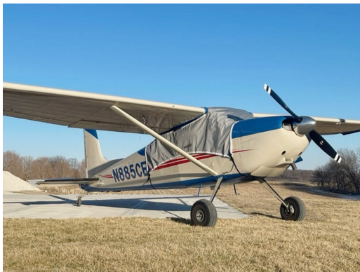
Cessna 180 Travel Weight Canopy Cover

This cover type is made from Silver Acrylic Sunbrella canvas and is 100% lined with a soft and smooth microfiber. Bruce's Custom Covers developed this material combination especially for aircraft protection. The outer material is medium weight and treated for water resistance, UV resistance and anti-static buildup. The inner lining is a very soft and smooth microfiber to prevent scratching. The material is very reflective, and tests show that the cabin interior temperature can be reduced to near-ambient temperature on the hottest of days. It is water, ice and snow repellent, yet breathable to allow moisture to escape from between the cover and the aircraft surface.