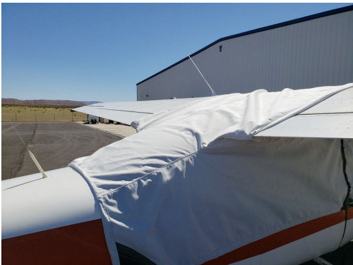
Cessna 177 Cardinal Over-Top Canopy Cover