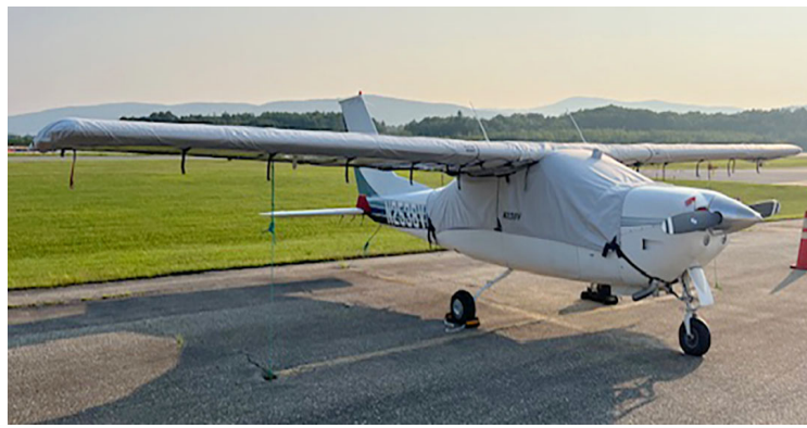
Cessna 177 Cardinal Over-Top Canopy Cover, extends to cover gas caps, & Wing Covers