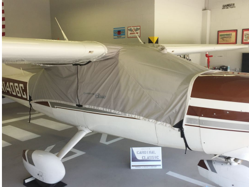
Cessna 177 Cardinal Travel Cover, Light Weight Travel Canopy Cover (Over-The-Top Style), 7 Lbs

Travel Covers are made with Silver Solution-Dyed Polyester fabric and only lined over the windshield to save weight. The material is lightweight and more compact for easy stowage in the aircraft. The polyester material is water resistant, but only intended for occasional use outside. We also have an ultra lightweight material available for fitted hangar dust covers. For daily outdoor use, the non-travel Sunbrella Cover is the best choice.