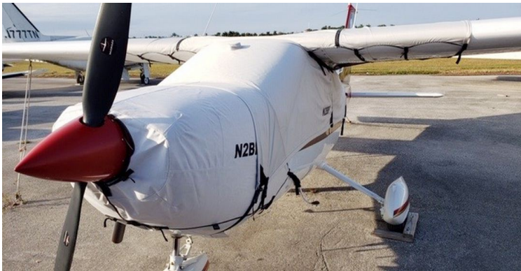
Cessna Cardinal 177 Engine Cover & Over-Top Canopy Cover with Wing Extensions

This cover type is made from Silver Acrylic Sunbrella canvas and is 100% lined with a soft and smooth microfiber. Bruce's Custom Covers developed this material combination especially for aircraft protection. The outer material is medium weight and treated for water resistance, UV resistance and anti-static buildup. The inner lining is a very soft and smooth microfiber to prevent scratching. The material is very reflective, and tests show that the cabin interior temperature can be reduced to near-ambient temperature on the hottest of days. It is water, ice and snow repellent, yet breathable to allow moisture to escape from between the cover and the aircraft surface.