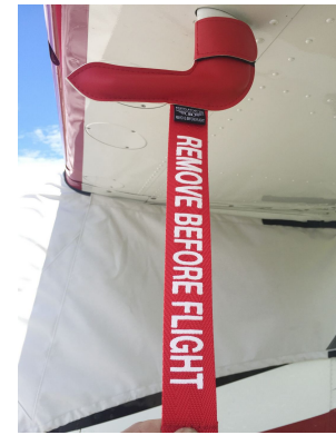
Cessna A185F Pitot Cover