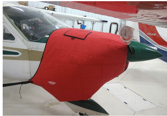
Cessna 177 Cardinal Insulated Engine Cover, Powerflow Exhaust