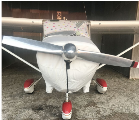
Cessna 175 Fully Enclosed Engine Cover

This cover type is made from Silver Acrylic Sunbrella canvas and is 100% lined with a soft and smooth microfiber. Bruce's Custom Covers developed this material combination especially for aircraft protection. The outer material is medium weight and treated for water resistance, UV resistance and anti-static buildup. The inner lining is a very soft and smooth microfiber to prevent scratching. The material is very reflective, and tests show that the cabin interior temperature can be reduced to near-ambient temperature on the hottest of days. It is water, ice and snow repellent, yet breathable to allow moisture to escape from between the cover and the aircraft surface.