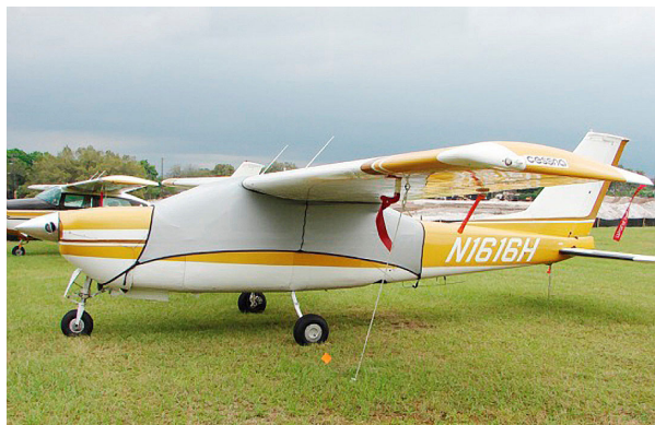
Cessna Cardinal Spandex FlyAway Cover

Travel Covers are made with Silver Solution-Dyed Polyester fabric and only lined over the windshield to save weight. The material is lightweight and more compact for easy stowage in the aircraft. The polyester material is water resistant, but only intended for occasional use outside. We also have an ultra lightweight material available for fitted hangar dust covers. For daily outdoor use, the non-travel Sunbrella Cover is the best choice.