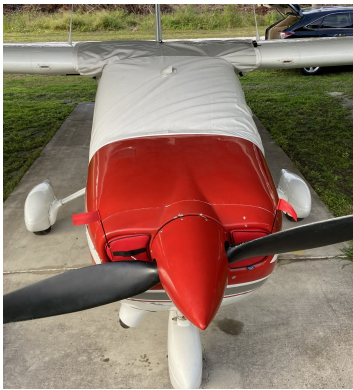
Cessna 177B Cardinal Engine Inlet Plugs

Engine Inlet Plugs are custom fit for your Cessna 177 Cardinal intakes, made with heavy-duty vinyl material, and stuffed with a single block of sculpted urethane foam. Each plug has a zipper that allows the foam to be removed and dried if necessary. Engine plugs have warning flags that are visible from the cockpit or 'remove before flight' streamers sewn onto the face of the plugs. Most plugs are imprinted with the aircraft registration number in black for an extra charge. Storage bag NOT included. Engine plugs may be inserted after flight when the engine is still warm. Engine Inlet Plugs are commonly referred to as Cowl Plugs, Intake Plugs, Cowl Blocks, Engine Blocks, and Engine Bungs.