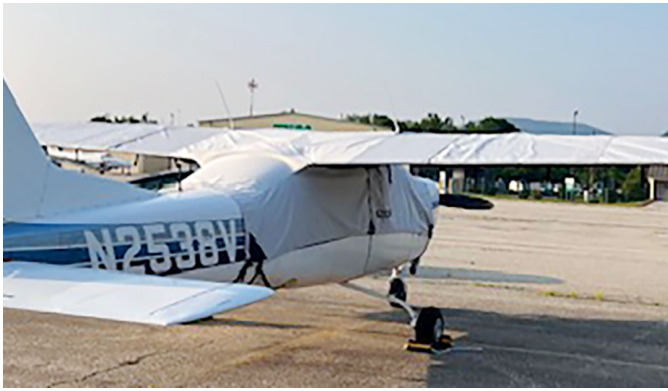
Cessna 177 Cardinal Over-Top Canopy Cover, extends to cover gas caps, & Wing Covers