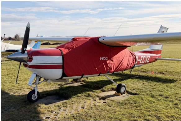
Cessna 177 Cardinal Extended Canopy Cover, Over Top Type

This cover type is made from Silver Acrylic Sunbrella canvas and is 100% lined with a soft and smooth microfiber. Bruce's Custom Covers developed this material combination especially for aircraft protection. The outer material is medium weight and treated for water resistance, UV resistance and anti-static buildup. The inner lining is a very soft and smooth microfiber to prevent scratching. The material is very reflective, and tests show that the cabin interior temperature can be reduced to near-ambient temperature on the hottest of days. It is water, ice and snow repellent, yet breathable to allow moisture to escape from between the cover and the aircraft surface.