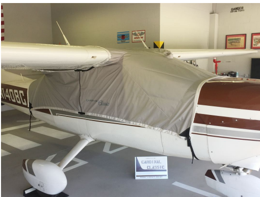
Cessna 177 Cardinal Travel Cover, Light Weight Travel Canopy Cover (Over-The-Top Style), 7 Lbs