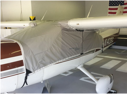
Cessna 177 Cardinal Travel Cover, Light Weight Travel Canopy Cover (Over-The-Top Style), 7 Lbs

Travel Covers are made with Silver Solution-Dyed Polyester fabric and only lined over the windshield to save weight. The material is lightweight and more compact for easy stowage in the aircraft. The polyester material is water resistant, but only intended for occasional use outside. We also have an ultra lightweight material available for fitted hangar dust covers. For daily outdoor use, the non-travel Sunbrella Cover is the best choice.