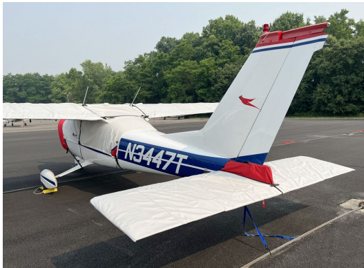
Cessna 177 Cardinal Cover Set

shorter useful life if used continuously outside than the all-year use material.