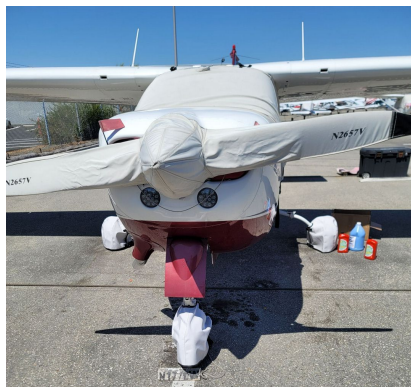
Cessna 177RG Tire & Prop Covers

ALL-YEAR USE MATERIAL - Made with Silver Acrylic Sunbrella canvas, the all-year use material is the best option for sun protection and cover longevity. This heavier more durable material is intended for all weather conditions, such as rain and snow or lots of sun.