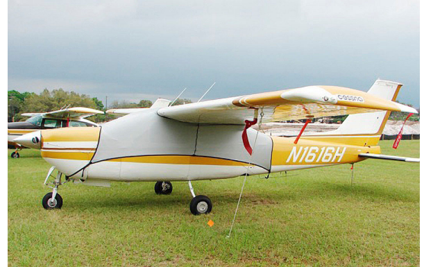
Cessna Cardinal Spandex FlyAway Cover