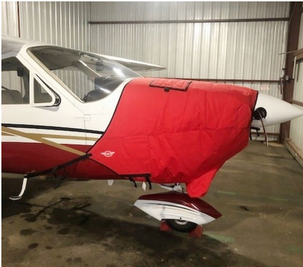
Cessna 177 Cardinal Insulated Engine Cover

This cover type is made from Silver Acrylic Sunbrella canvas and is 100% lined with a soft and smooth microfiber. Bruce's Custom Covers developed this material combination especially for aircraft protection. The outer material is medium weight and treated for water resistance, UV resistance and anti-static buildup. The inner lining is a very soft and smooth microfiber to prevent scratching. The material is very reflective, and tests show that the cabin interior temperature can be reduced to near-ambient temperature on the hottest of days. It is water, ice and snow repellent, yet breathable to allow moisture to escape from between the cover and the aircraft surface.