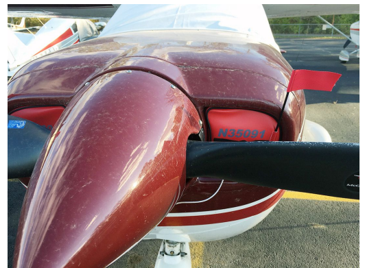
Cessna 177 Cardinal Engine Inlet Plugs (1972-78)