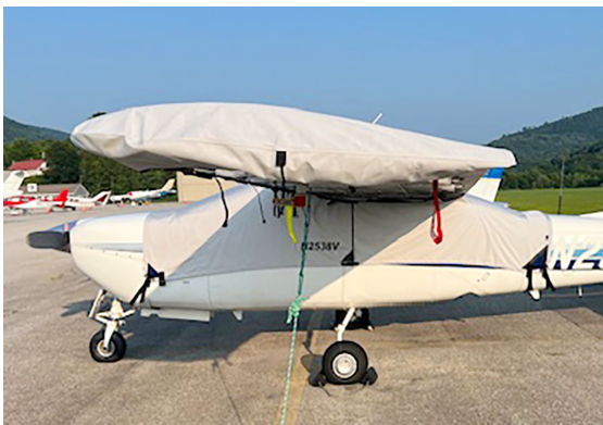
Cessna 177 Cardinal Over-Top Canopy Cover, extends to cover gas caps, & Wing Covers

This cover type is made from Silver Acrylic Sunbrella canvas and is 100% lined with a soft and smooth microfiber. Bruce's Custom Covers developed this material combination especially for aircraft protection. The outer material is medium weight and treated for water resistance, UV resistance and anti-static buildup. The inner lining is a very soft and smooth microfiber to prevent scratching. The material is very reflective, and tests show that the cabin interior temperature can be reduced to near-ambient temperature on the hottest of days. It is water, ice and snow repellent, yet breathable to allow moisture to escape from between the cover and the aircraft surface.