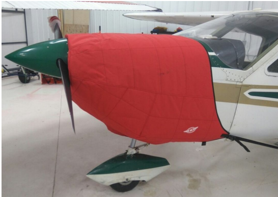
Cessna 177 Cardinal Insulated Engine Cover, Powerflow Exhaust