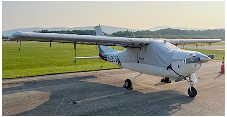
Cessna 177 Cardinal Over-Top Canopy Cover, extends to cover gas caps, & Wing Covers