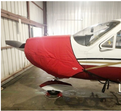
Cessna 177 Cardinal Insulated Engine Cover

This cover type is made from Silver Acrylic Sunbrella canvas and is 100% lined with a soft and smooth microfiber. Bruce's Custom Covers developed this material combination especially for aircraft protection. The outer material is medium weight and treated for water resistance, UV resistance and anti-static buildup. The inner lining is a very soft and smooth microfiber to prevent scratching. The material is very reflective, and tests show that the cabin interior temperature can be reduced to near-ambient temperature on the hottest of days. It is water, ice and snow repellent, yet breathable to allow moisture to escape from between the cover and the aircraft surface.