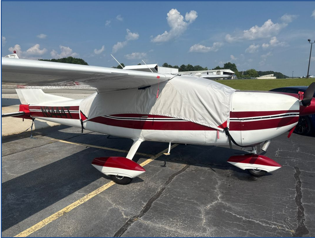
Cessna 177 Canopy Cover, Wrap-Around