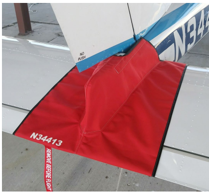
Cessna Cardinal Tailcone Cover