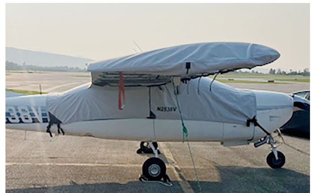
Cessna 177 Cardinal Over-Top Canopy Cover, extends to cover gas caps, & Wing Covers