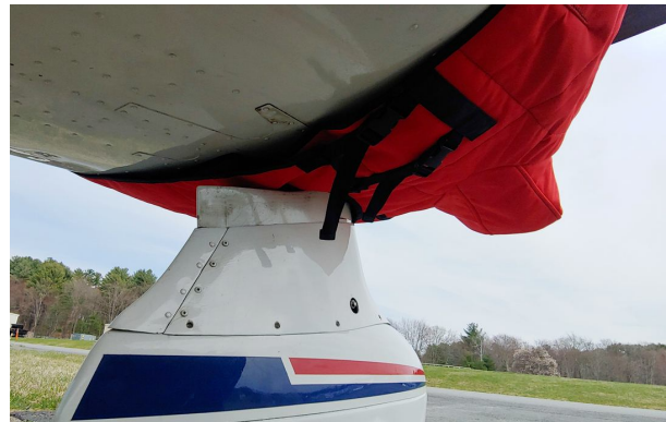
Cessna 177B Insulated Engine Cover