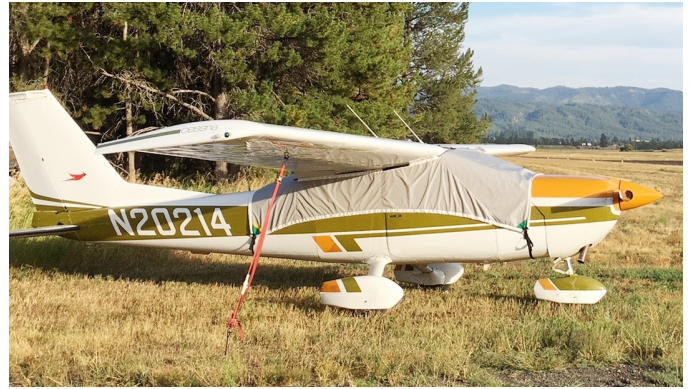
Cessna 177 Cardinal Travel Cover, Light Weight Travel Canopy Cover (Wrap Around), 6 Lbs