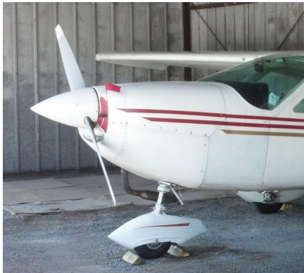
Cessna Cardinal Engine Plugs

Engine Inlet Plugs are custom fit for your Cessna 177 Cardinal intakes, made with heavy-duty vinyl material, and stuffed with a single block of sculpted urethane foam. Each plug has a zipper that allows the foam to be removed and dried if necessary. Engine plugs have warning flags that are visible from the cockpit or 'remove before flight' streamers sewn onto the face of the plugs. Most plugs are imprinted with the aircraft registration number in black for an extra charge. Storage bag NOT included. Engine plugs may be inserted after flight when the engine is still warm. Engine Inlet Plugs are commonly referred to as Cowl Plugs, Intake Plugs, Cowl Blocks, Engine Blocks, and Engine Bungs.