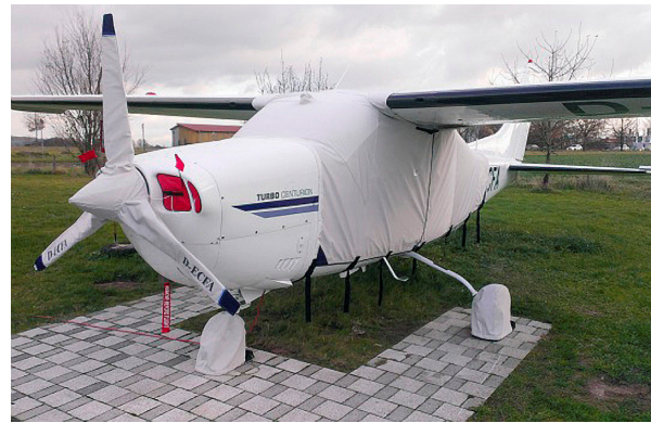
Cessna 210 Extended Canopy Cover, Engine Plugs, Prop and Tire Covers