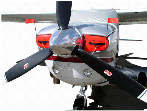
Cessna 210 Engine Plugs

Engine Inlet Plugs are custom fit for your Cessna 177 Cardinal intakes, made with heavy-duty vinyl material, and stuffed with a single block of sculpted urethane foam. Each plug has a zipper that allows the foam to be removed and dried if necessary. Engine plugs have warning flags that are visible from the cockpit or 'remove before flight' streamers sewn onto the face of the plugs. Most plugs are imprinted with the aircraft registration number in black for an extra charge. Storage bag NOT included. Engine plugs may be inserted after flight when the engine is still warm. Engine Inlet Plugs are commonly referred to as Cowl Plugs, Intake Plugs, Cowl Blocks, Engine Blocks, and Engine Bungs.