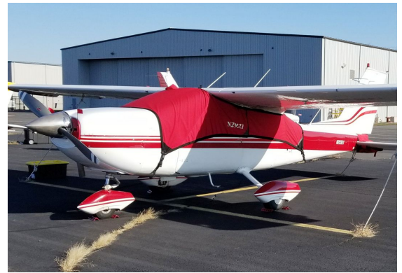
Cessna 177 Wrap Around Canopy Cover