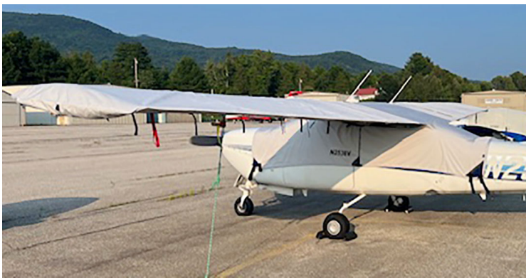
Cessna 177 Cardinal Over-Top Canopy Cover, extends to cover gas caps, & Wing Covers

Some high value aircraft end up logging lots of hangar time, and become dust magnets in the process. A high quality, well fitting dust cover provides easy assurance that the aircraft's surfaces remain clean and free of grit and grime. Available in a large variety of colors, each dust cover is custom made according to aircraft details and customer preferences. Fire retardant fabrics are also available.