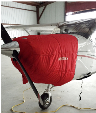
Cessna 172 Insulated Engine Cover