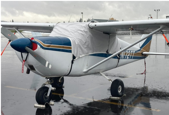
Cessna 172B Wrap Around Canopy Cover