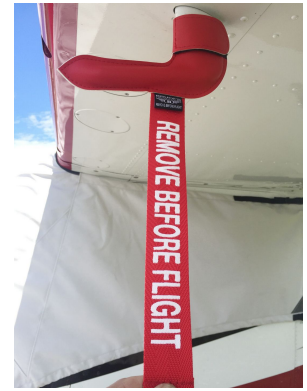
Cessna A185F Pitot Cover