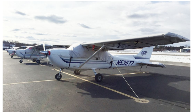
Cessna 172 Engine Plugs and Canopy, Wing, Horizontal Stabilizer Covers