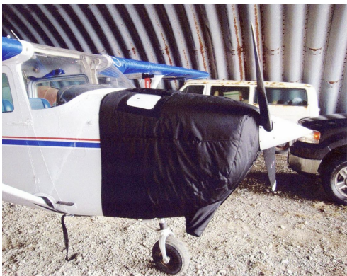
Cessna 172 Insulated Engine Cover, Fully Enclosed

This cover type is made from Silver Acrylic Sunbrella canvas and is 100% lined with a soft and smooth microfiber. Bruce's Custom Covers developed this material combination especially for aircraft protection. The outer material is medium weight and treated for water resistance, UV resistance and anti-static buildup. The inner lining is a very soft and smooth microfiber to prevent scratching. The material is very reflective, and tests show that the cabin interior temperature can be reduced to near-ambient temperature on the hottest of days. It is water, ice and snow repellent, yet breathable to allow moisture to escape from between the cover and the aircraft surface.