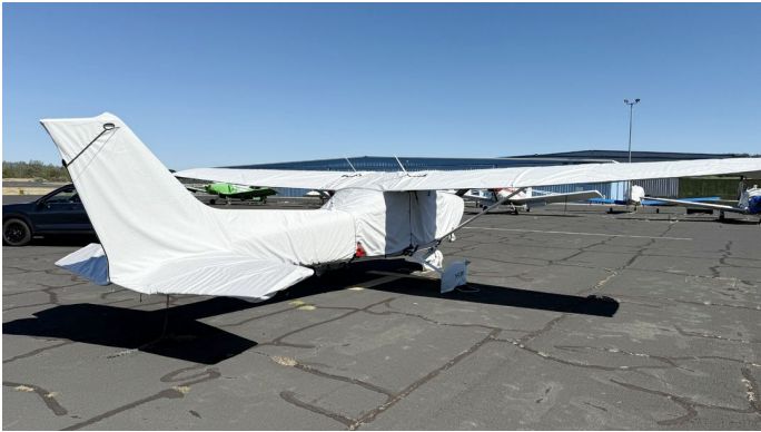
Cessna 172M Complete Cover Set

protection and cover longevity. This heavier more durable material is intended for all weather conditions, such as rain and snow or lots of sun.