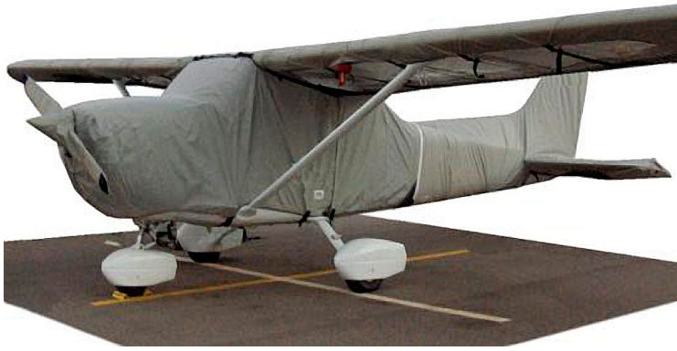
Cessna 172 Propellor Cover, 2 Blade