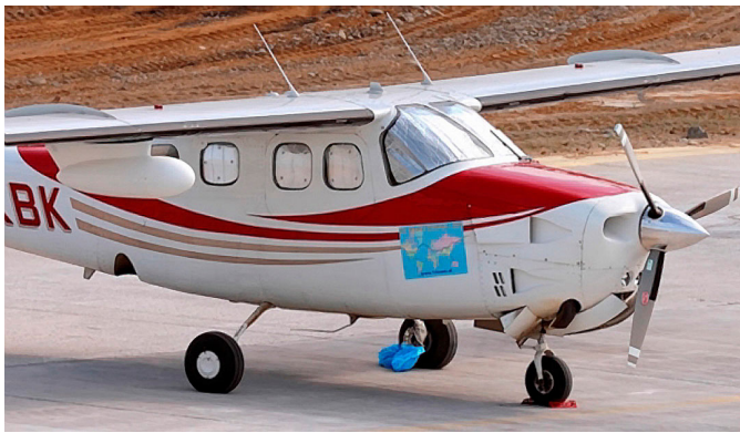
Cessna P210 HeatShield Set

Windshield Heatshields are interior sunshades for an aircraft's front windshield. The product is a unique composite of closed-cell foam with a silver mylar finish. The semi-rigid design is stiff enough to stand along the inside of the windshield using sun visors or window framing. It folds up flat and easily stores in the included storage sleeve. Some designs may require velcro and suction cups or split right and left sides. A Heatshield is an excellent short-term remedy for cockpit overheating. An external fabric cover is far more effective and practical for long-term protection.