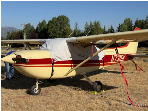
Cessna R172K Canopy Cover (over-top-type style) extends over gas caps

This cover type is made from Silver Acrylic Sunbrella canvas and is 100% lined with a soft and smooth microfiber. Bruce's Custom Covers developed this material combination especially for aircraft protection. The outer material is medium weight and treated for water resistance, UV resistance and anti-static buildup. The inner lining is a very soft and smooth microfiber to prevent scratching. The material is very reflective, and tests show that the cabin interior temperature can be reduced to near-ambient temperature on the hottest of days. It is water, ice and snow repellent, yet breathable to allow moisture to escape from between the cover and the aircraft surface.