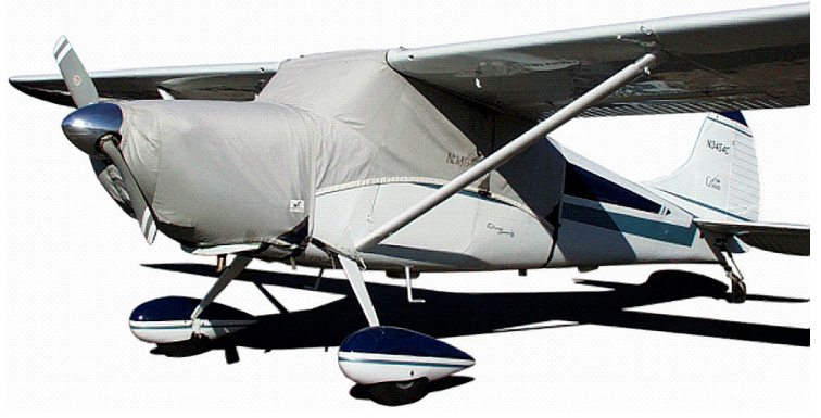
Cessna 170 Canopy Cover & Engine Cover