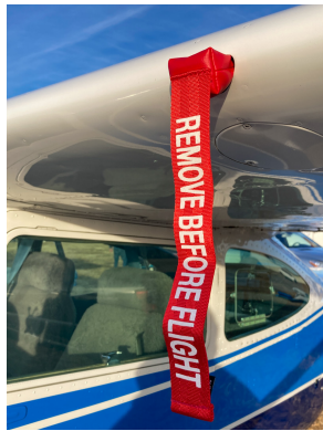
Cessna 172 & 175 (T-41) Fresh Air Inlet Plugs (Near Wing Roots)

Engine Inlet Plugs are custom fit for your Cessna 172 & 175 (T-41) intakes, made with heavy-duty vinyl material, and stuffed with a single block of sculpted urethane foam. Each plug has a zipper that allows the foam to be removed and dried if necessary. Engine plugs have warning flags that are visible from the cockpit or 'remove before flight' streamers sewn onto the face of the plugs. Most plugs are imprinted with the aircraft registration number in black for an extra charge. Storage bag NOT included. Engine plugs may be inserted after flight when the engine is still warm. Engine Inlet Plugs are commonly referred to as Cowl Plugs, Intake Plugs, Cowl Blocks, Engine Blocks, and Engine Bungs.