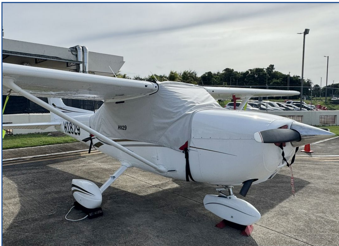
Cessna 172N Canopy Cover, Wrap-Around