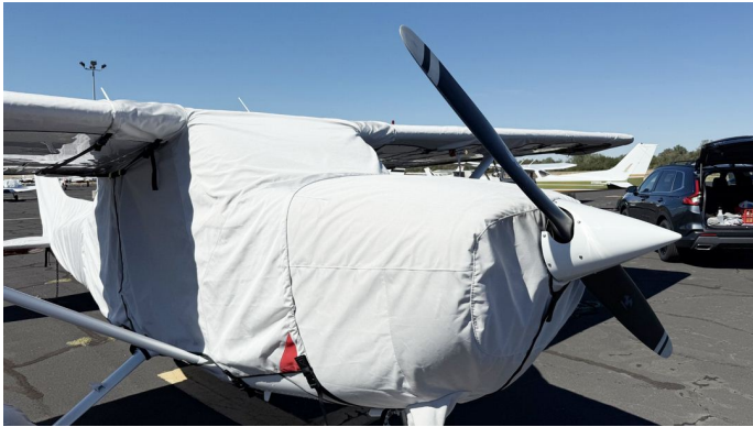
Cessna 172M Complete Cover Set