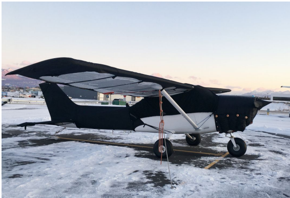
Cessna 172 Canopy, Engine, Prop, Wing & Empennage Covers

WINTER USE MATERIAL - Made with Solution-Dyed Polyester fabric, this option is intended for seasonal use to aid in deicing, rain mitigation, or for occasional travel. The material is lighter and more compact, but more susceptible to UV damage and may have a shorter useful life if used continuously outside than the all-year use material.