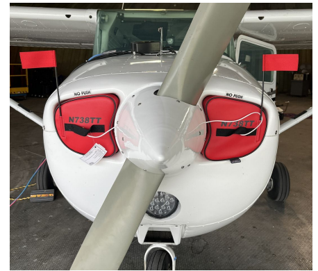
Cessna 172N engine inlet plugs