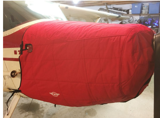
Cessna 170 Insulated Engine Cover