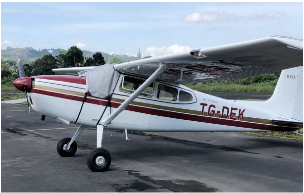
Cessna 180 Windshield Cover