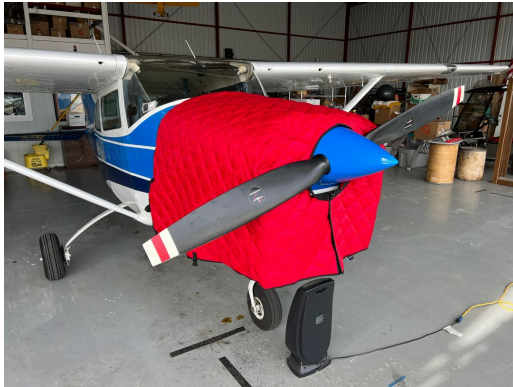
Insulated Hangar Blanket on Cessna 182

This cover type is made from Silver Acrylic Sunbrella canvas and is 100% lined with a soft and smooth microfiber. Bruce's Custom Covers developed this material combination especially for aircraft protection. The outer material is medium weight and treated for water resistance, UV resistance and anti-static buildup. The inner lining is a very soft and smooth microfiber to prevent scratching. The material is very reflective, and tests show that the cabin interior temperature can be reduced to near-ambient temperature on the hottest of days. It is water, ice and snow repellent, yet breathable to allow moisture to escape from between the cover and the aircraft surface.