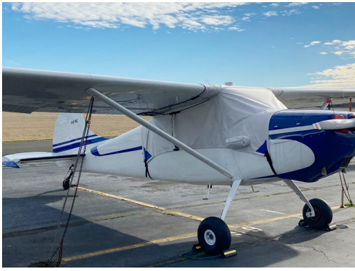
Cessna 170B Canopy Cover