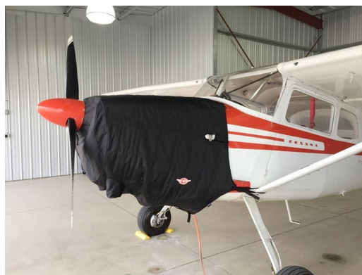
Cessna 170 Insulated Engine Cover