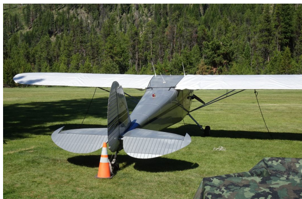
Cessna 170 Insulated Engine Cover, Wing Covers