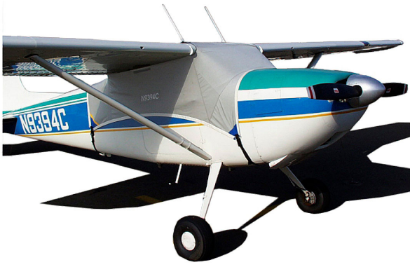
Cessna 180 Canopy Cover