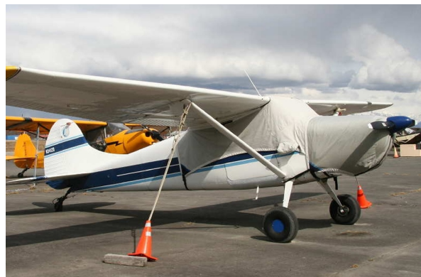
Cessna 170 Canopy Cover & Engine Cover