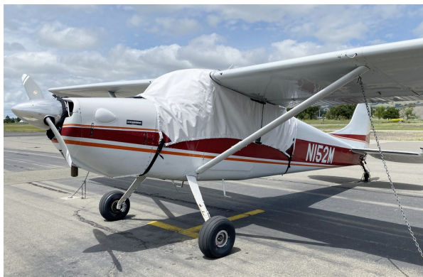
Cessna 170B Canopy Cover, Wrap-Around, Metal Wing Models