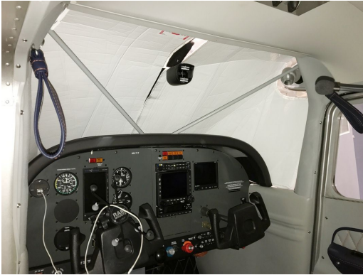
Cessna 180 Skywagon Windshield Heatshield, (W/ Compass)

Windshield Heatshields are interior sunshades for an aircraft's front windshield. The product is a unique composite of closed-cell foam with a silver mylar finish. The semi-rigid design is stiff enough to stand along the inside of the windshield using sun visors or window framing. It folds up flat and easily stores in the included storage sleeve. Some designs may require velcro and suction cups or split right and left sides. A Heatshield is an excellent short-term remedy for cockpit overheating. An external fabric cover is far more effective and practical for long-term protection.