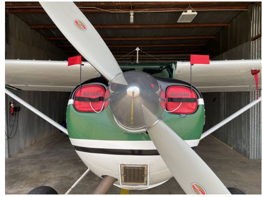
Cessna 170B Over The Top Style Canopy Cover & Engine Plugs