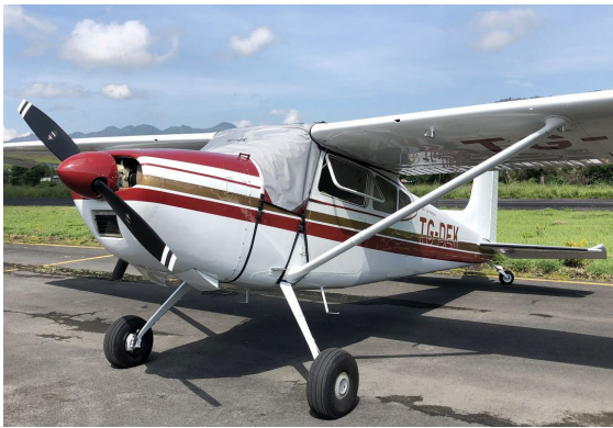
Cessna 180 Windshield Cover

This cover type is made from Silver Acrylic Sunbrella canvas and is 100% lined with a soft and smooth microfiber. Bruce's Custom Covers developed this material combination especially for aircraft protection. The outer material is medium weight and treated for water resistance, UV resistance and anti-static buildup. The inner lining is a very soft and smooth microfiber to prevent scratching. The material is very reflective, and tests show that the cabin interior temperature can be reduced to near-ambient temperature on the hottest of days. It is water, ice and snow repellent, yet breathable to allow moisture to escape from between the cover and the aircraft surface.