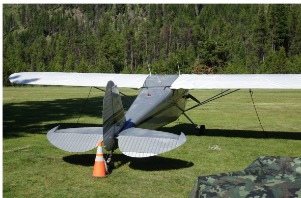
Cessna 170 Wing Covers

WINTER USE MATERIAL - Made with Solution-Dyed Polyester fabric, this option is intended for seasonal use to aid in deicing, rain mitigation, or for occasional travel. The material is lighter and more compact, but more susceptible to UV damage and may have a shorter useful life if used continuously outside than the all-year use material.