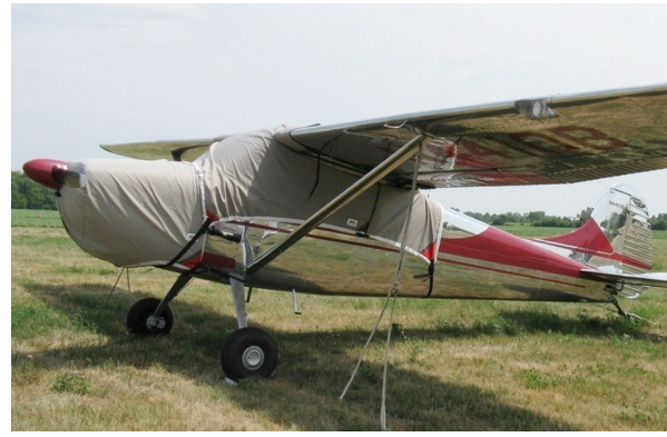
Cessna 170B Canopy & Engine Covers