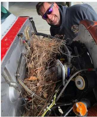
Cessna 172 Bird Nest Problem