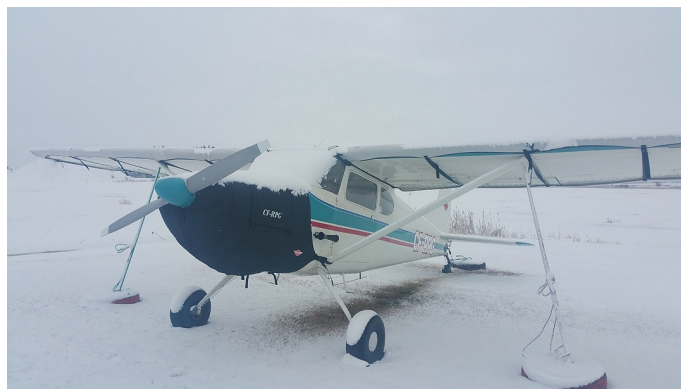
Cessna 170 Insulated Engine Cover, Wing Covers