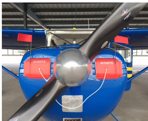
Cessna 170 Engine Inlet Covers (cards)

This cover type is made from Silver Acrylic Sunbrella canvas and is 100% lined with a soft and smooth microfiber. Bruce's Custom Covers developed this material combination especially for aircraft protection. The outer material is medium weight and treated for water resistance, UV resistance and anti-static buildup. The inner lining is a very soft and smooth microfiber to prevent scratching. The material is very reflective, and tests show that the cabin interior temperature can be reduced to near-ambient temperature on the hottest of days. It is water, ice and snow repellent, yet breathable to allow moisture to escape from between the cover and the aircraft surface.