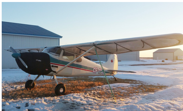
Cessna 170 Insulated Engine Cover, Wing Covers