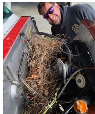
Cessna 172 Bird Nest Problem