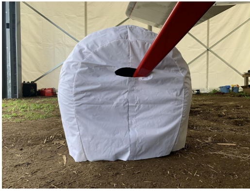
Cub Crafters CC19 Oversize Tire Covers, test fit cover