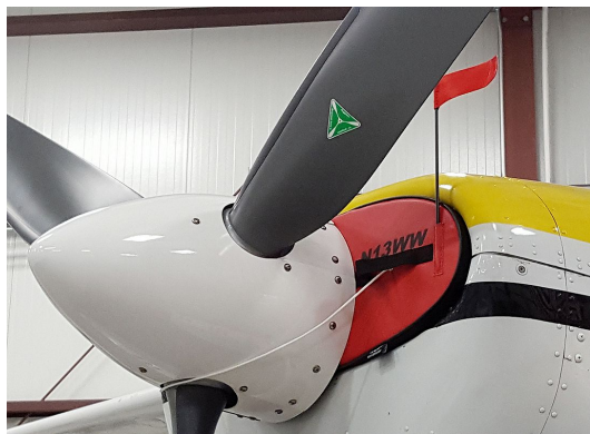
Cessna 180/185 Skywagon Engine Inlet Plugs