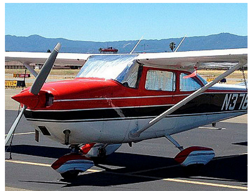
Cessna 172 Cabin HeatShields