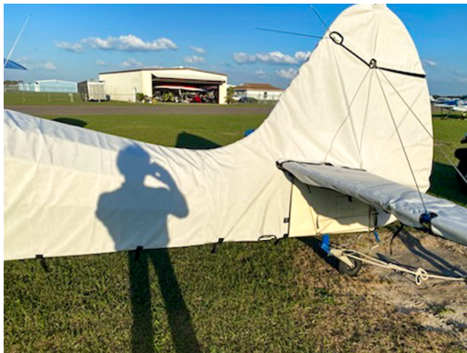
Aeronca Sedan Empennage Cover (Tailboom, Vertical & Horiz Stabilizers), All Year Use

WINTER USE MATERIAL - Made with Solution-Dyed Polyester fabric, this option is intended for seasonal use to aid in deicing, rain mitigation, or for occasional travel. The material is lighter and more compact, but more susceptible to UV damage and may have a shorter useful life if used continuously outside than the all-year use material.