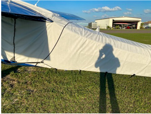
Aeronca Sedan Empennage Cover (Tailboom, Vertical & Horizontal Stabilizers), All Year Use

shorter useful life if used continuously outside than the all-year use material.