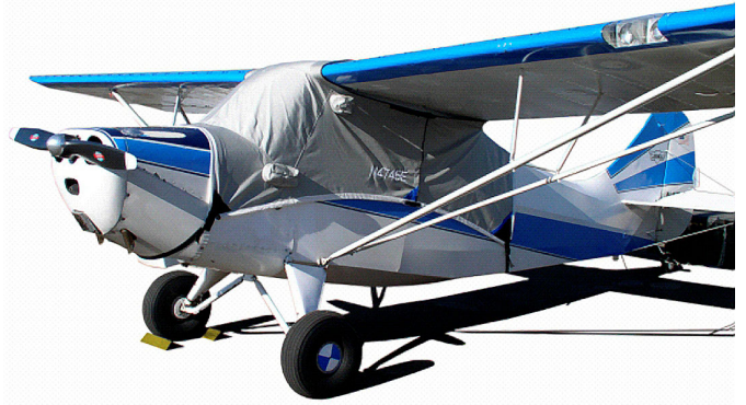
Aeronca Champ Canopy Cover