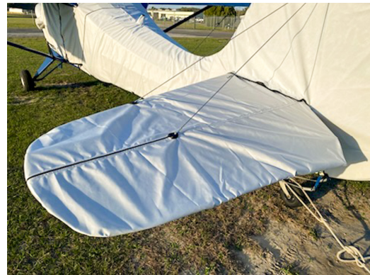
Aeronca Sedan Empennage Cover (Tailboom, Vertical & Horiz Stabilizers), All Year Use