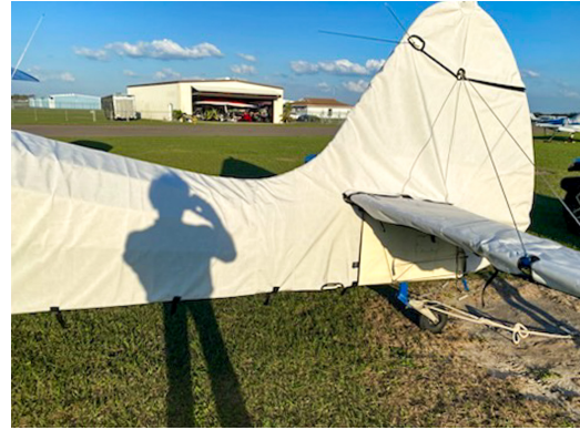
Aeronca Sedan Empennage Cover (Tailboom, Vertical & Horizontal Stabilizers), All Year Use