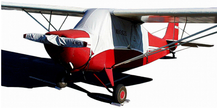
Aeronca Champ Canopy & Prop Covers

This cover type is made from Silver Acrylic Sunbrella canvas and is 100% lined with a soft and smooth microfiber. Bruce's Custom Covers developed this material combination especially for aircraft protection. The outer material is medium weight and treated for water resistance, UV resistance and anti-static buildup. The inner lining is a very soft and smooth microfiber to prevent scratching. The material is very reflective, and tests show that the cabin interior temperature can be reduced to near-ambient temperature on the hottest of days. It is water, ice and snow repellent, yet breathable to allow moisture to escape from between the cover and the aircraft surface.