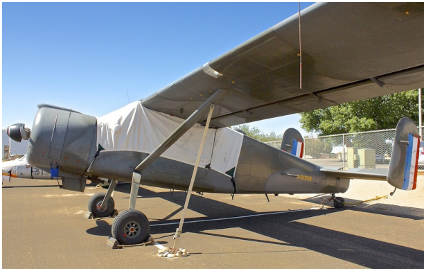
Broussard Canopy Cover

This cover type is made from Silver Acrylic Sunbrella canvas and is 100% lined with a soft and smooth microfiber. Bruce's Custom Covers developed this material combination especially for aircraft protection. The outer material is medium weight and treated for water resistance, UV resistance and anti-static buildup. The inner lining is a very soft and smooth microfiber to prevent scratching. The material is very reflective, and tests show that the cabin interior temperature can be reduced to near-ambient temperature on the hottest of days. It is water, ice and snow repellent, yet breathable to allow moisture to escape from between the cover and the aircraft surface.