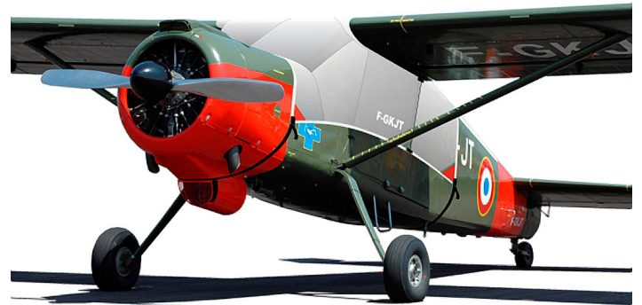
Broussard Canopy Cover (illustration)