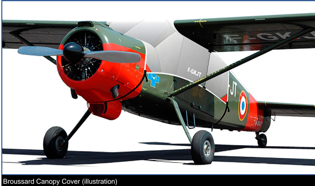
Broussard Canopy Cover (illustration)